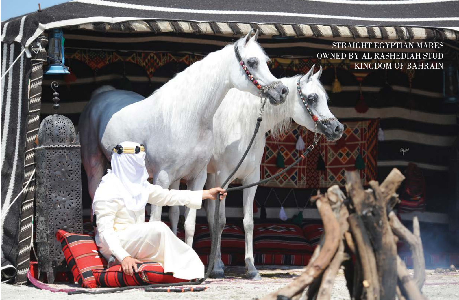
STRAIGHT EGYPTIAN MARES OWNED BY AL RASHEDIAH STUD KINGDOM OF BAHRAIN