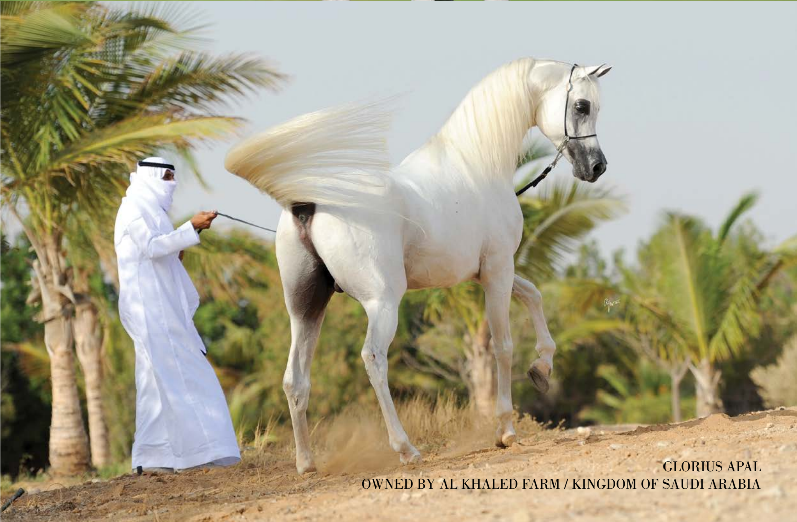
GLORIUS APAL OWNED BY AL KHALED FARM / KINGDOM OF SAUDI ARABIA