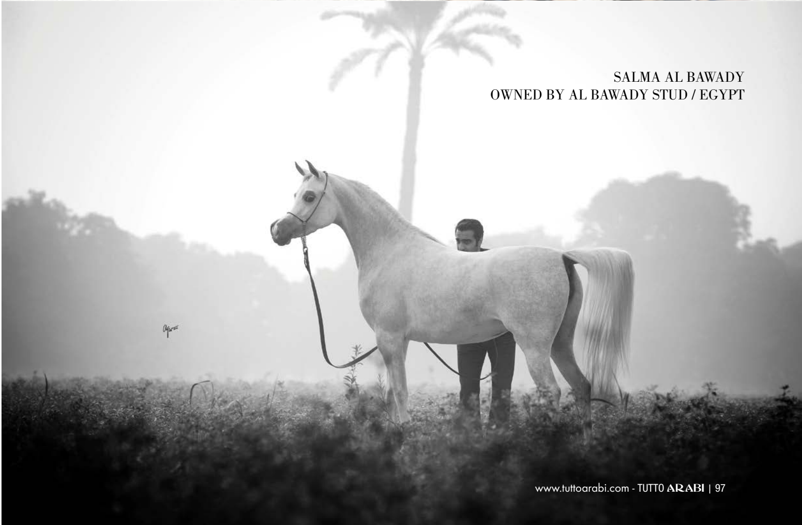
SALMA AL BAWADY OWNED BY AL BAWADY STUD / EGYPT