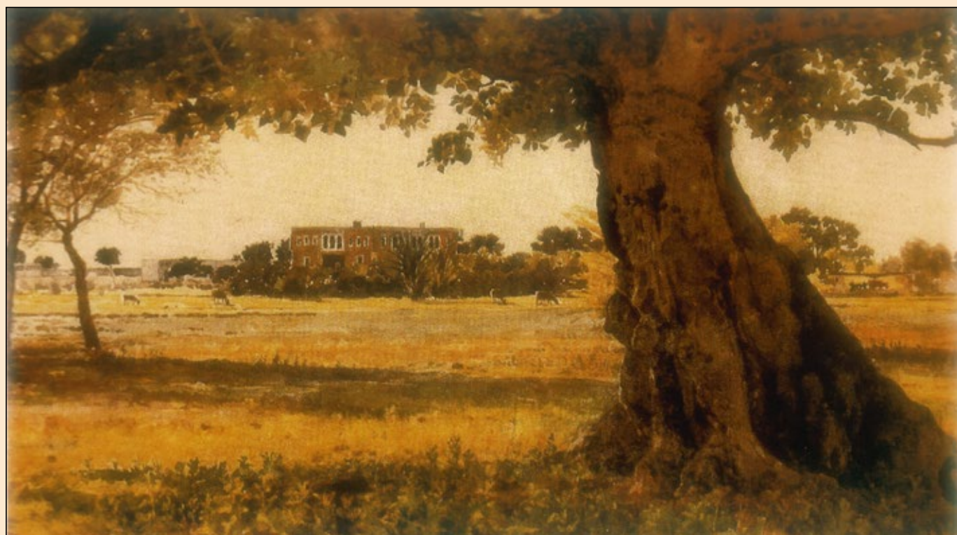
Lady Anne Blunt chose Egypt as a second home country. She bought the property Al Obeyd near Cairo, and changed it into her Egyptian Stud.