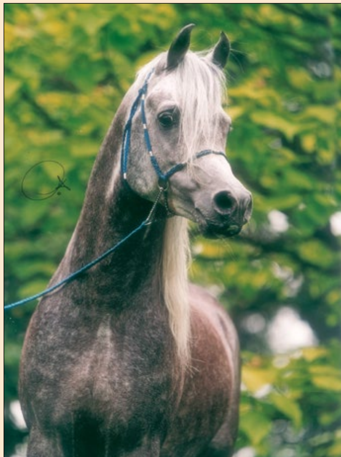
NK Hafid Jamil (Ibn Nejdy x Helala by Salaa El Dine), Katharinenhof, Germany

Still, organizations that allot these “certificates” are much coveted, since they are social networks. Browsing Facebook or respective blogs, you will find that many breeders go for these networks to take their first steps in breeding, to collect experiences, to communicate with peers – always hoping to obtain information and support. After all, even humans are herd animals embarking on exchange about common interests and feeding places.