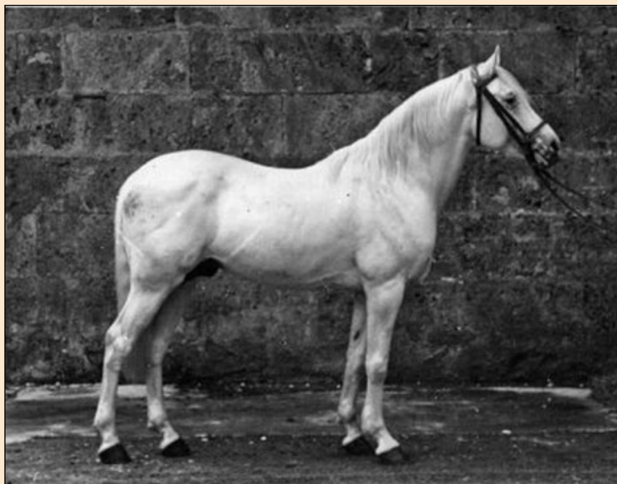
The Egypt import JASIR (Mabrouk Manial x Negma), a Kheilan type stallion, chosen by Carl Raswan for Marbach State Stud in Germany. He left some interesting daughters, a good colt did not show up.

for the the items in question, which are verification of dam and sire, analysis of clearly defined “markers” typical for certain breeds of horses or for populations, or using the mitochondria method which enables us to give a definite and unbroken line of ancestry back to the last known parent.