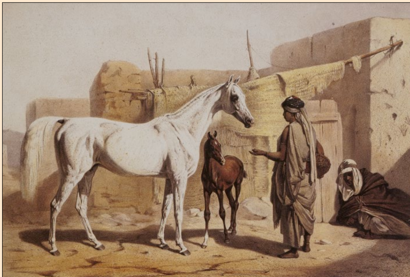
Arabian Horses originating from the south of the Arabian Peninsula, called NEJD.

organization to whom breeders will turn for interpretation? To the Pyramid Society or Al Khamza, to the Blue List, Blue Star, Asil Club, or some other Western organization that has, with passion and the dowsing rod, taken up exploring the pure source of the origin of the Bedouin horses in the Orient.