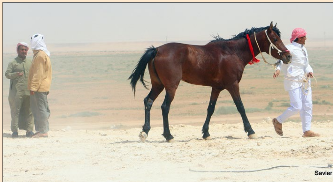
Arabian horses bred since centuries by the Shammar tribes in greater Syria.