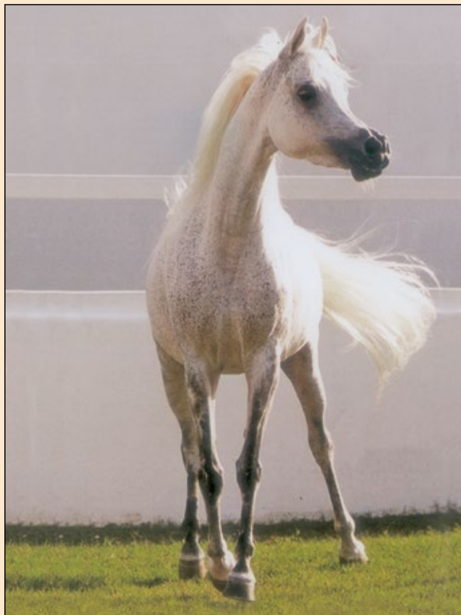
RN Farida (Salaa El Dine x Noha by Hadbahn Enzabi), Al Rayyan Farm, Qatar