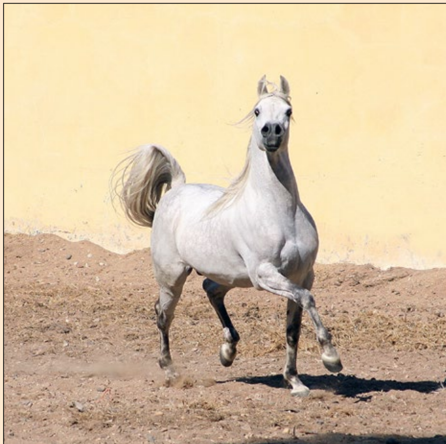
Tagrweed (Gad Allah x Tee by Adl), El Zabraa State Stud, Egypt

particularly scientific, during the last 50 years. Many an item that used to take its place among conjecture and assumption, or even speculation and pure imagination, can now be based on solid answers well grounded on the foundations of science. Due to this increase in knowledge, even the history of the Arabian horse today has left the atmosphere of uncertainties and has made its way into well-equipped laboratories where researchers have looked for solid answers and found them. Serious and interested breeders today use these undisputed facts, and the data resulting from them, for