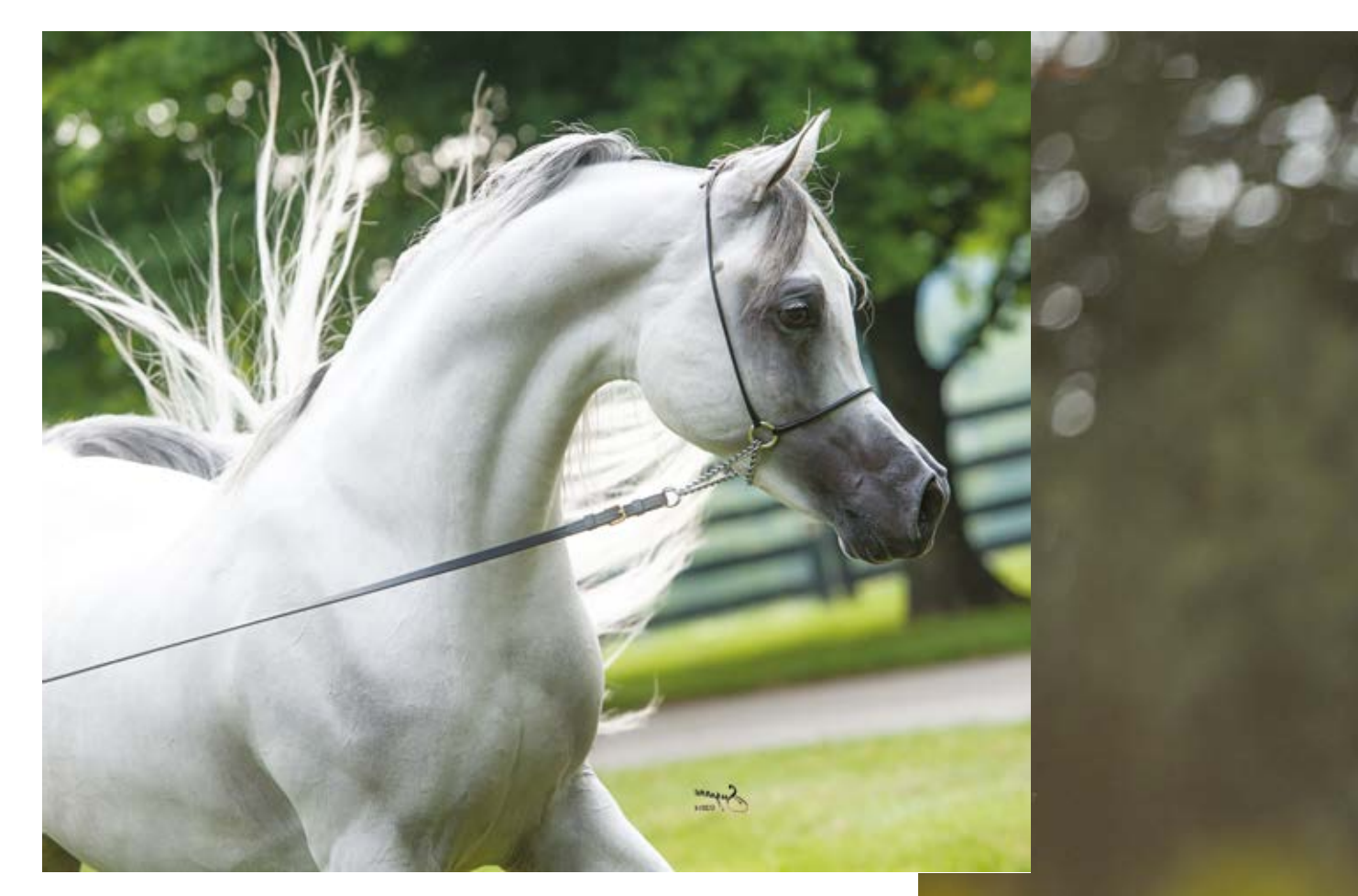
Farhoud Al Shaqab 2008 grey straight egyptian stallion