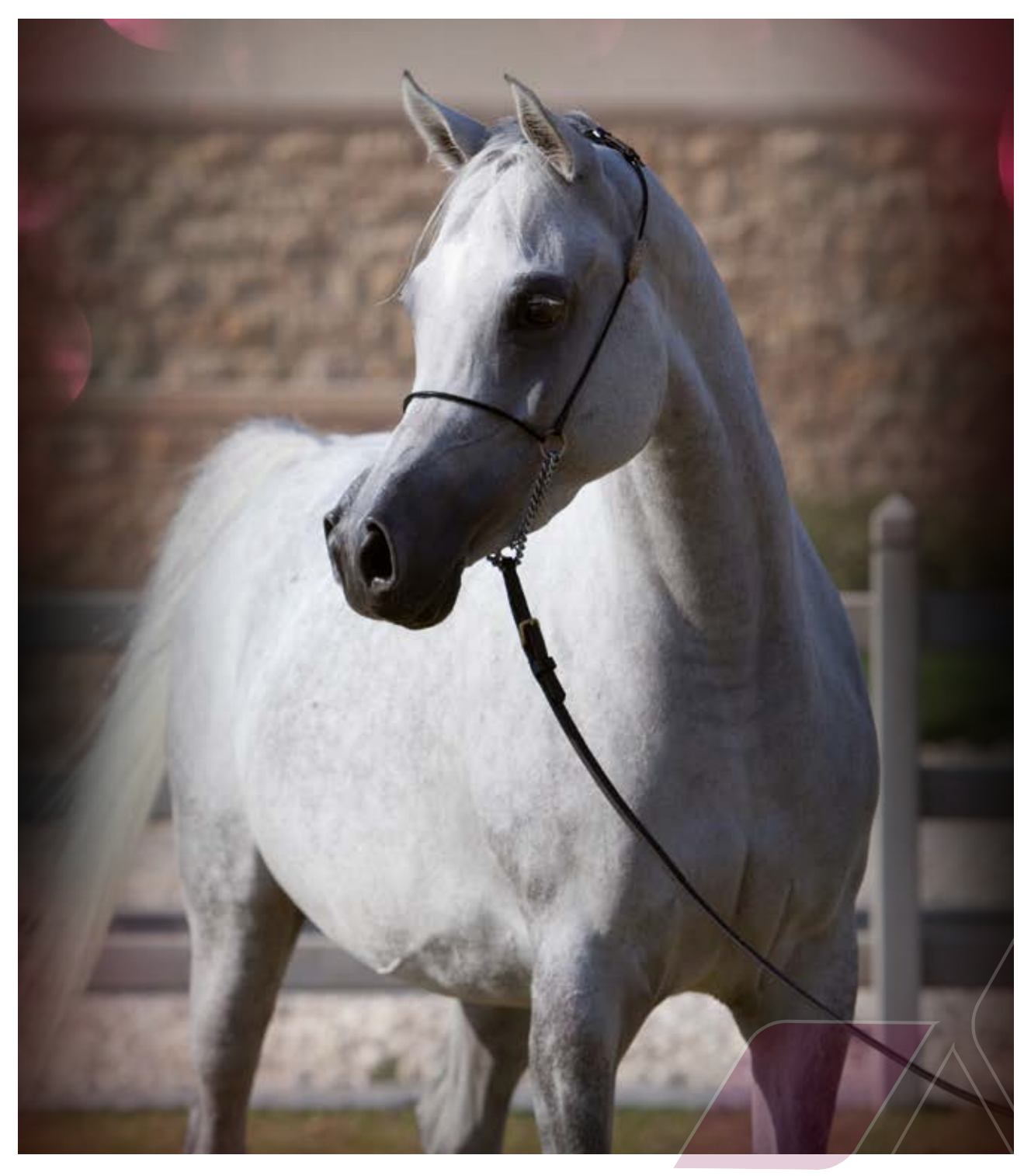
Wijdan Al Shaqab (Al Adeed Al Shaqab x Amwaj Al Shaqab) 2007 grey straight egyptian mare