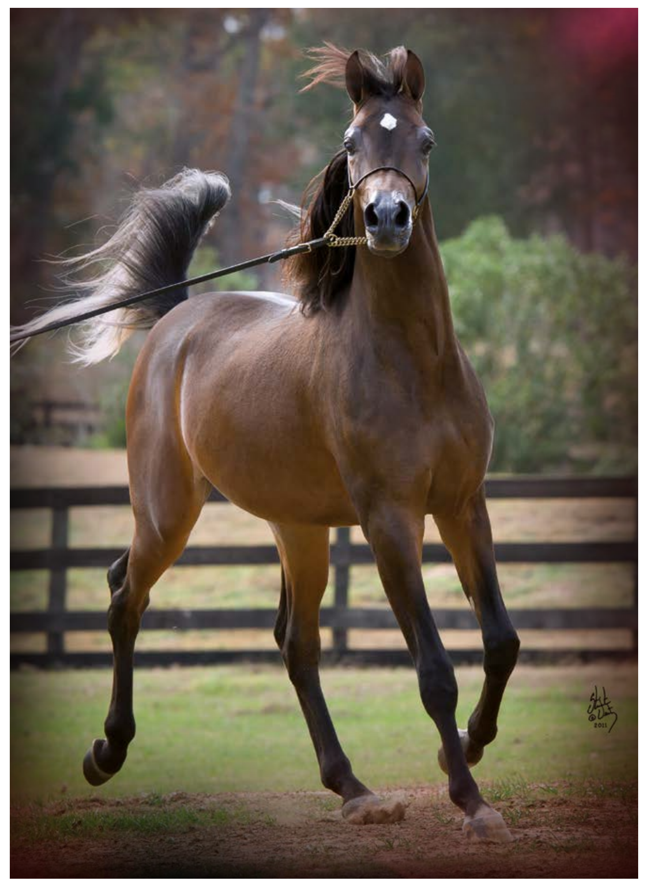
Ghasham Al Shaqab (Al Adeed Al Shaqab x Gazala Al Shaqab) 2010 bay colt