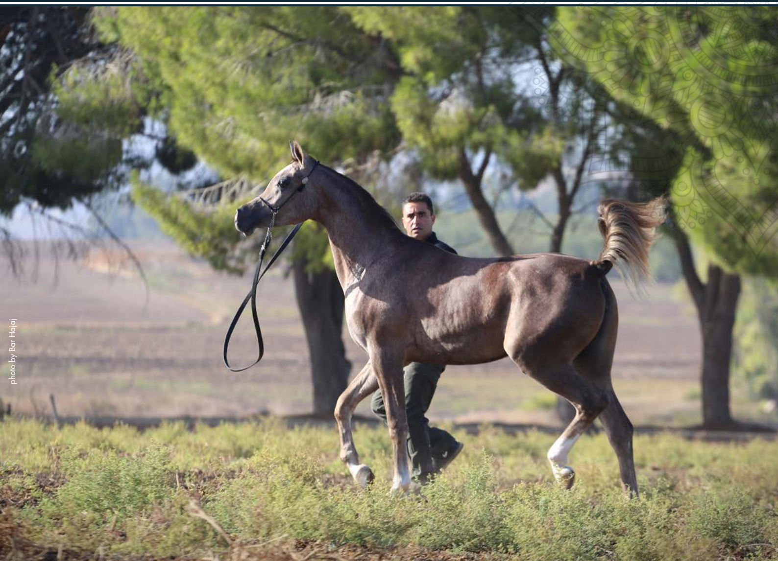
Sajida AA ( x Safiyyah AA)

look at him, but only inside his stall. That was more than enough to convince us to lease him for two seasons. The deal was made before the show began.”