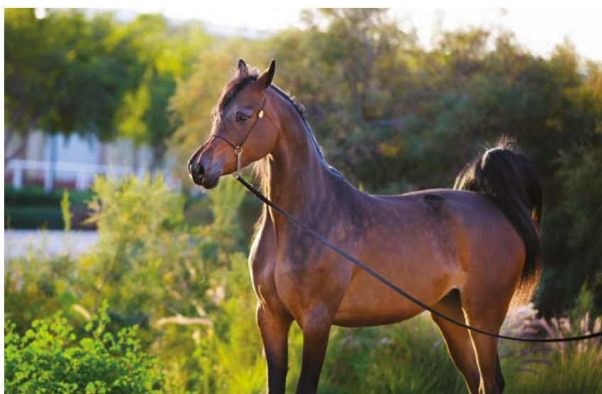
Burza (Kahil Al Shaqab x Bursa) 2013 Filly Owned by Al Shaqab