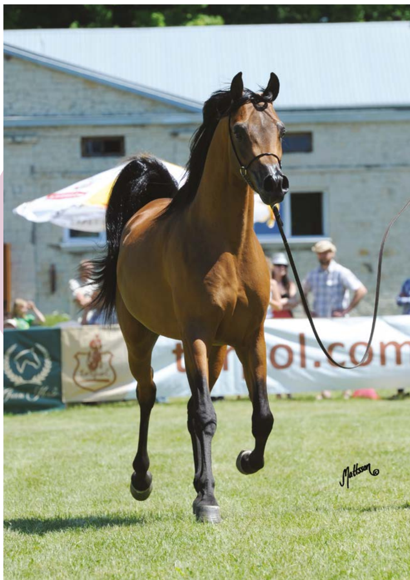
Morion (Kahil Al Shaqab x Mesalina) 2013 Colt

2015 Gold World Champion Colt. Bred and owned by Michalow State Stud. Leased by Al Thumama Stud.