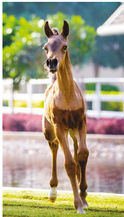
2015 Filly (Kahil Al Shaqab x Lubna Al Shaqab)