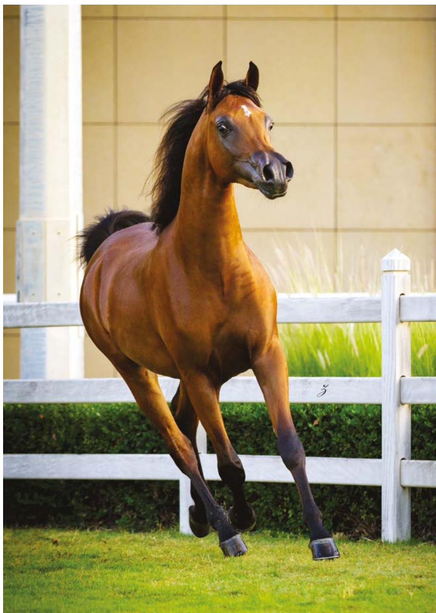
Baher Al Shaqab (Kahil Al Shaqab x Vanessa Al Shaqab) 2014 Colt

is equally balanced with intelligence, kindness, trainability, and presence ... that indefinable sense of self that cannot be trained into any horse. Kahil Al Shaqab breeds true to his heritage, which extends back through the studbooks of many nations including Brazil and the U.S., Egypt and Poland, Russia and England, all the way to the original desert horse first developed centuries ago by the Bedouins of Arabia and the Middle East.