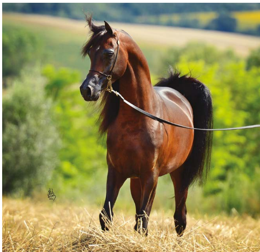
Wadee Al Shaqab (Marwan Al Shaqab x OFW Mishaahl) 2010 Stallion full brother to Kahil Al Shaqab