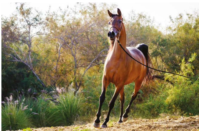
Aswar Al Shaqab (Kahil Al Shaqab x Hathfa Al Shaqab) 2013 Filly