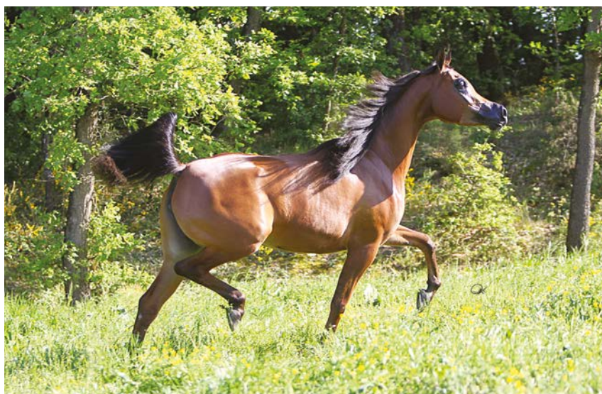
Al Anood Al Shaqab (Kahil Al Shaqab x Miss El Power JQ) 2013 Filly