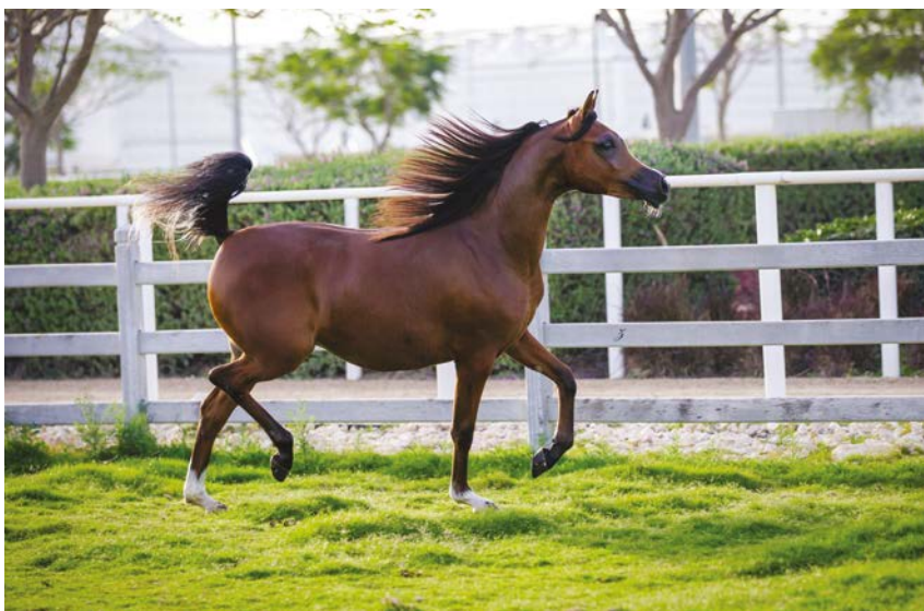
Madeeha Al Shaqab (Kahil Al Shaqab x QR Annah Ferrari) 2015 Filly

spirited presence. When Kahil enters the ring, he demands the undivided attention of every onlooker. His classic silhouette and fiery nature are tempered by his abundant intelligence and joy of life. His energy infects every audience, who in turn support him with exuberant enthusiasm. In some ways, Kahil Al Shaqab is an ambassador for the Al Shaqab vision of the Arabian ideal.