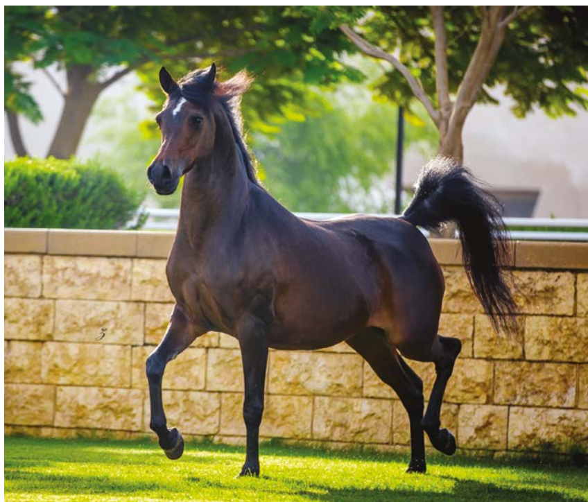
OFW Mishaahl (Mishaah x OFW Balarina) 2002 Mare