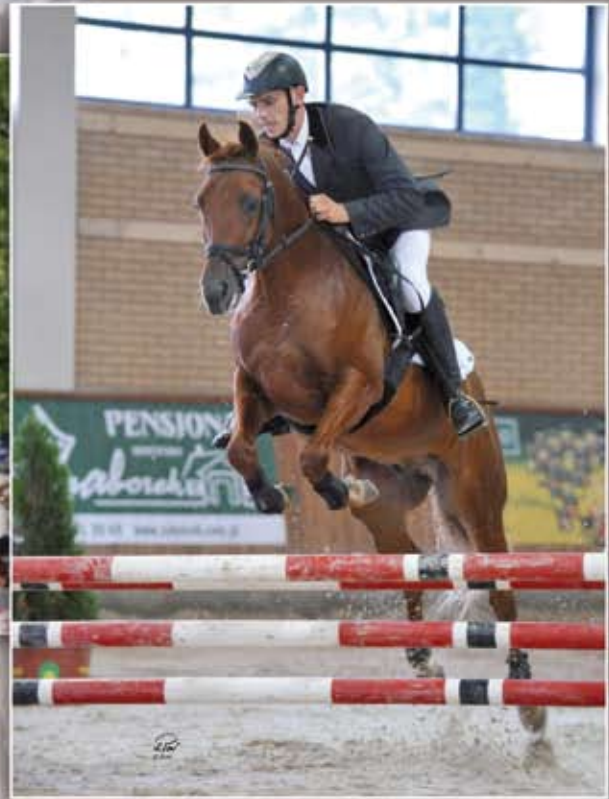
Galahad (Werbum - Granada by Monogramm)

twice Top Five at Vilhelmsborg A-show. Wojstaw sired mares happened to be very valuable broodmares significant in breeding and shows and their get and grandget was successfully spread around the world such as Ewina, out of Ewina by Wojstaw (sold to Belgium for 55 000 euro) – exported to Italy, Slonka – who produced Szanta (by Ekstern) – 2005 Vilhelmsborg ECAHO A-show Internationals Jr. Reserve Champion Mare for Falborek Arabians, Zorza Polarna at Czeple Arabians – dam of outstanding broodmare Zeksterna (by Ekstern), mother to two show and breeding colts Zimarc (by QR Marc) and Zachary (by Psytadel) as well as very exotic filly Zizi (by Enzo). Wojstaw offspring was also famous for its outstanding performance abilities – besides Emanor and Druid mentioned above two of his daughters – Estelka and Salsa were Oaks winners and the colt Sabat was always placed in money at important stakes races and winning 4 of them, now chief sire at Janów Podlaski Stud, Poland. In 2002 Marsha's Parkinson persistence paid off, and finally Michałów Stud agreed that Wojstaw joined his sisters, Weltawa (by Arbil), Wilenka (by Tallin) and Walencia (by Goliat) at Marsha's Canterbury Farm in Maryland where he continues to breed.