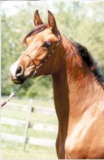
Walencia (Goliat - Wilejka)