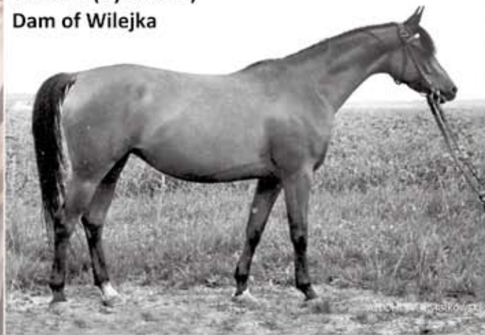
Warmia (by Comet) Dam of Wilejka