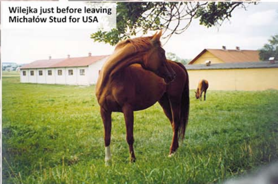
Wilejka just before leaving Michałów Stud for USA

WILEJKA to be reflected in fields for decades to come