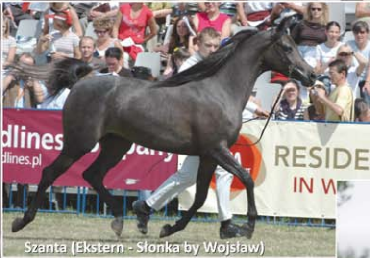
Szanta (Ekstern - Słonka by Wojsław)