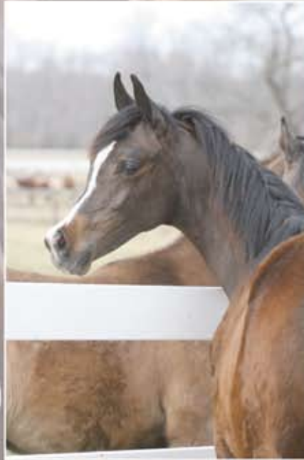
Wiazanka (Equifor - Weltawa [Wilejka])