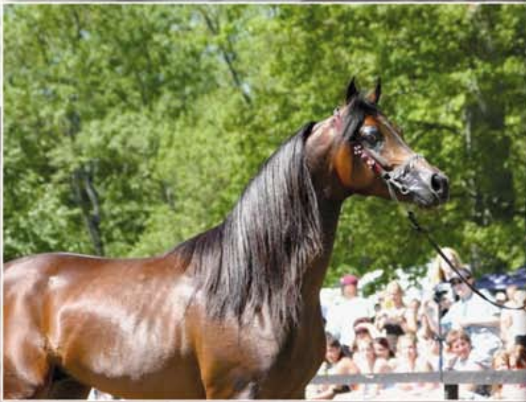
Beduin (Wojstaw - Bogdanka)