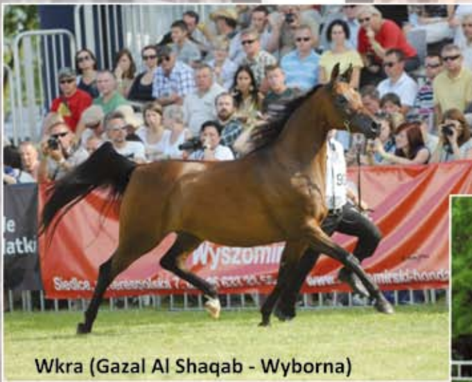
Wkra (Gazal Al Shaqab - Wyborna)