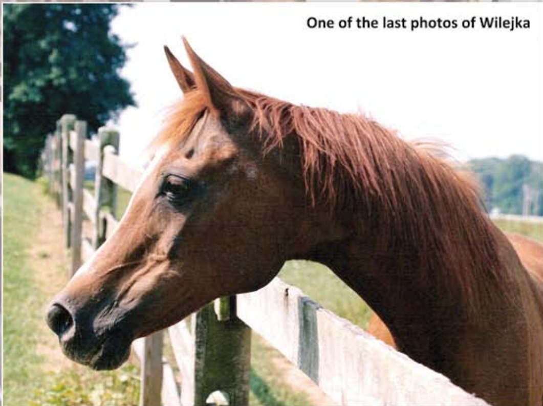
One of the last photos of Wilejka

WILEJKA to be reflected in fields for decades to come