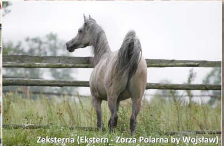
Zeksterna (Ekstern - Zorza Polarna by Wojsław)