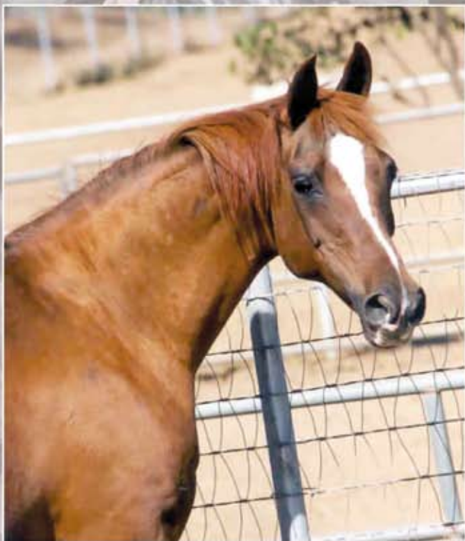
Wilejka (El Paso x Warmia)