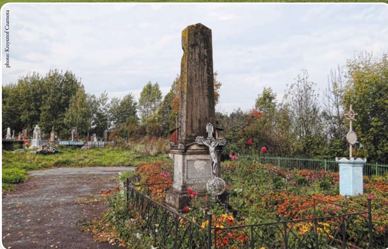
Jarczowce. The grave of the Dzieduszycki family