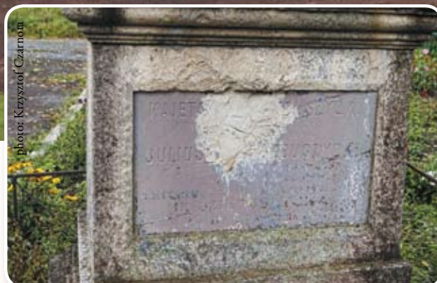
The tombstone of the Dzieduszycki family