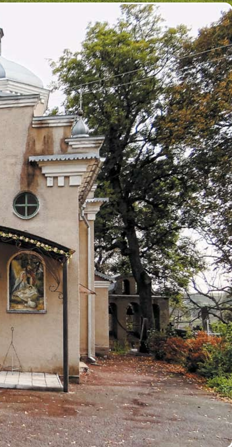
Jarczowce. The Orthodox church and cemetery