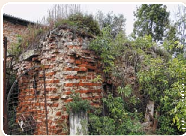
The ruins of the palatial cellars

The love for horses and their breeding in the aristocratic family of the Dzieduszycki counts was almost hereditary. Over the centuries the representatives of this family managed many studs scattered on the lands of the then Galicia. Their love, especially for oriental horses, was so huge, that it was often joked that they descend from the Arabian horse.