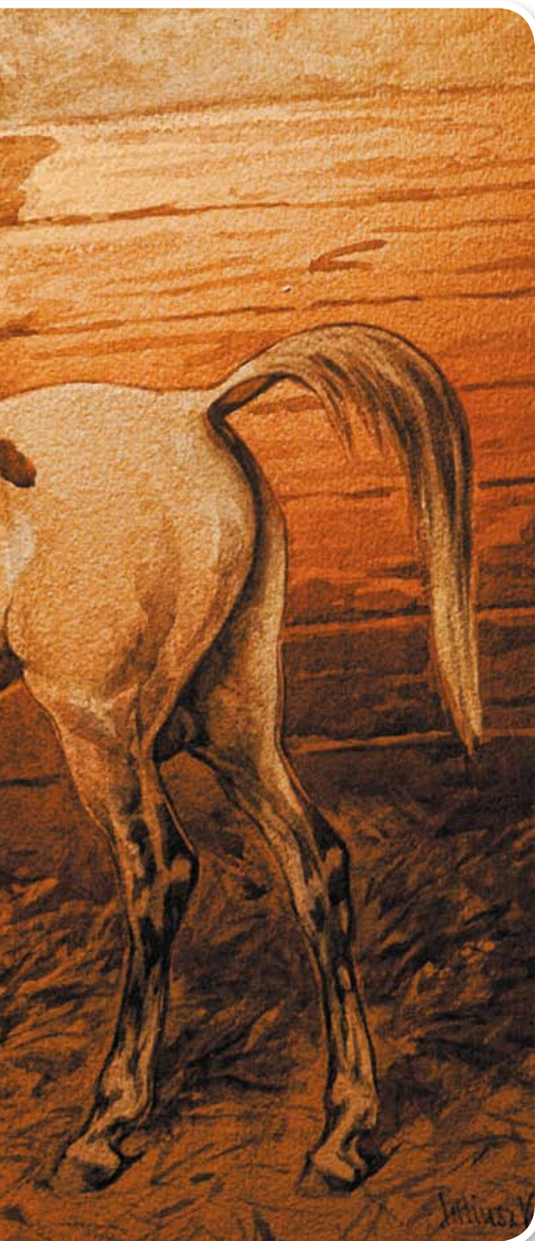
Bagdad, by Juliusz Kossak, 1890. The painting is a private property

IT IS FROM THERE THAT THE MOST EXQUISITE, WORLD FAMOUS DAM AND SIRE LINES ORIGINATE. IT IS THERE THAT THE MOST REFINED HORSES WERE IMPORTED TO FROM THE DESERT.