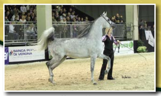
Verona 2011