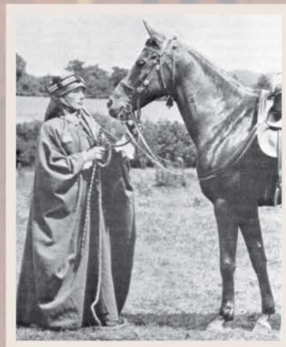
Lady Ann Blunt