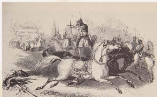
Equestrian exploits of the Circassian mamelukes 19th century graving