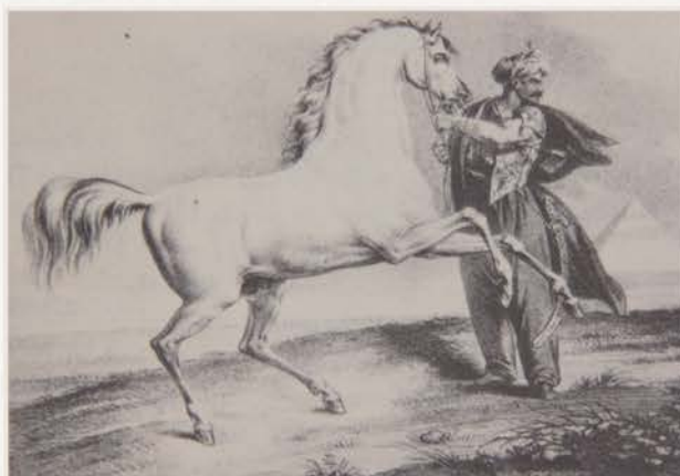
Arab horse and Maemluke. Carle Vernet

was in creating elaborate palaces in which to live, elaborate mosques adorned with beautiful tiles and carvings, and filling the city with the most beautiful monuments that can be found anywhere, all for their own pleasure. They were not interested in building utilitarian structures, such as canals, libraries or schools that might improve the quality of living for everyone. To the Mameluke, the National people of Egypt were nothing more than peasants meant to be used as slaves. They imposed high taxes on the Egyptians, and terrorized them at every opportunity.