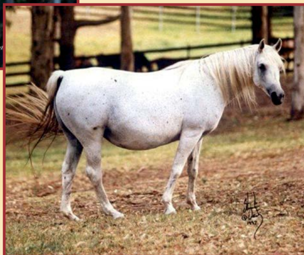
The classic Simeon foundation mare, Simeon Safanad (Sankt Georg x 27 Ibn Galal - 5).

Ibn Galal, also known as 'Magdi', was, like Hosna, a Hadban Enzahi in strain and a very tightly-bred individual. In fact, he was 'pure in the strain' or 'double' Hadban, tracing through both sire and dam to the important Sheikh el Arab daughter Yosreia (Hind), best remembered as the dam of the