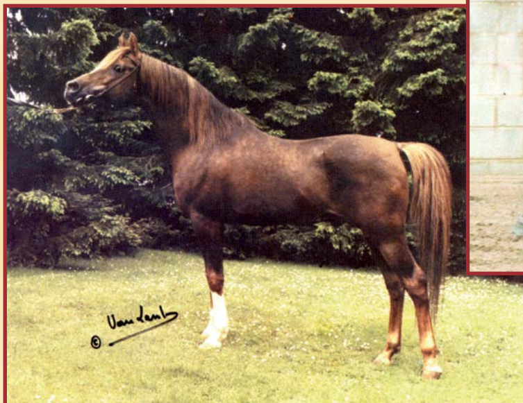
The 1966 stallion Ibn Galal or 'Magdi' (Galal x Mohga), bred by the EAO and Chief Sire at Babolna during the '70's, was an excellent sire and proved the perfect mate for Hosna.