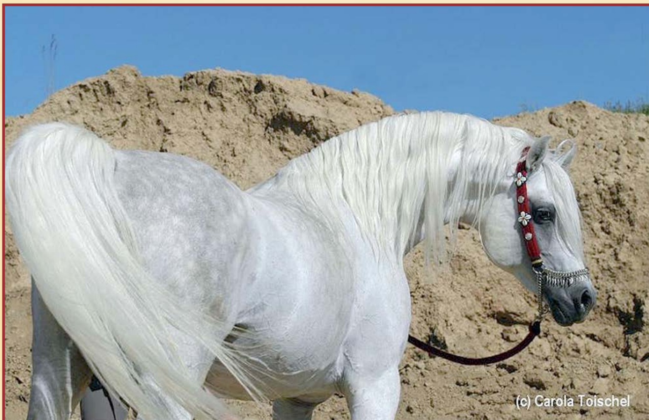
The stallion Ibn Halim Shah I-1 by Orashan out of Halim Shah I-1 (Halim Shah I x 227 Ibn Galal) as a young horse in Germany.