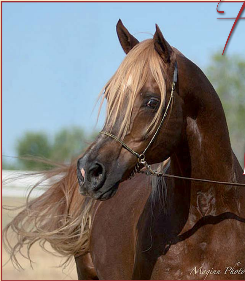
The proven halter and performance sire Simeon Sochain (Simeon Sadik x Simeon Simona) was recently exported to North America.

extremely balanced and athletic Arabians with wonderful type and expression, particularly beautiful eyes, great depth and substance, sound limbs and feet, full pigmentation (including particularly vibrant chestnut hues), excellent movement, faultless tail carriage, and ideal temperament. Studying the photos accompanying this article will tell the story far better than words.