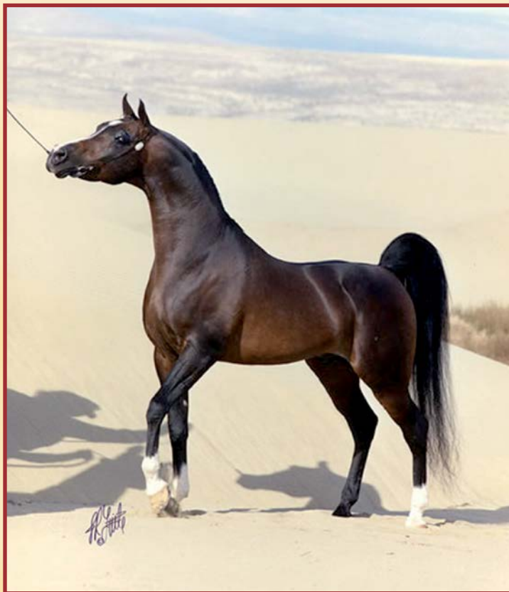
The unforgettable 1984 stallion Simeon Shai (Raadin Royal Star x Simeon Safanad).