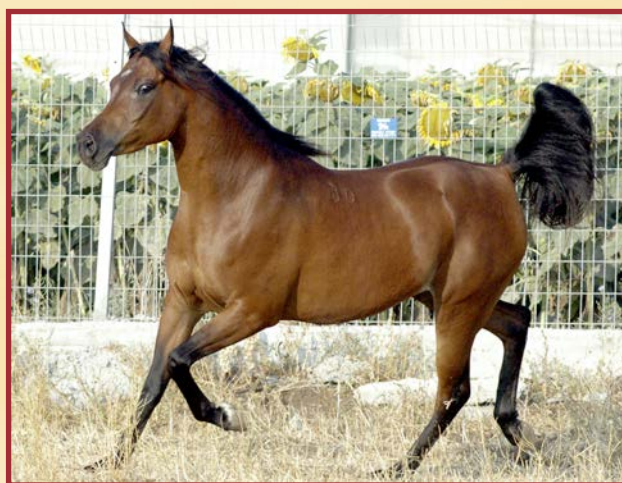
The 2000 mare Hila B (Efendi B x Haniya B out of 227 Ibn Galal I) chosen as a weanling at Babolna for Idan Atiq.

Why was this mare so intriguing, and just who, in fact, was Hosna?