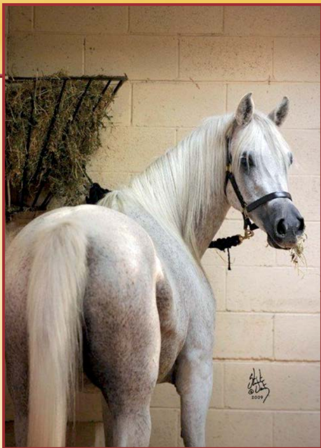
Simeon Saada, an Asfour daughter out of Simeon Safanad (Sankt Georg x 27 Ibn Galal - 5).