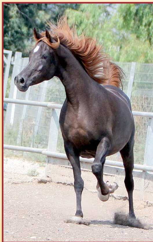
The 2000 mare Hora B (Halim Shah I x 216 Haszuna B out of 227 Ibn Galal I), imported to Israel as a weanling.

remained silent, and turned back to the Director. Turning back to the mare, my eyes chanced upon the sign hanging high above the stall, which quickly solved the riddle of her identity. According to the sign, this was 227 Ibn Galal I, an 18-year old straight Egyptian mare, sired by former Babolna Chief Sire, Ibn Galal I, a son of the celebrated mare Hanan (Alaa el Din x Mona). Her dam was 202 Ibn Galal, which meant that she was a direct maternal granddaughter of the original Egyptian import, Hosna.