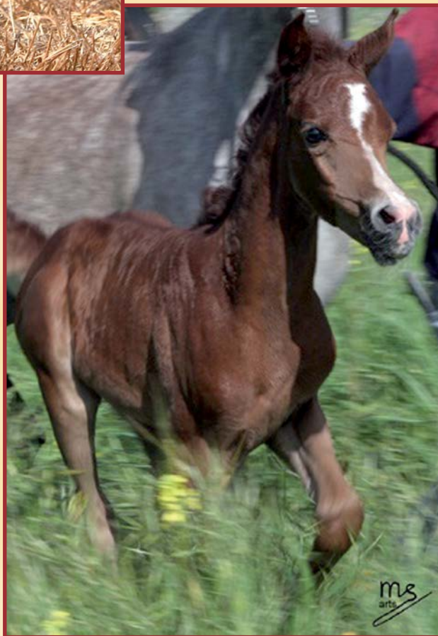
The 2007 filly Atiq Hadas (MD Elesperado x Hopa B).