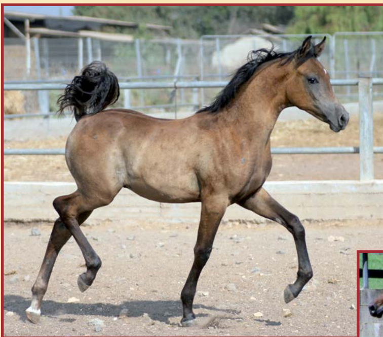
The 2006 stallion Atiq Hilal (Laheeb x Hila B), now a herd sire at Idan Atiq.