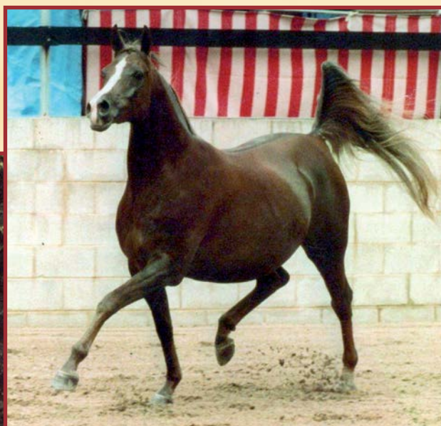
27 Ibn Galal-5, or 'Galal', imported foundation mare for Simeon Stud, demonstrates the flagged tail carriage and powerful fluid movement for which the Hosna family is justly famous.