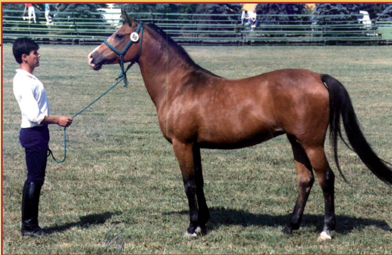
202 Ibn Galal spent her entire life in Hungary and was the SE daughter who carried Hosna's family forward at Babolna. When we saw her at age 24 she was still in excellent shape and was a tremendous mover with exceptional tail carriage. Pictured here as younger mare.