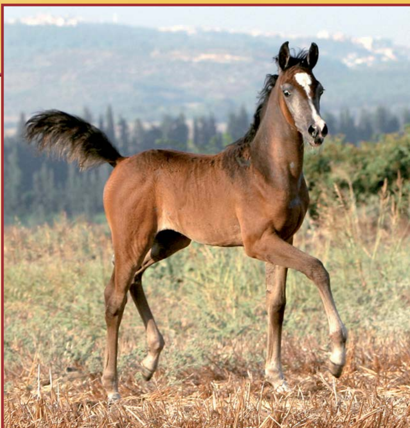
2009 filly Atiq Dimona (Simeon Sharav x Hila B) combines the blood of the two full sisters 202 Ibn Galal and 27 Ibn Galal - 5.

Hosna's dam Rida was a daughter of the influential Shabloul son El Sareei. Rida traced back in tail-female to the very significant 'double Hadban' mare Hind (Ibn Rabdan x Bint Rustem), founder of a prolific branch of Egypt's famous Hadban Enzabi family. Her maternal granddam, Rouda, was sired by the key broodmare sire Sheikh el Arab and was the only female offspring of the lovely Fasiha (Awad x Hind). Rouda produced Galila (ex Sid Abouhom), who became the progenitor of a large and influential family; she is particularly remembered for her grandson Shaker [Shaker el Masri], sire of the legendary half-Spanish stallion El Shaklan (Estopa). Rouda also produced two additional daughters, Semria (ex Nazeer), who left no Egyptian offspring, and Rida, who left only one foal -- Hosna.