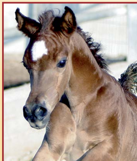
The 2007 filly Atiq Haliah (MD Elsporado x Hila B) at one week old.