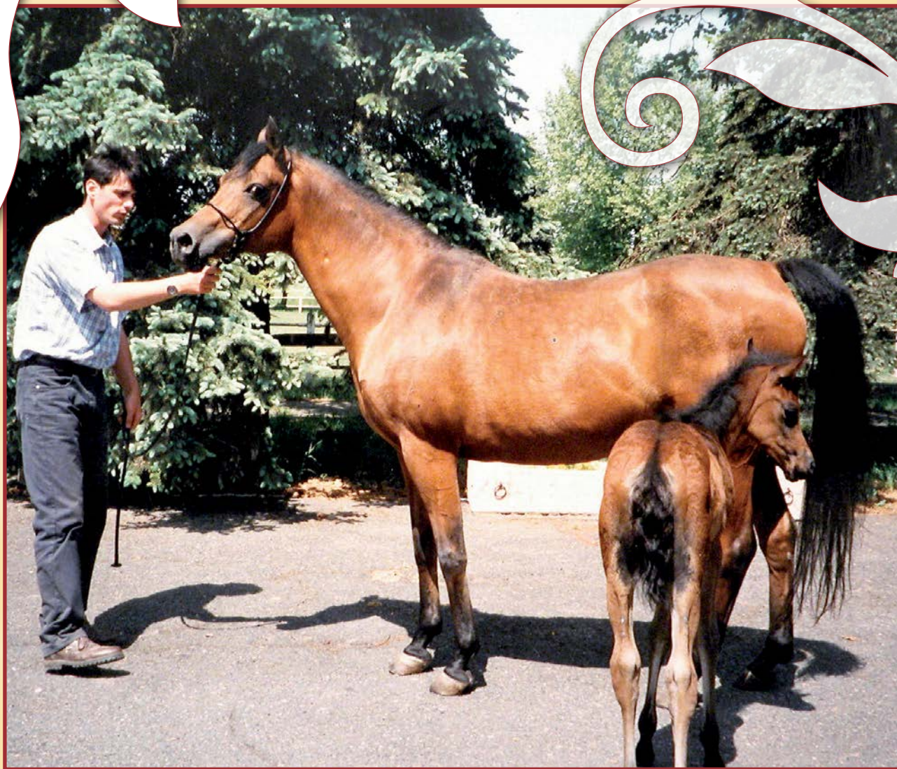
The very exotic 18-year old mare 227 Ibn Galal I (Ibn Galal I x 202 Ibn Galal), at Babolna in June 2000. Tragically, she grew ill and died prior to export; we received her black daughter 247 Rajan B as a replacement.