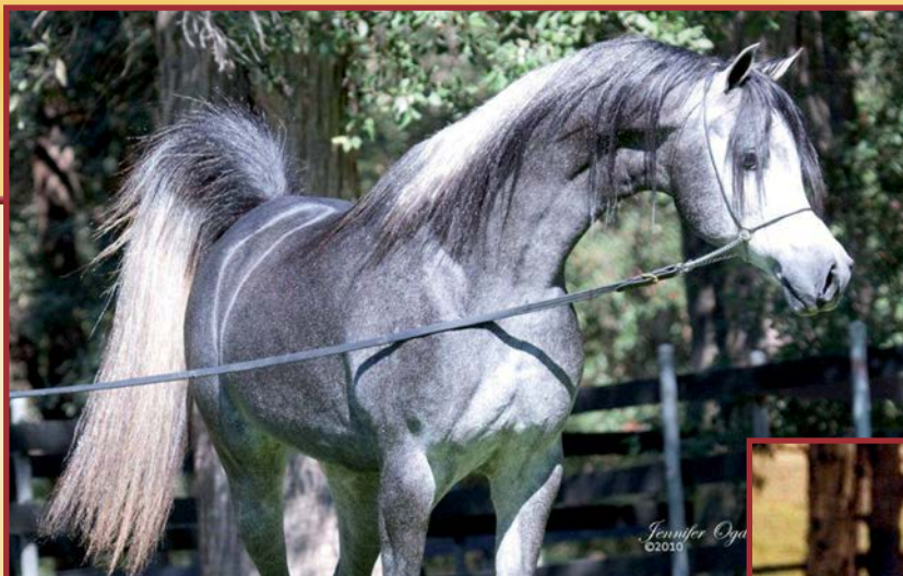
The young herd sire Simeon Shifran (Asfour x Simeon Shavit). © Jennifer Ogden