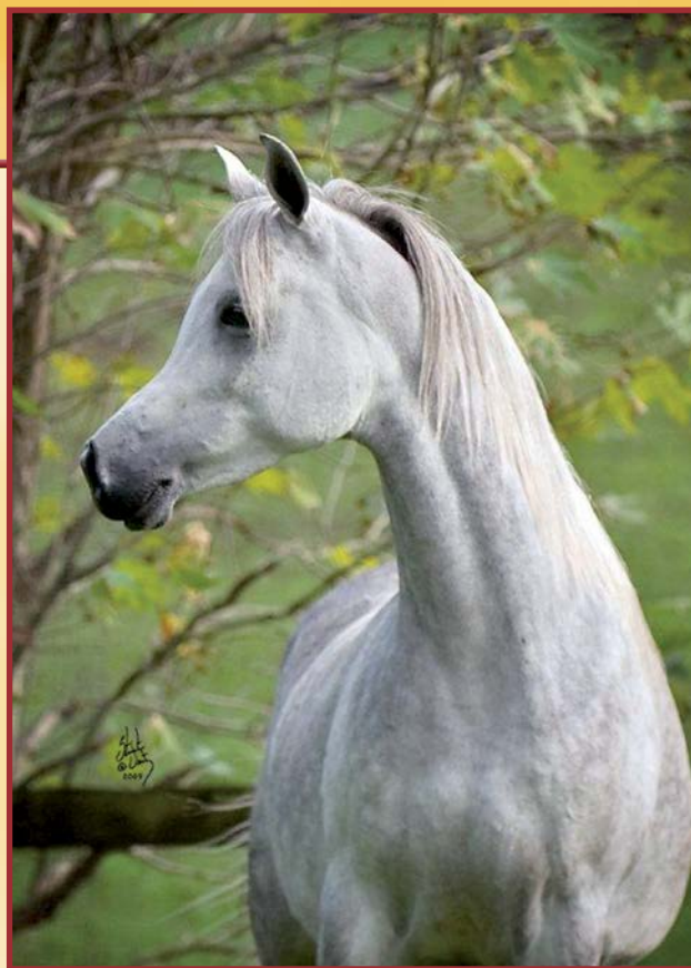
Simeon Salit, an Asfour daughter out of Simeon Shavit (Anaza Bay Shahh x Simeon Safanad).

famous stallion Aswan. His own sire, Galal, was himself 'double Hadban' in strain, and a son of the famous Nazeer. Galal's dam, the Yosreia daughter Farasha, was the dam of the excellent full brothers Farazdac and Faleh (ex Alaa El Din), and the important Anter daughter Nabilah.