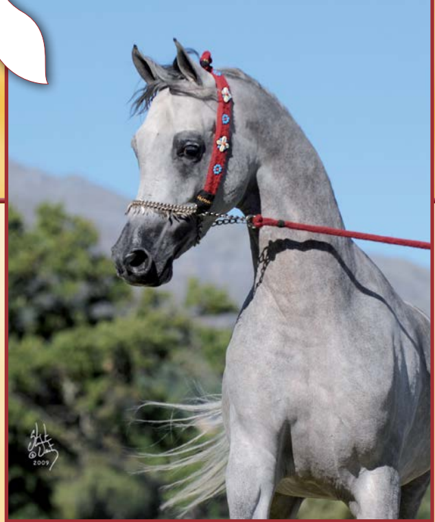
The young stallion Atiq Haleeb (Laheeb x Hila B), exported to Namibia.