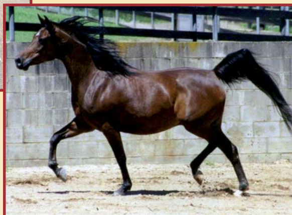
The beautiful bay mare Simeon Sahron (Anaza Bay Shahh x Simeon Shavit).