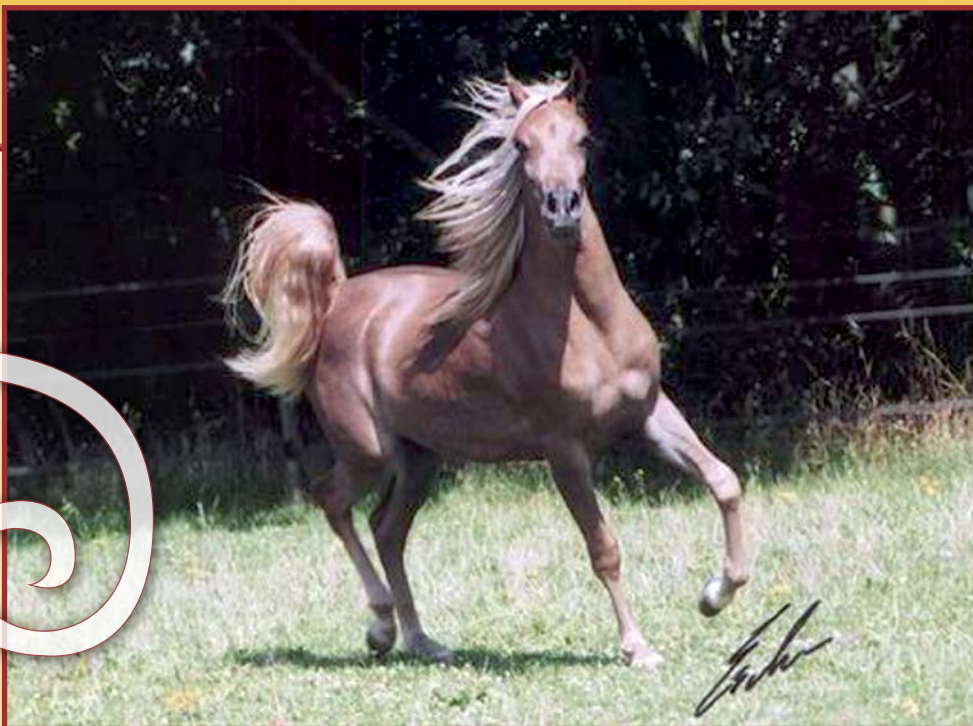
Simeon Sarice, an Imperial Madaar daughter out of Simeon Sayver (Anaza Bay Shahh x Simeon Sukari). © Erwin Escher