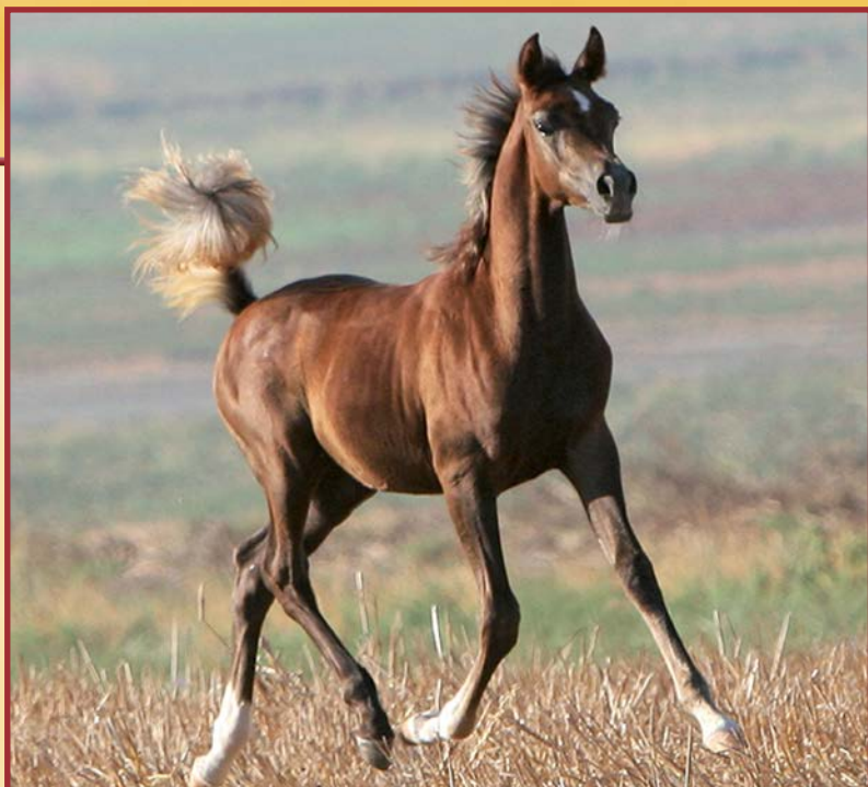
Atiq Ma'ajan, a 2009 filly by MD Elsporado out of Harajana B.