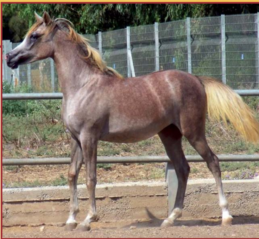
Future broodmare prospect Atiq Hadas was sired by MD Elesperado (Thee Desperado x Izara Blue CA) and is out of Hopa B (El Aziz B x Hayila B out of 227 Ibn Galal I). She is a double granddaughter of Salaa el Dine.