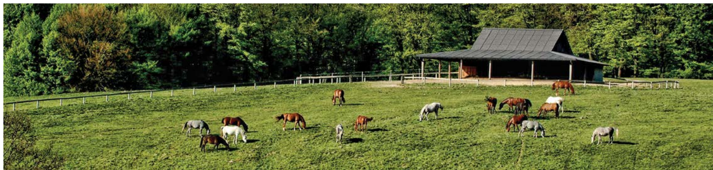
Tarnawka Stud

The American-bred chief sire Ontario HF (Monarch AH – HF Orzonna /Pepton), standing at stud at Tarnawka (Poland, Rzeszów district) since 2007, made a splashing entrance at the Warsaw track in the 2012 season as the sire of get registered in the Polish Arabian Stud Book (PASB). According to the official statistics published on the website of the Polish Jockey Club, Ontario HF placed first in terms of the amount of money won – 17 racing horses won a total of over 216 thousand PLN (about 54 thousand euro). The second spot went to Akbars (Nougatin – Arka/Karnaval) – 151,860 (8 horses) and the third to Ganges (Monogramm – Garonna/Fanatyk) – 119,550 (26 horses). Ontario HF leads the list also in the 2013 season: on the date August 19th the total amount of money won by his offspring was of over 175 thousand PLN (15 horses). Among the seven winners there is the new Derby record holder!