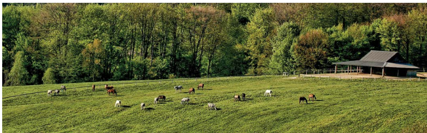
Tarnawka Stud