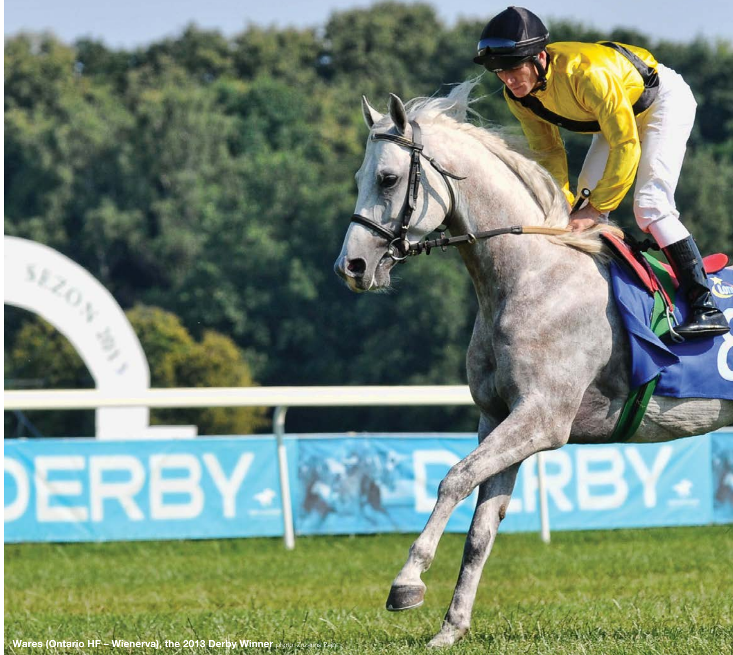
Wares (Ontario HF – Wienerwa), the 2013 Derby Winner