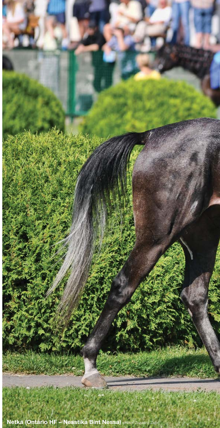
Netka (Ontario HF – Nesstika Bint Nessa)