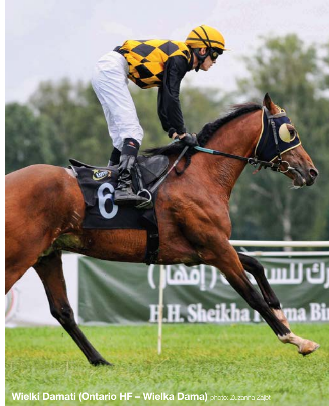
Wielki Damati (Ontario HF – Wielka Dama)

On July 28th, during the Derby run at Warsaw's Służewiec race course, a strong pace right after the start was set by Poranny