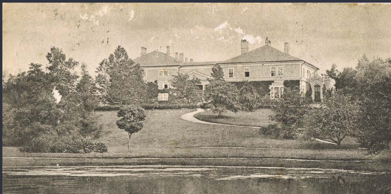
Sanguszko princes' palace in Gumniska.