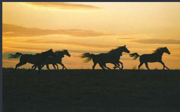
Arabian horses from the today's Polish borderlands

The magnate families, with their spread out European connections, were often related and supported each other. “Up to World War I there were 8, 10, perhaps 12 families which married between themselves. This was determined first of all by the significance of the