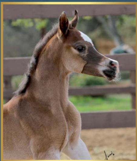
Straight Egyptian colt by Al Rabeh AA out of an Al Baraki daughter bred by Raymond Mazzei, Furioso Farms.