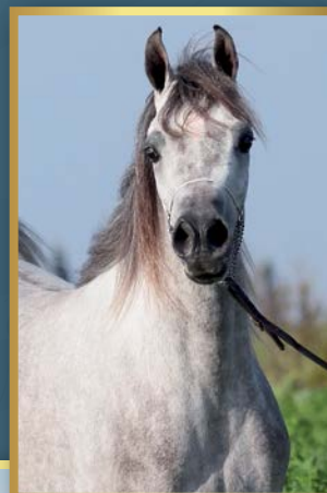
The exotic 2009 Al Rabeh filly AUSTORA AL FAWAZ out of HV Ramses Masballab, owned and bred by Al Farwaz Stud.