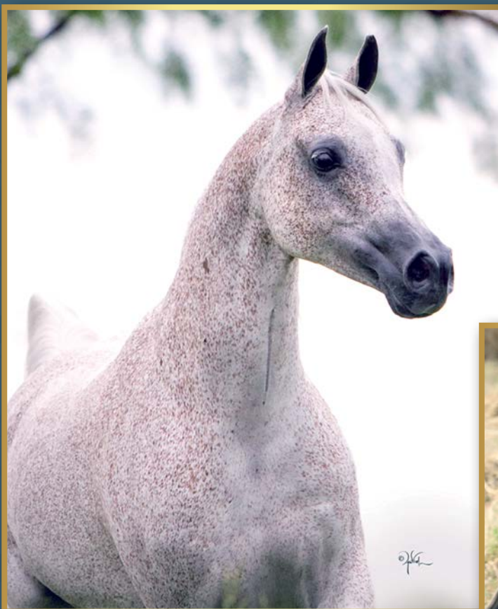
The pure Polish mare EUSCERA (Emigrant x Elcantara by Pamir), owned by Valley Oak Arabians in California, is in foal to Al Rabeb for 2012.