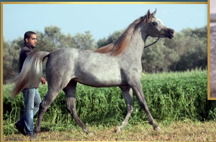
The extremely refined 2009 Al Rabeh daughter RAWAA AL FAWAZ out of Qatifa Sitara, bred by Al Farwaz Stud and owned by Moataz Younis.