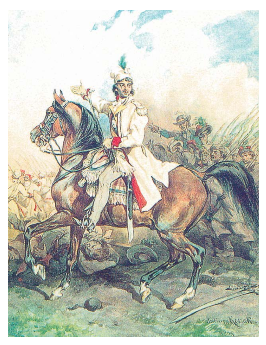
ABOVE: Tadeusz Kosciuszko, by I. Kossak.

Assuming all of these observations have been followed and all such difficulties have been overcome, we finally