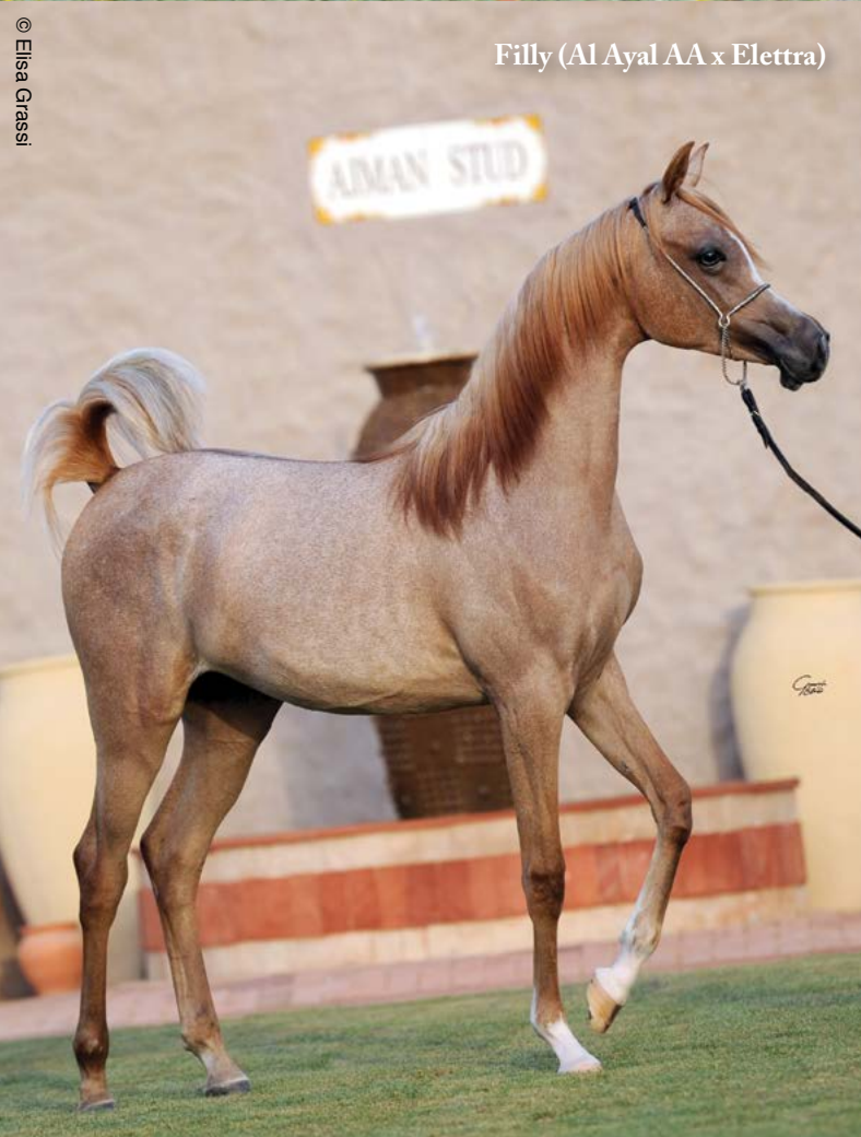
Filly (Al Ayal AA x Elettra)