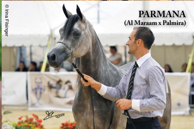
PARMANA (Al Maraam x Palmira)