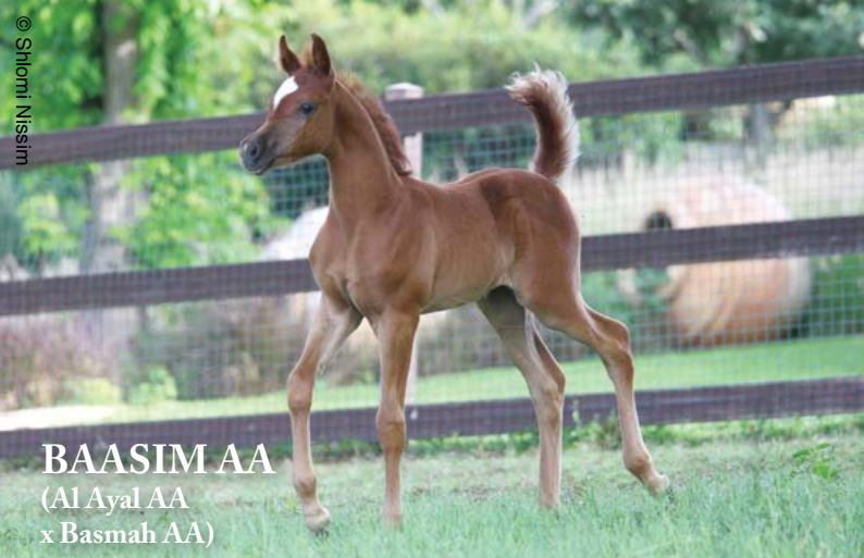
BAASIM AA (Al Ayal AA x Basmah AA)