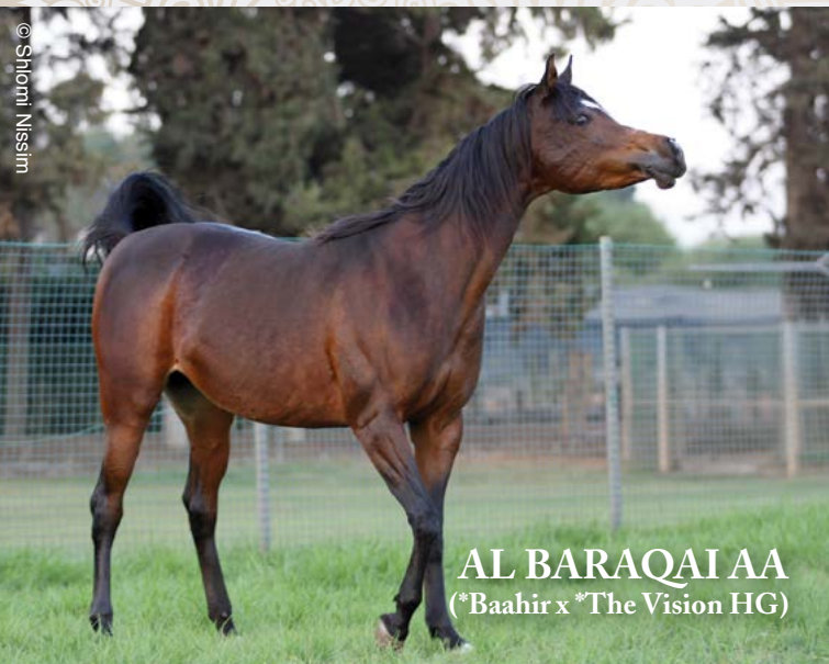
AL BARAQAI AA (*Baahir x *The Vision HG)