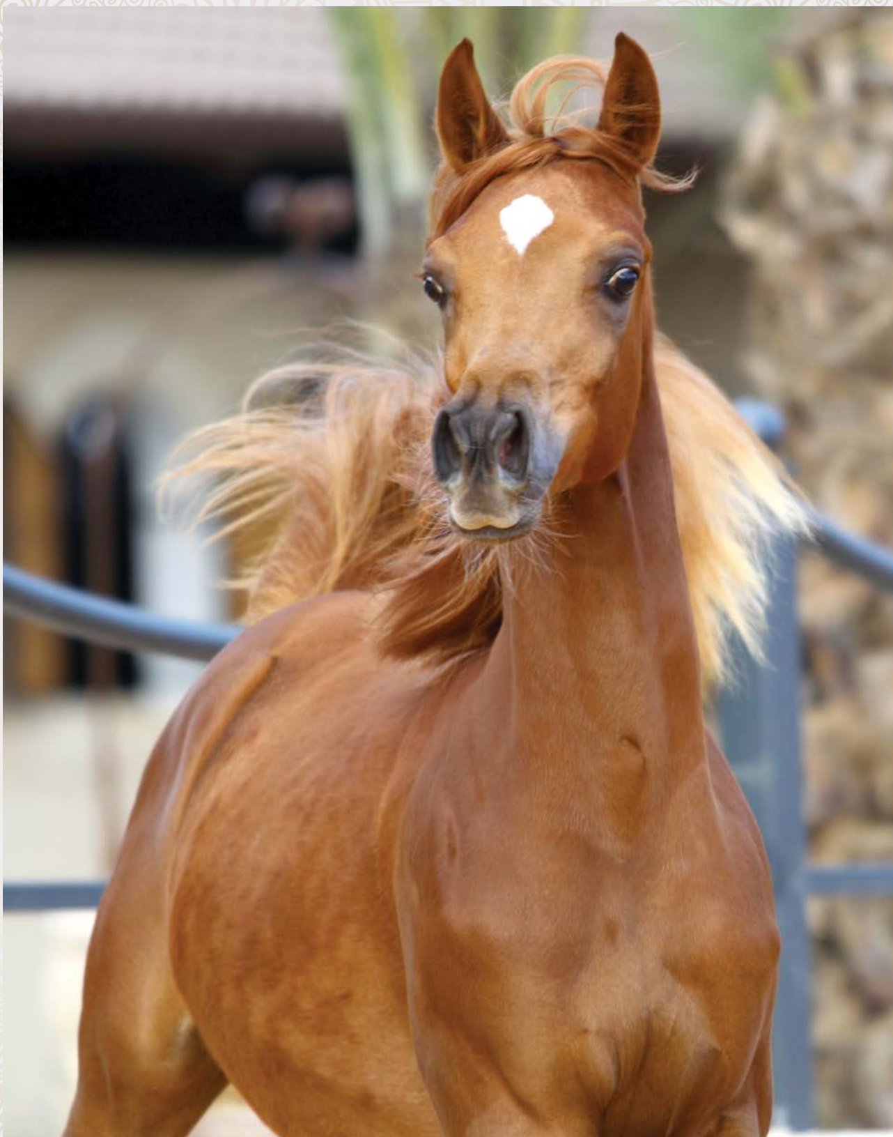
VISION OF MARWAN (Marwan Al Shaqab x *The Vision HG)