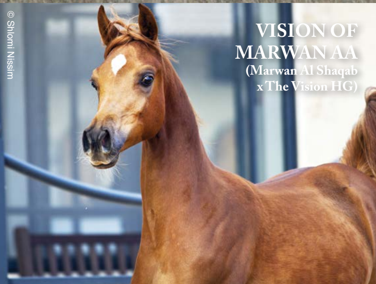
VISION OF MARWAN AA (Marwan Al Shaqab x The Vision HG)

broodmare career, her sons grew to become both international champions and influential breeding animals worldwide. Then her daughters and granddaughters grew up, and have done the same. And now we are watching her great-grand foals growing up to continue the family tradition. This is so much more than we ever expected, and it is almost too much to take in – we are so very, very fortunate. It remains an extraordinary privilege and unique experience to share our lives with The Vision.”