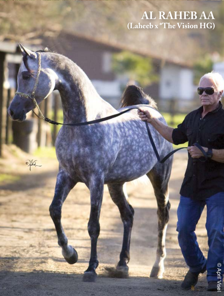
AL RAHEB AA (Laheeb x *The Vision HG)