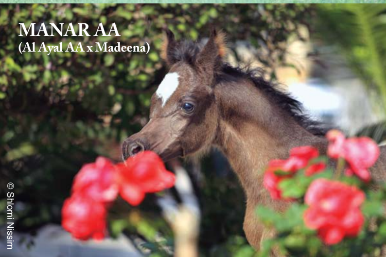
MANAR AA (Al Ayal AA x Madeena)