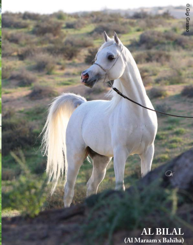
AL BILAL (Al Maraam x Bahiha)