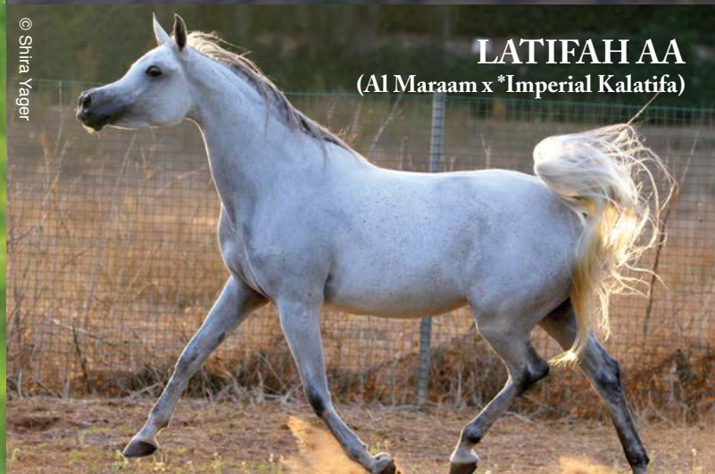
LATIFAH AA (Al Maraam x *Imperial Kalatifa)