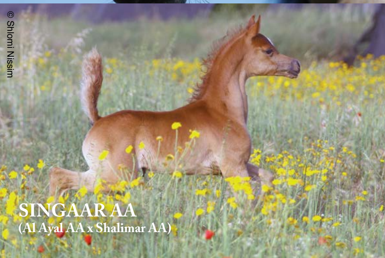
SINGAAR AA (Al Ayal AA x Shalimar AA)