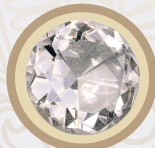
AL AYAL AA (*Al Ayad x *The Vision HG)