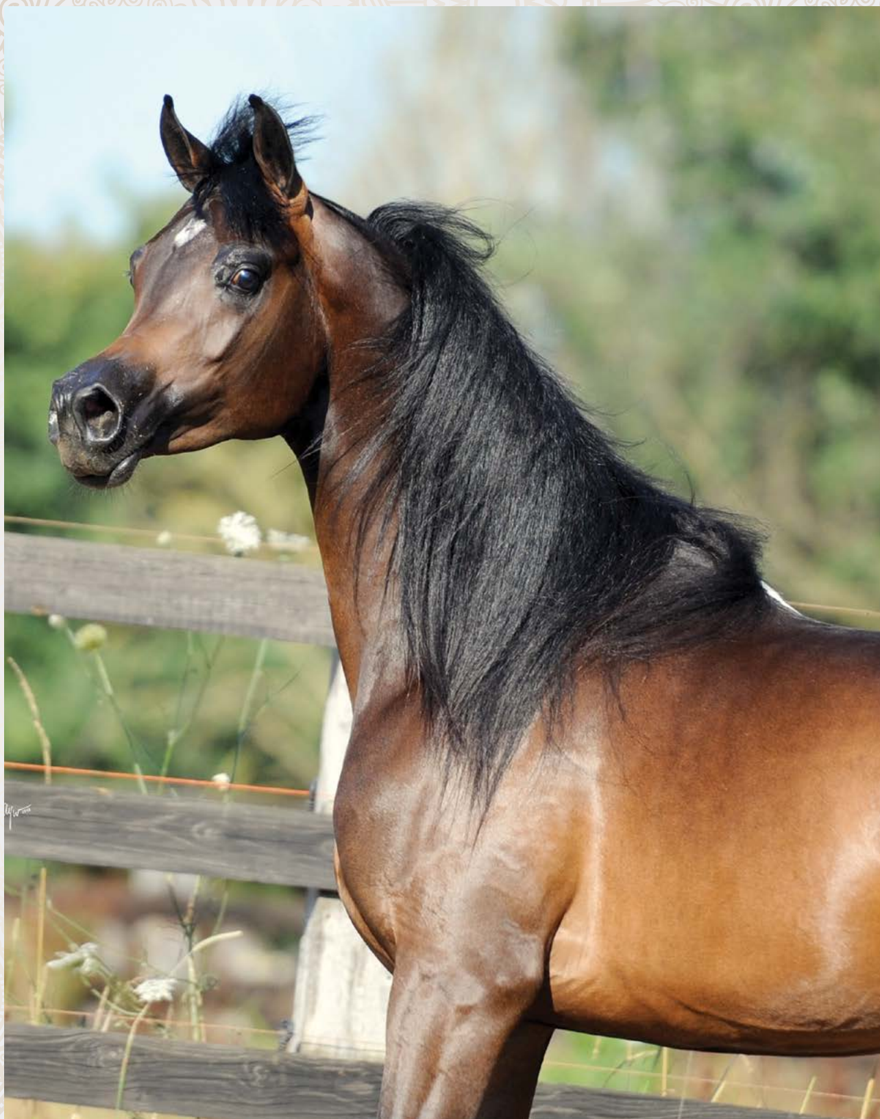
AL GHAZALI AA (Gazal Al Shaqab x *The Vision HG)