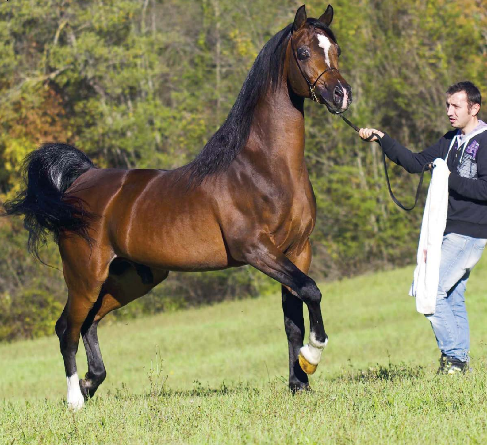
AL MARAAM (*Imperial Imdal x *The Vision HG)