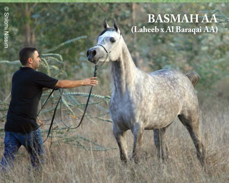
BASMAH AA (Laheeb x Al Baraqai AA)