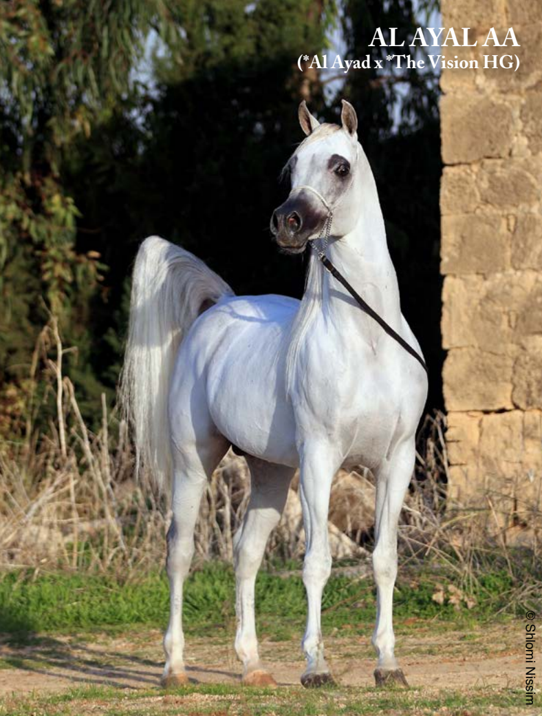
AL AYAL AA (*Al Ayad x *The Vision HG)