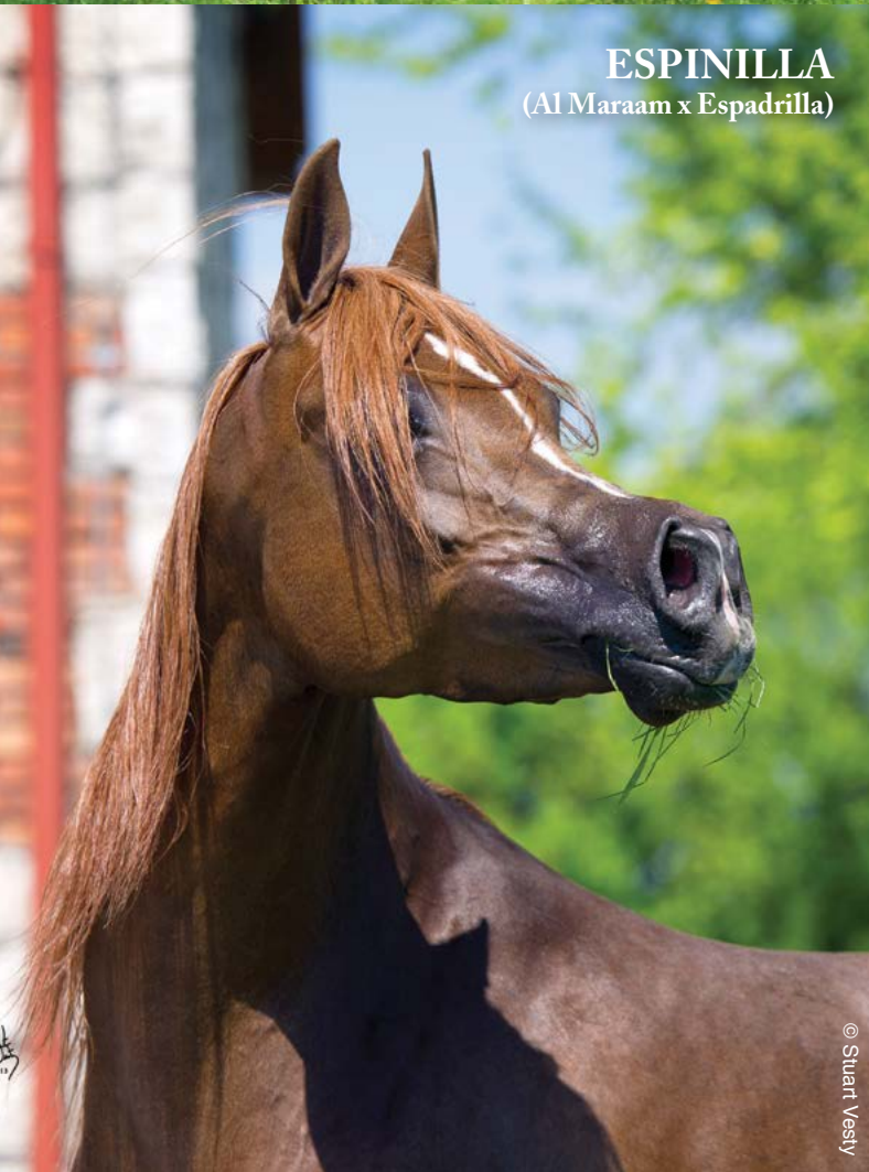
ESPINILLA (Al Maraam x Espadrilla)