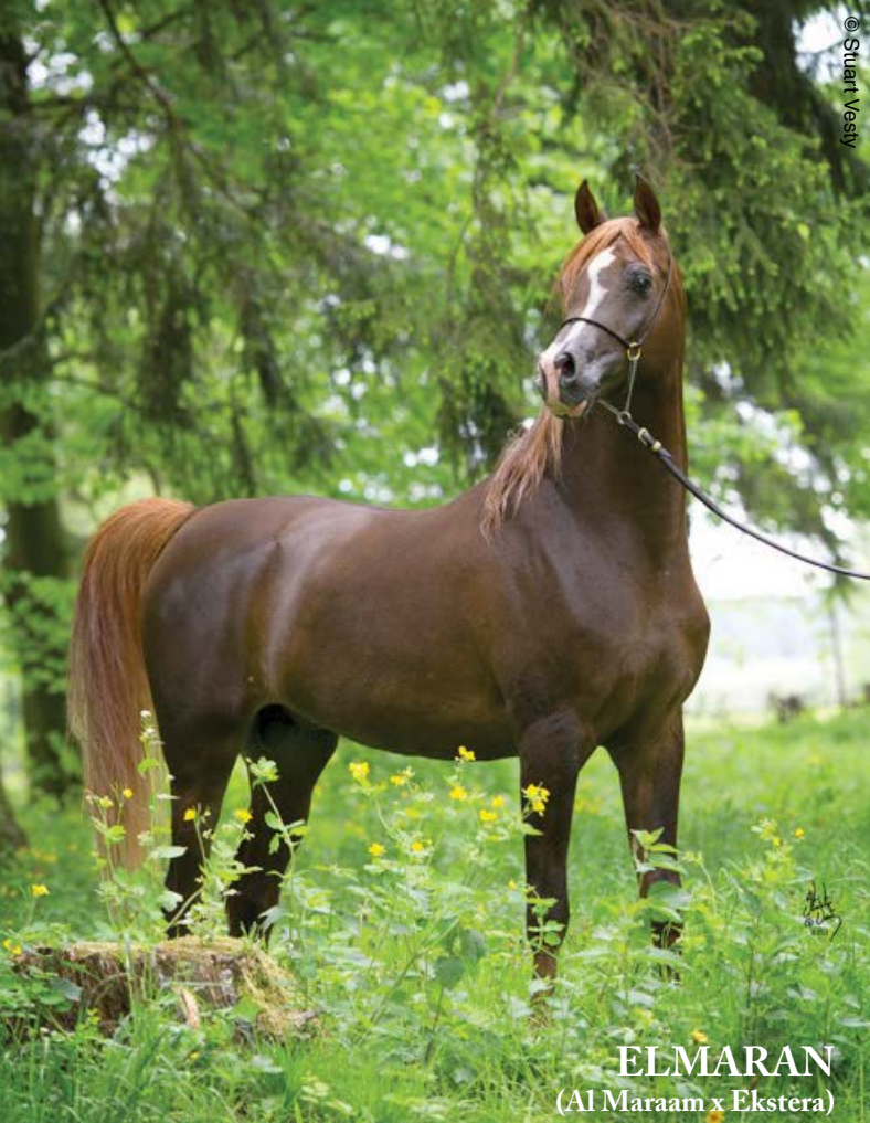
ELMARAN (Al Maraam x Ekstera)