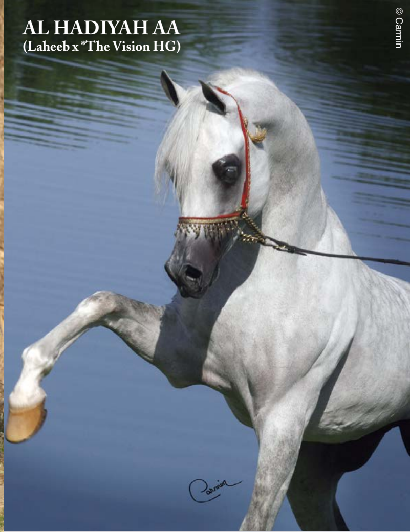
AL HADIYAH AA (Laheeb x *The Vision HG)