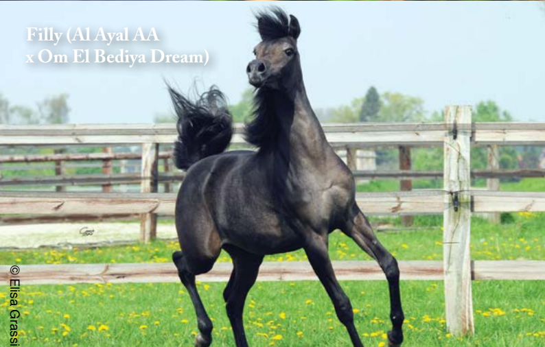
Filly (Al Ayal AA x Om El Bediya Dream)