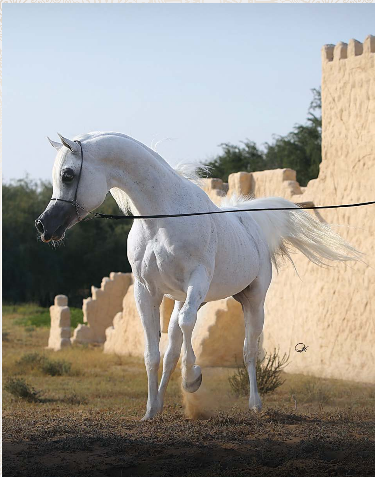
AL LAHAB (Laheeb x *The Vision HG)