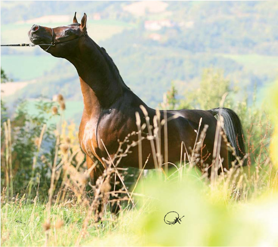
Royal Colours (True Colours x Xtreme Wonder).