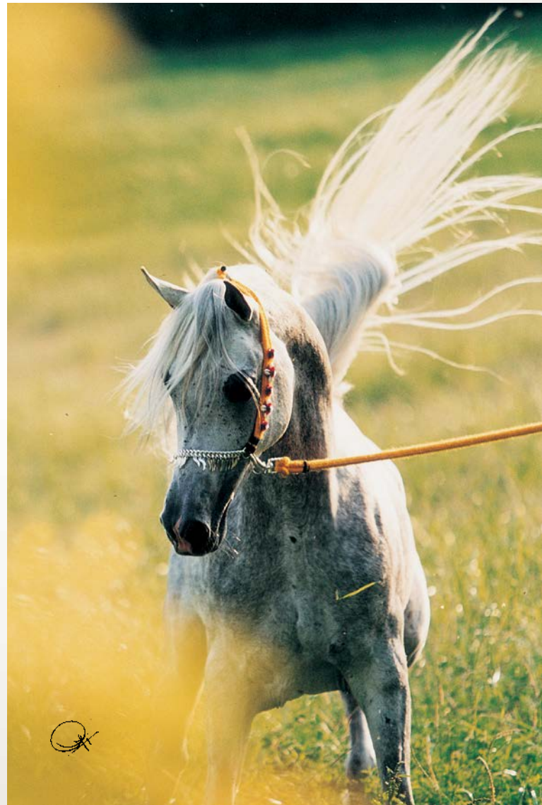
Classic Rayan (Alidaar x AK Raiyeh).

As mentioned before the mating of Shaikh Al Badi to Bint Magidaa was the golden cross. We have seen just how much impact on the breed Ruminaja Ali has, but his other full brothers were also, great horses in their own right and excellent sires. Ruminaja Majed and Ruminaja Fayez, previously mentioned, were good sires of note. Second to Ruminaja Ali in prolificacy was his full brother Ruminaja Bahjat siring 308 foals. He became a phenomenal sire of mares, many of them absolutely beautiful. Among these beauties are: Sonbolahs Music (x SF Bint Sonbohla) exported to Germany, Antiqua Dance (x Talyla) dam of