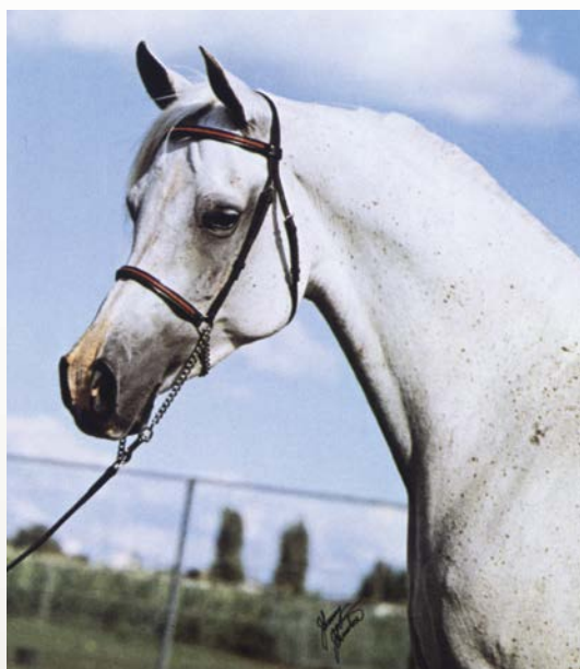
Bint Magidaa (Kbofo x Magidaa).