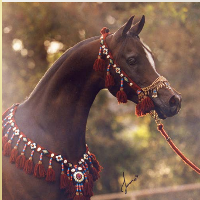
The Minstril (Ruminaja Ali x Bahila).

Ruminaja Ali's success eventually attracted a larger number of straight Egyptian mares. Many of his daughters were not only beautiful in their own right but also great producers, such as the lovely Bint Atallah (x AK Atallah) dam of Phaaros, and AliJamila (x Ansata Justina) dam and granddam of numerous champions, to name just a few. But the patriarchy was to continue with a number of straight Egyptian Ruminaja Ali sons becoming influential sires.