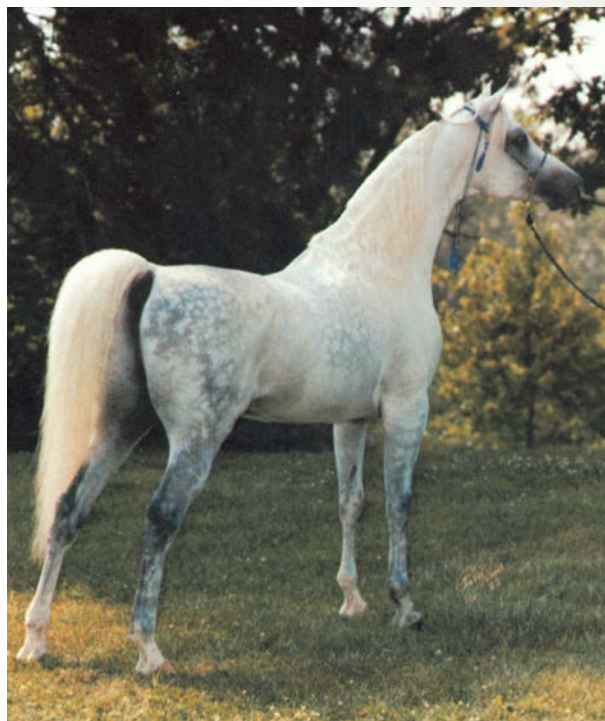
Ruminaja Alli (Shaikh Al Badi x Bint Magidaa).