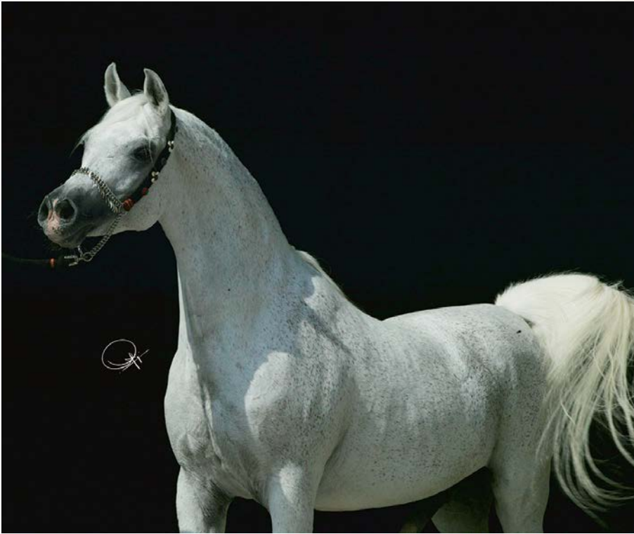
Alidaar (Shaikh Al Badi x Bint Magidaa).

is a great broodmare including two exceptional stallions, Al Maraam , winner of many championships including Nations Cup Reserve Champion , and Al Lahab , multi-international champion, World Champion , Senior Champion in Dubai , and All Nationals Cup Champion . Aside from their show careers, both these stallions have been very popular and successful sires.