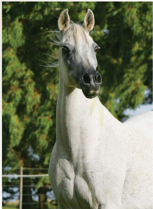
Sche'Mon Ami (Ruminaja Bahjat x ZT Shahmona).