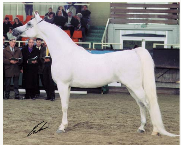
Farres (Anaza El Farid x Shameera).