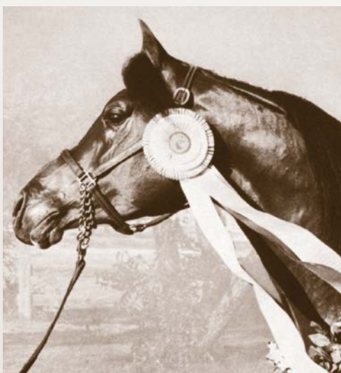
Ali Jamaal (Ruminaja Ali x Heritage Memory).

At Ranch Ruminaja the mating of Shaikh Al Badi to the lovely Bint Magidaa quickly proved to be a golden cross re-