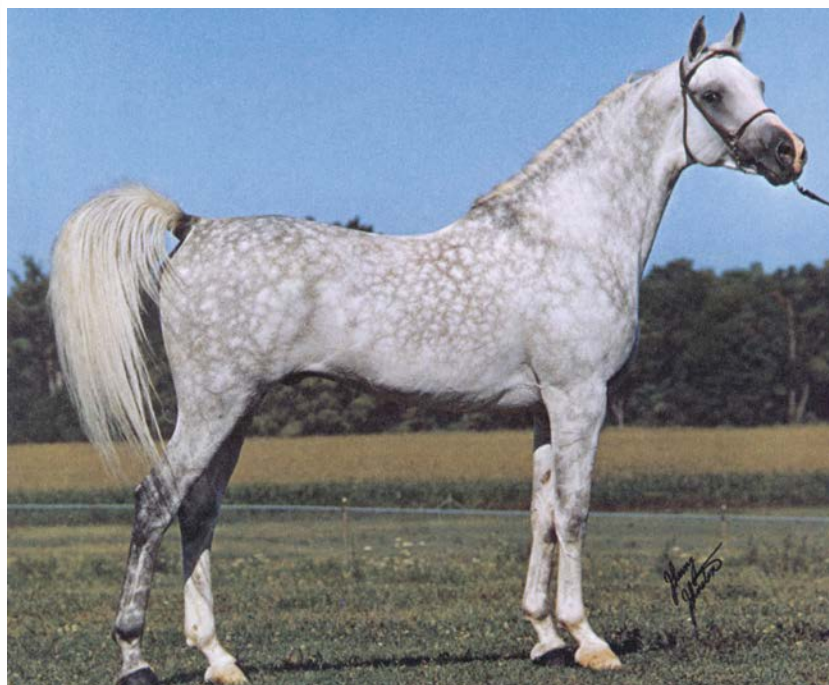
Shaikh Al Badi (Morafic x Bint Maisa El Saghira) at 9 years old.