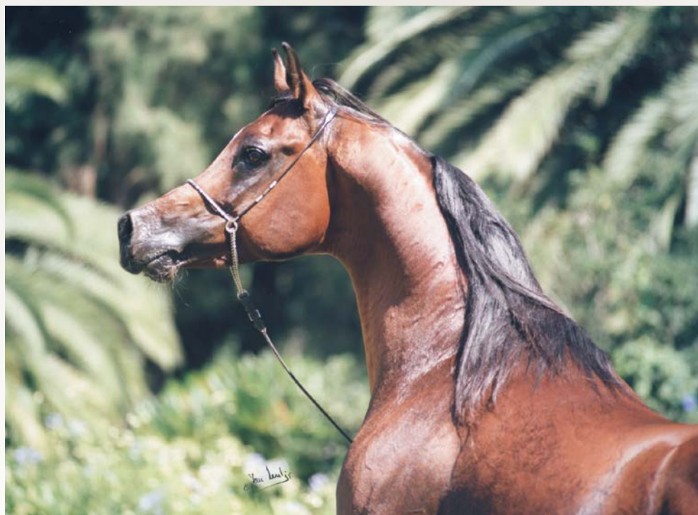
Anaza El Farid (Ruminaja Ali x Bint Deenaa).

I will never forget being at the US Nationals in 1979, the year that Ruminaja Ali won U.S. National Champion Futurity Stallion. I could not get over how much he looked like his sire did as a 3 year old except being a little shorter in the length of back, a bit longer in the hip and with a more classic head. His beautiful type, movement, body language and nobility got everyone's attention. He seemed to love the attention of the crowds in the ring. With flagged tail and snorts, he displayed an enormous amount of style and attitude. It was an unforgettable sight.