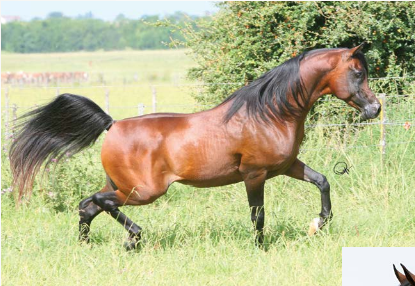
ZT Faa'Iq (Anaza El Farid x ZT Jamdusah).