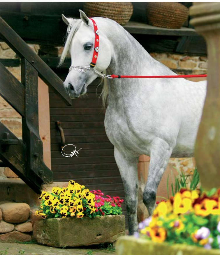
Al Lahab (Laheeb x The Vision HG)

had that characteristic silhouette of the beautiful neck and shoulders carried in the most graceful arch, the trademark influence of the patriarchy. He had all the style and nobility associated with his sire but in a rich bay color. He won many championships and was U.S. and Canadian National Top Ten.