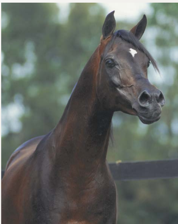
Anaza Bay Shahh (Shaikh Al Badi x Bint Deenaa).

Marquis I and Calypso Dance, Gift of the Nile (x Ansata Nile Gift) and Sche'mon Ami (x ZT Shabmona). The Shaikh Al Badi - Bint Magidaa story would not be complete without mentioning the final member of this legacy, the stallion Alidaar. Born the same year as the Minstril, Alidaar was much like Ruminaja Ali in his style and appearance, yet he was his own horse. As he matured he was a stunning example of the classic Arabian that led him on an international journey. In 1991 as a seven year old he was exported from the U.S. to France impressing the judges in his first show at Menton with a near perfect score. He then went on to establish himself as an excellent sire. Moving about Europe he gained momentum as a sire of unforgettable "classics" such as the stallions Classic Shadwan (x Shagia Bint Shadwan) and Classic Rayan (x AK Raiyeh) to name a few. The final leg of Alidaar's journey so far is in Qatar where he has had the opportunity to breed some of the world's finest Arabian mares with very impressive results. He has sired well over 200 foals as of last year with more on the way.