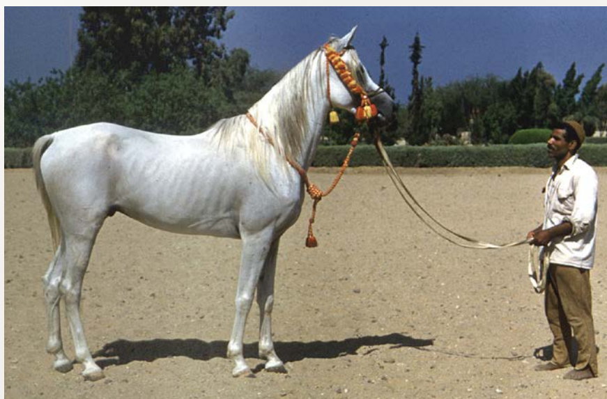
Morafic (Nazeer x Mabrouka) in Egypt.

1970, and I had read everything I could get my hands on to better understand the breed. I had already read about the Egyptian imports to the U.S. with Nazeer breeding and was intrigued with their look. I became consumed with the image of Morafic who seemed larger than life: beautiful, noble, pearl-white, and a vision of the spirit of the Arabian in its highest form. Bint Maisa El Saghira was one of the most beloved Egyptian mares in the U.S. show ring with her rich bay color, stylishly brilliant movement and charming spirit.