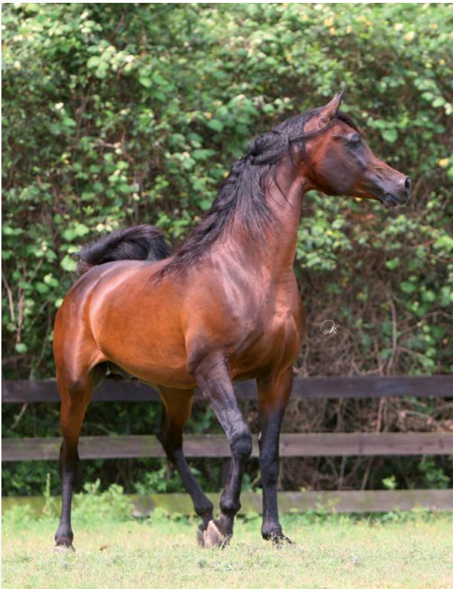
Gazal Al Shaqab (Anaza El Farid x Kajora).