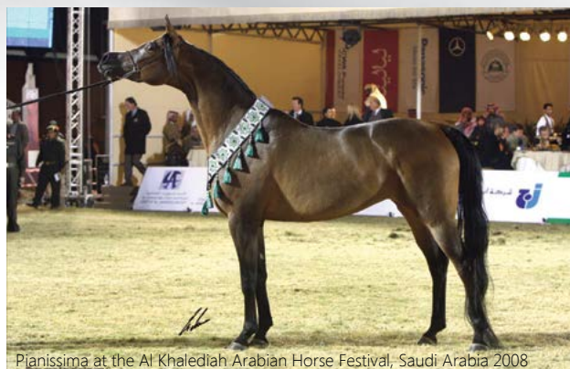
Pianissima at the Al Khalediah Arabian Horse Festival, Saudi Arabia 2008

It is worth mentioning here that the long and dramatic history of the Szamrajówka (~1810, bred by Biała Cerkiew) damline, which is more than 200 years old, is inseparably connected with the tragic history of Poland itself. Biała Cerkiew, the oldest Polish stud, established in 1778 by Crown Grand Hetman Franciszek Ksawery Branicki (1729–1819), disappeared during the Bolshevik Revolution of 1917 and all horses at the stud perished. More than sixty Arabian mares were slaughtered by machine guns as "equine aristocracy". 4 Fortunately, many horses sold earlier