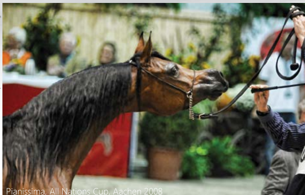
Pianissima, All Nations Cup, Aachen 2008