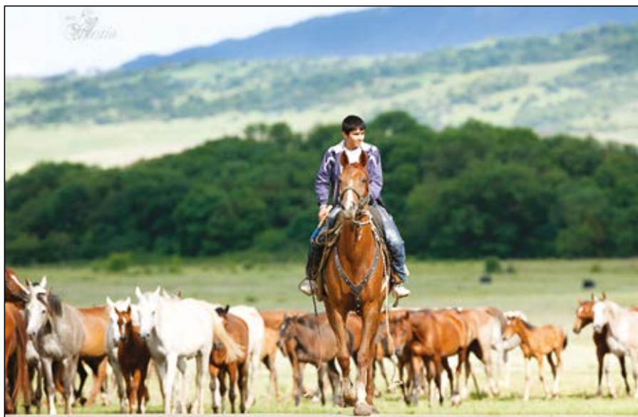
Daily, the broodmare band of Tersk is led to pasture by herders riding Tersk-bred horses