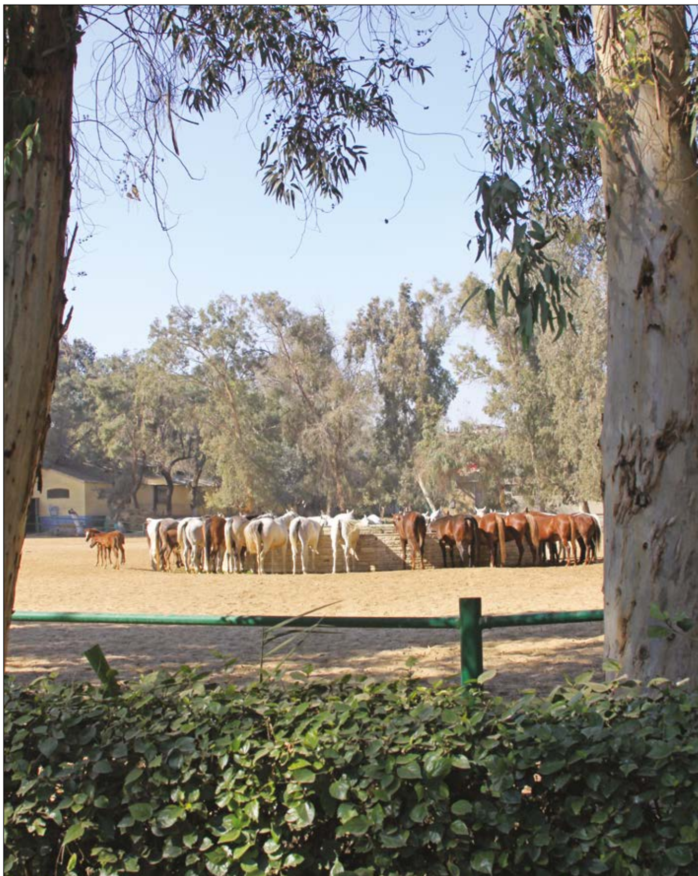
El Zabraa, the state stud of Egypt, is where the pasbas pooled the most refined horses they could find all over Arabia. The type they maintained here set world-wide standards