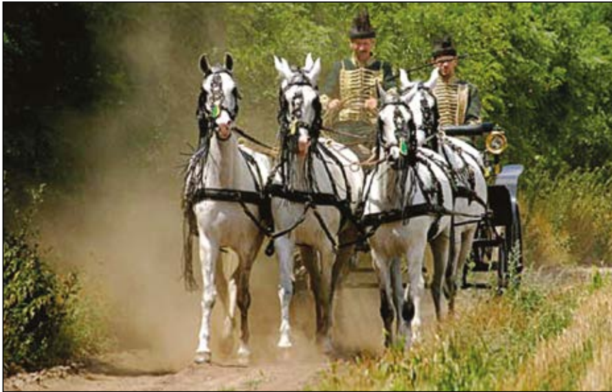
Babolna, Hungary's historic state stud, has a tradition of training every horse that is intended for the breeding program to carriage driving and also to riding