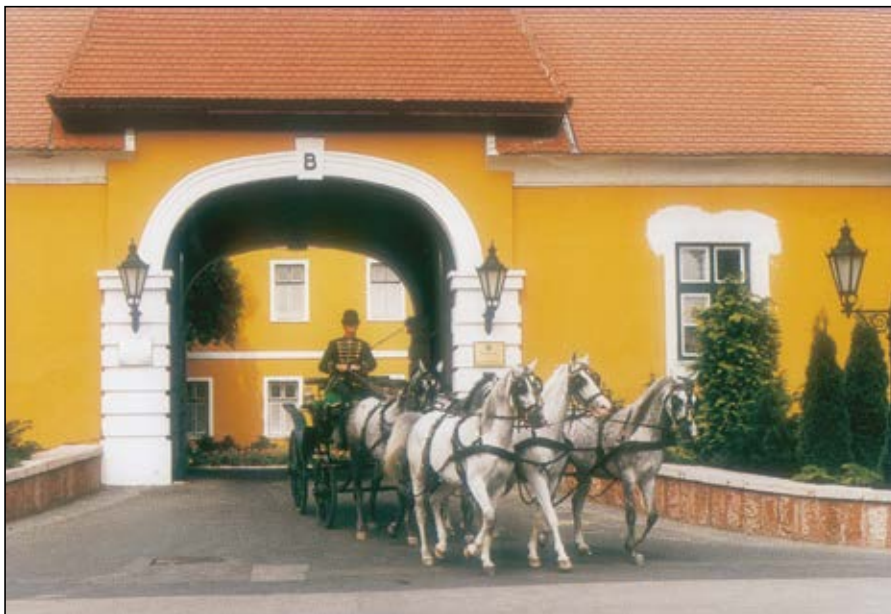
The historic premises of Babolna, set in a scenic landscape, lend themselves to horse training – a brilliant way of propagating the Arabian breed that Babolna has maintained with a century-old special breeding program

For example, if a chestnut horse is bred to another chestnut horse, then a chestnut foal will always be the result. Certain health problems are also known to be recessive. A horse who is a carrier of CID will only breed another CID horse when both, sire and dam, are CID carriers. If only one parent is a carrier, the offspring may or may not be a carrier. Again, in certain populations there are definitely several traits which are inherited in such a form, but they are not easy to detect and are mostly overlooked.