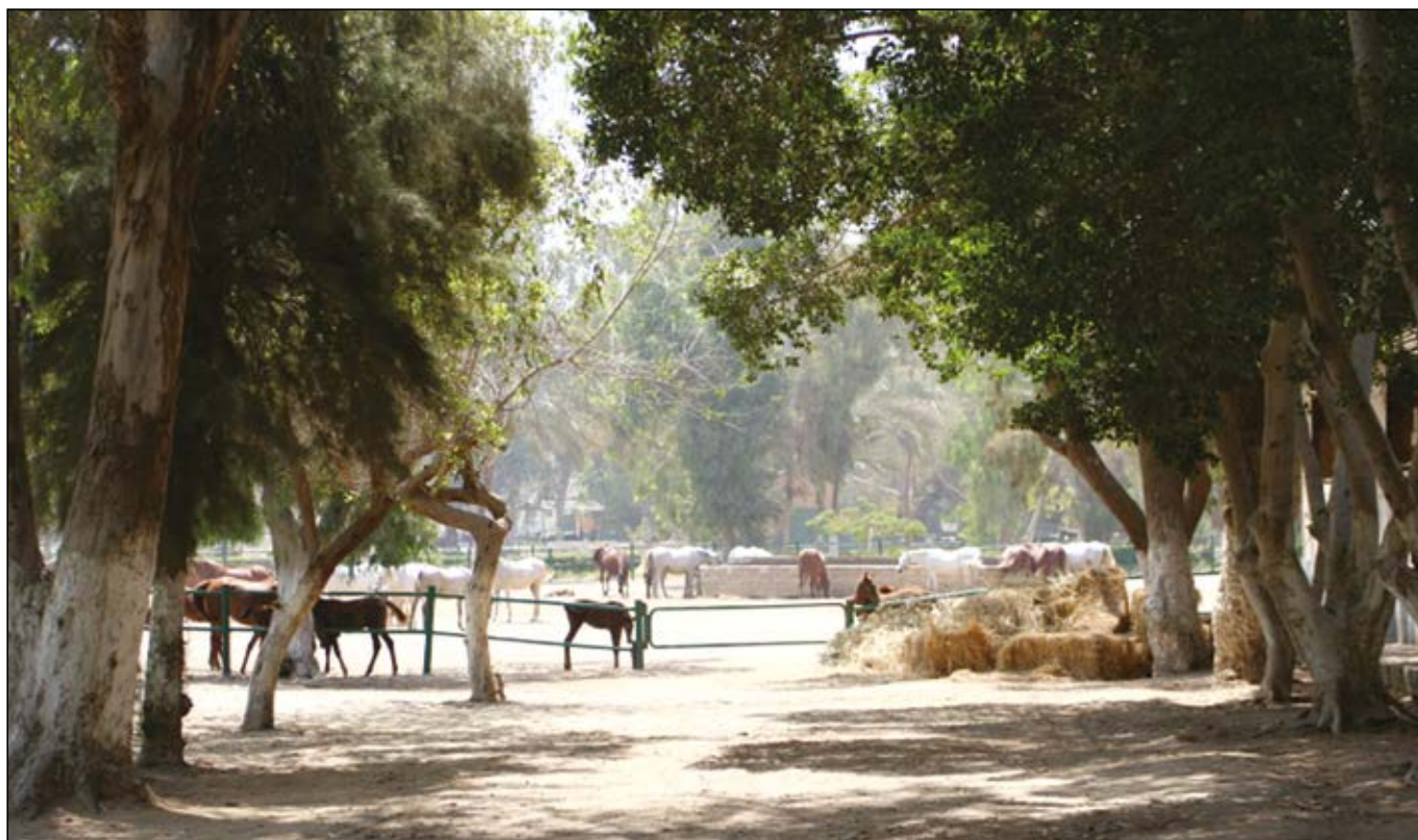
About 350 Arabian horses of all ages are living in the marvelous State Stud of El Zabara near Cairo with its unique oriental flair

by selective choice of stallion and mare. One can even eliminate such problems in certain groups of horses by adopting a clearly designed severe selection procedure. In order to embark upon a programme like the one at Katharinenhof, it is of vital importance to examine the following: