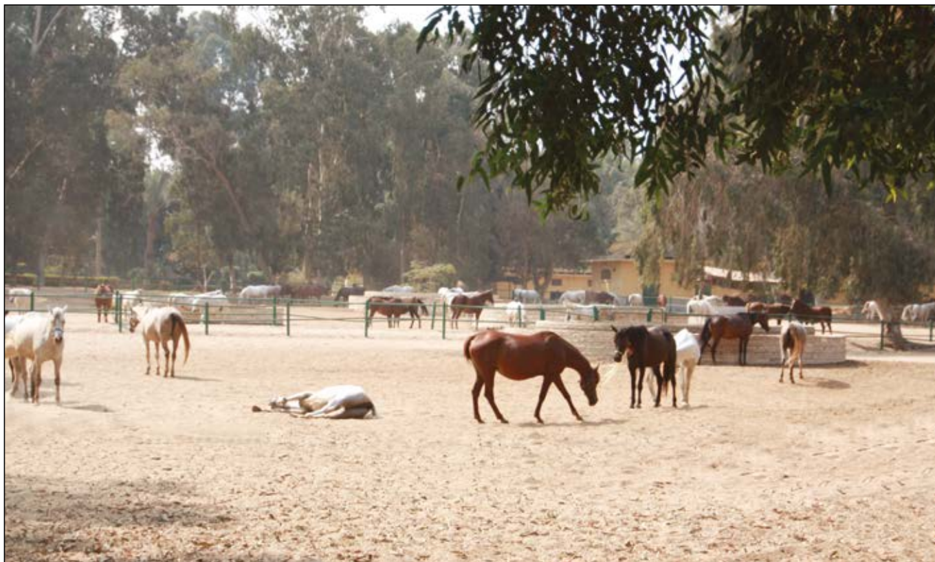
A broodmare band in El Zabara state stud. The stud is renowned for their standards of horsekeeping as well as for the horses themselves

which are linked at the same time. Also positive and negative traits are often found to be connected to each other or vice versa. A positive correlation is found when a certain desirable characteristic brings with it another desirable characteristic; e.g., a nice head and a finely sculptured beautiful neck. A positive and a negative correlation could be a beautiful round eye, but it always comes with ears that are too long in the same offspring. Such correlations can be very strong and difficult to break, and to change stallions or mares is often the only solution in order to overcome such a problem. To work with mares who themselves have several of such negatively connected traits means real trouble for the whole breeding program.