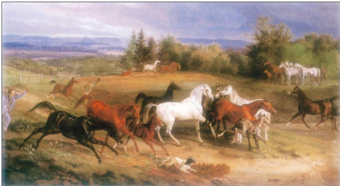
Weil / Marbach was a Royal stud before it became a state stud. With foundation sire Bairactar and foundation mare Murana I, breeding started as early as 1817. The stud was the first in Europe to adopt a concept of breeding pure Arabians according to a systematic concept of breeding

- breeding half sister to half brother is a combination which some also consider to be inbreeding. Inbreeding is recommended when the intent is to create a homogeneous population.