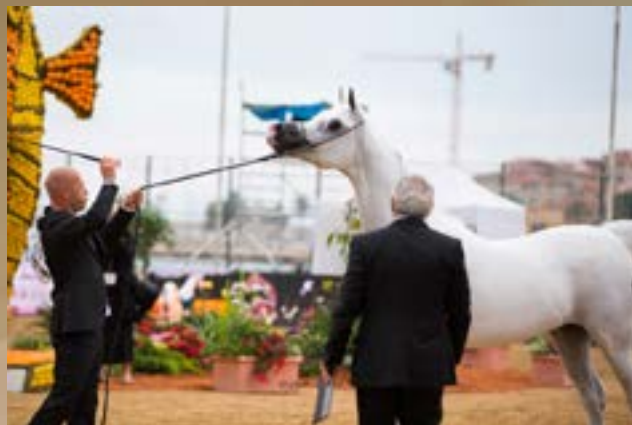
Class A Show Menton

Fahera certainly falls in the category of 'one to watch'. If you have not yet seen her, she will amaze you and capture your heart. For those already converted, we know that it is only a matter of time before she is right up there in the championship spotlights once more, winning