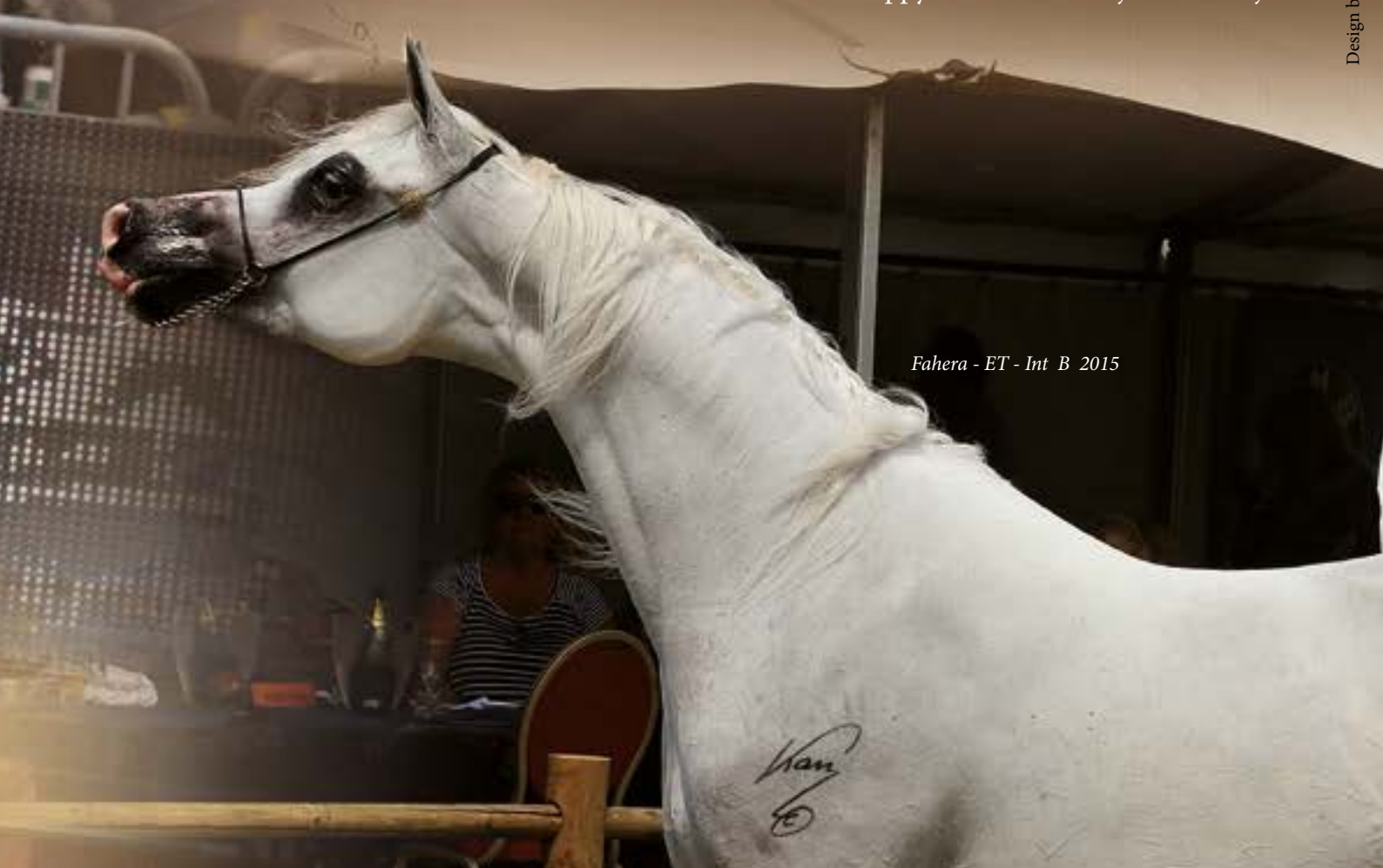
Fahera - ET - Int B 2015

“Soon, when I could spend more time with her, I discovered that Fahera was such an interesting and smart creature. She made me understand pretty quickly that the most important was to make her happy! She knew the job, so she just