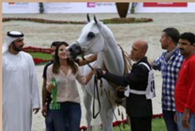
Fahera - Bronze Medal Champion Mare A- Show Sharjah International