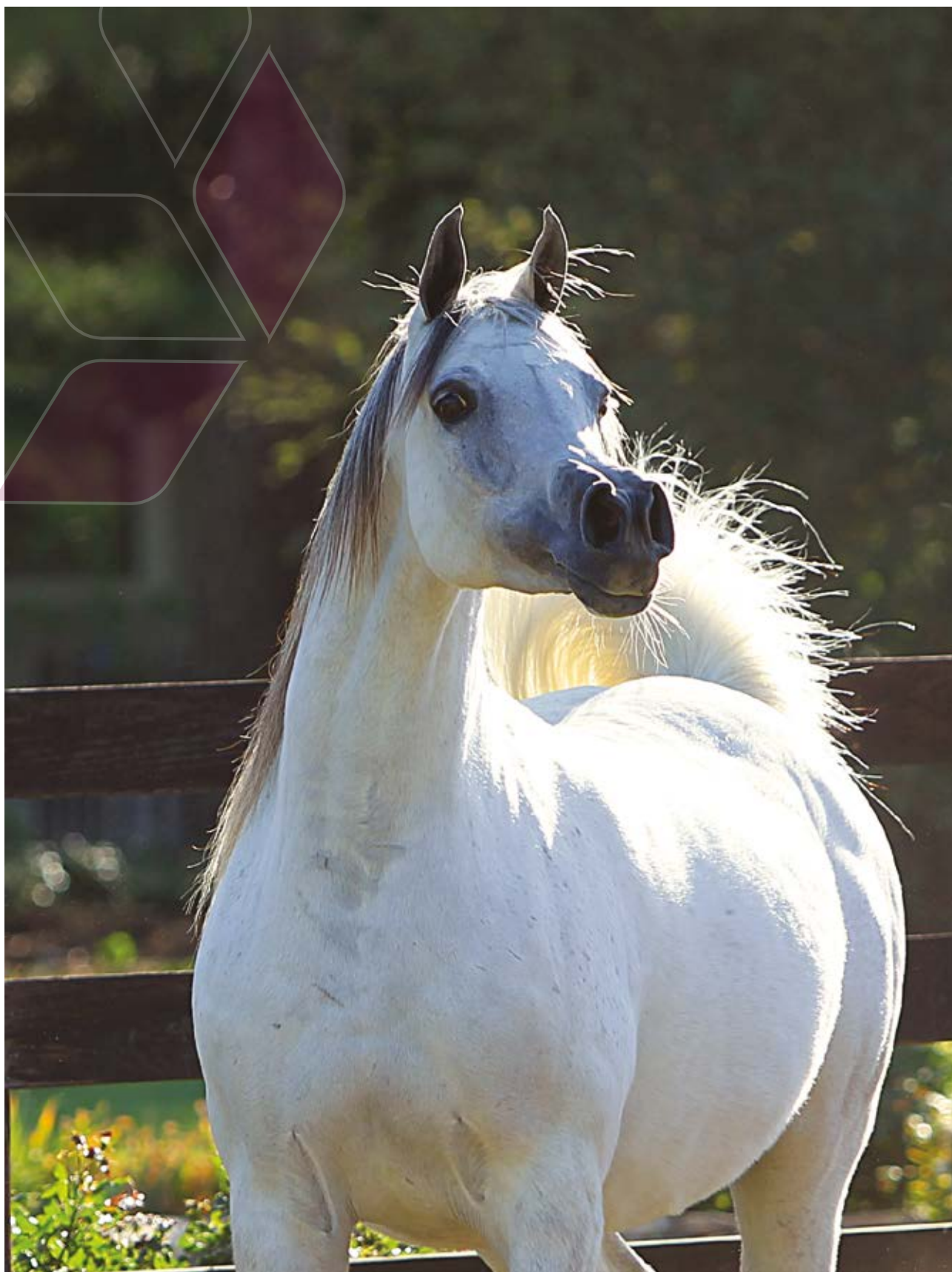
Abha Myra (Marwan Al Shaqab x ZT Ludjkalba) 2003 Grey Mare