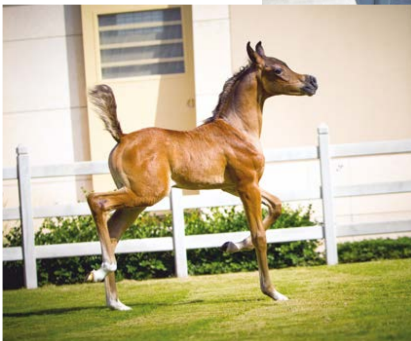
2014 Filly (Fadi Al Shaqab x Shama Al Shaqab)