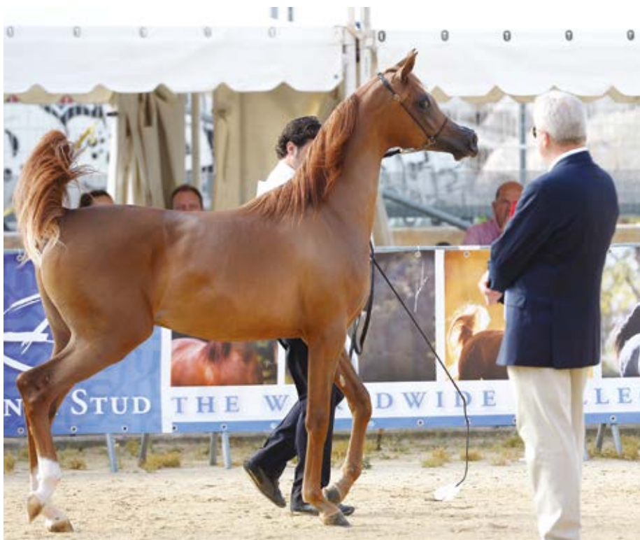
Falah Al Shaqab as yearling (Fadi Al Shaqab x JJ Emotion)