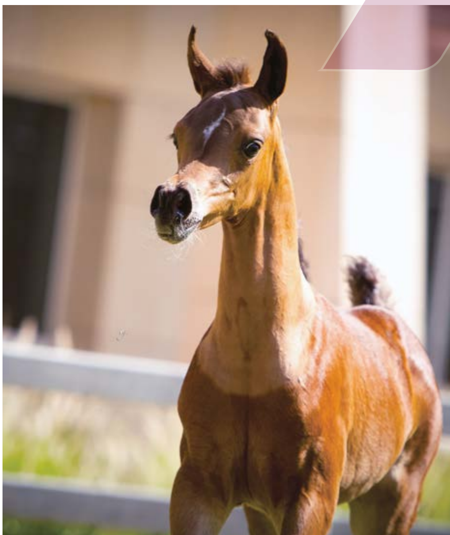
2014 Filly (Fadi Al Shaqab x Aisha Al Shaqab)