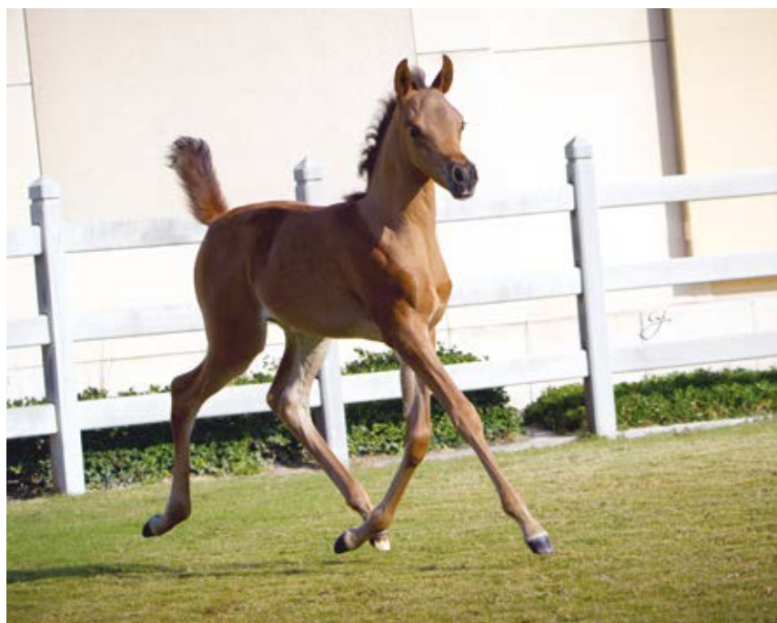
2014 Filly (Fadi Al Shaqab x Marwa Al Shaqab by Gazal Al Shaqab)