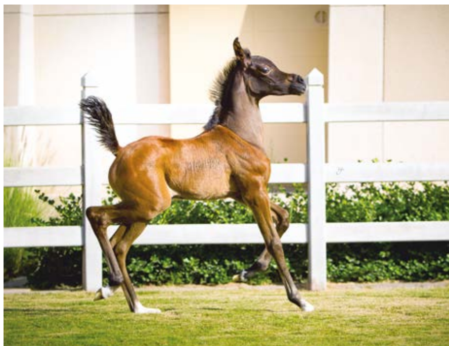
2014 Filly (Fadi Al Shaqab x Aabir Al Shaqab)