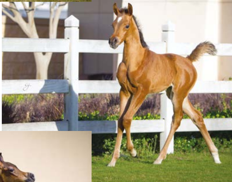
2014 Filly (Fadi Al Shaqab x OFW Mishaah)