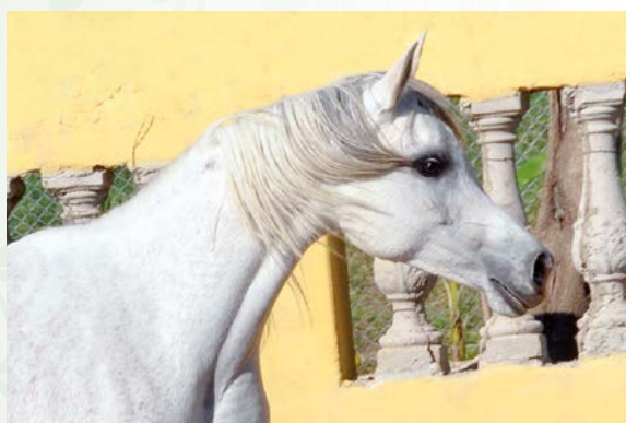
Nogara El Ludjin x Res. National Champion Narab el Jamaal Important matriarch at Haras Meia Lua