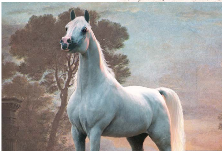
Arkane el Jamaal National Champion in Brazil