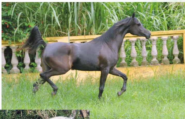
Electra el Perseus, daughter of Ermyne, (3 times Jamaal)