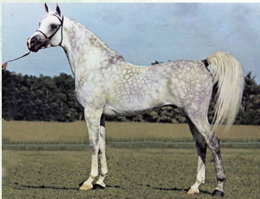
Shaikh al Badi