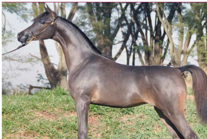
Haidée el Perseus , x Harklée el Ludjin