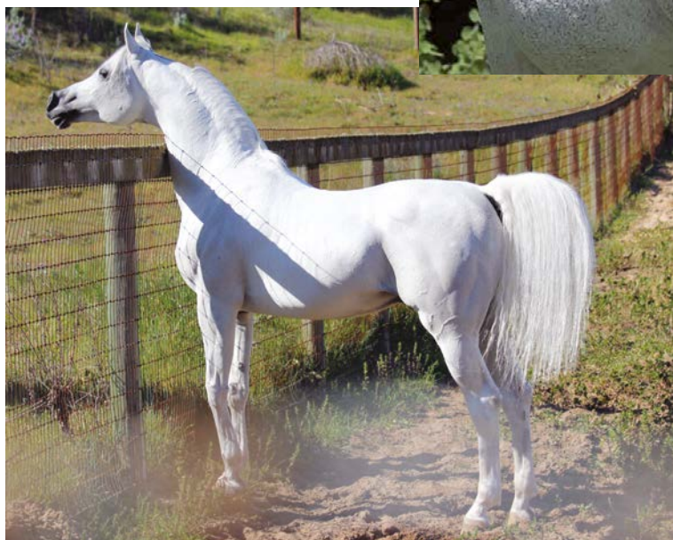
Dakar el Jamaal