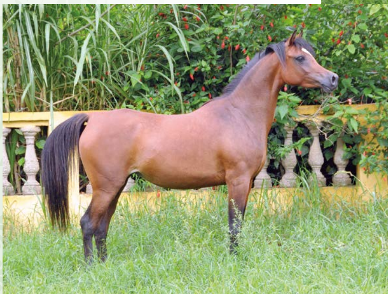
Erynne el Perseus, daughter of Ermyne, (3 times Jamaal)