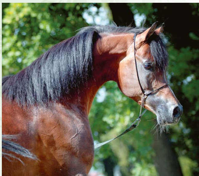
Javier el Jamaal by Juliet (now Dubai Arabian Horse Stud) son of Juliet