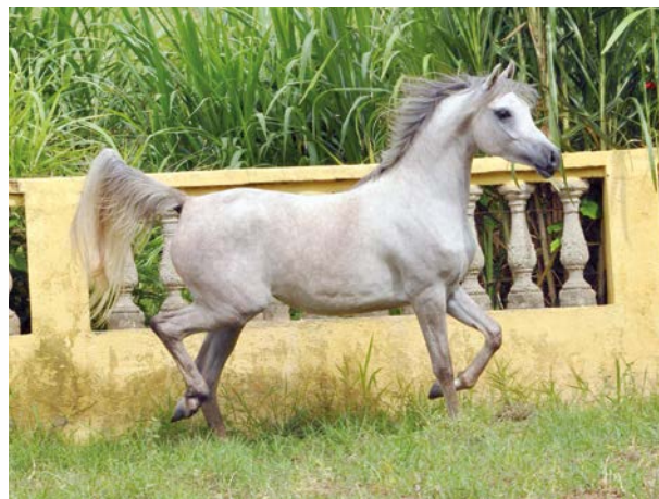
Ghydara el Perseus