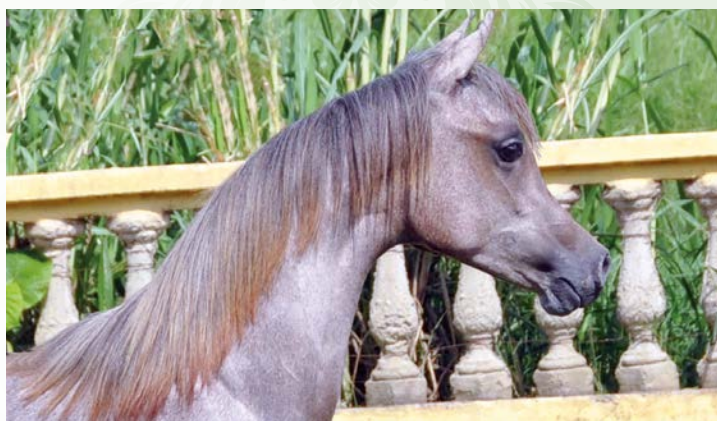
Gdynia el Perseus, owned by Santa Ventura