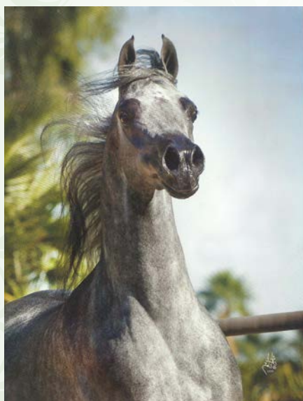
Saudi el Perseus, now in Australia, x Silk el Jamaal