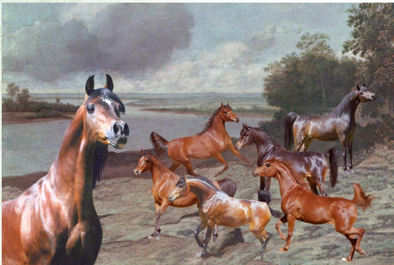
Ali Jamaal with bay daughters