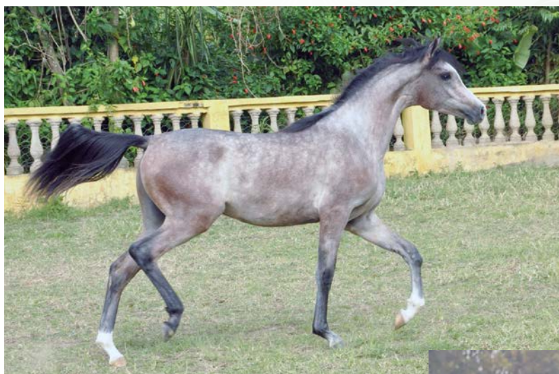
Jaya Enzo x Jullye, Haras Meia Lua