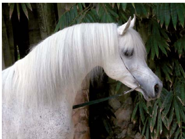
Ludjin el Jamaal at 20 years old.