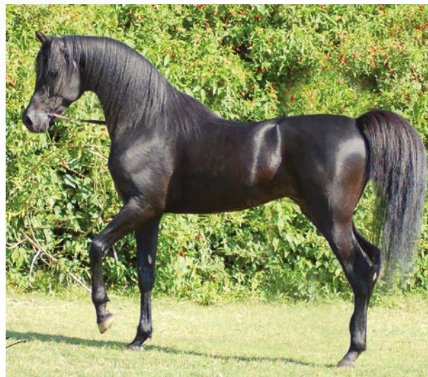
Perseus el Jamaal, x Perfectshahn SRA (Bey Shah), 2002 black stallion. One of the influential stallions at Haras Meia Lua