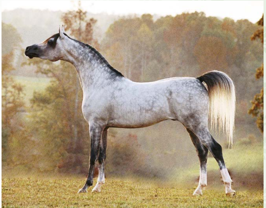
Dakar el Jamaal- US National Champion x Sonoma Lady (US. Res, National Champion)