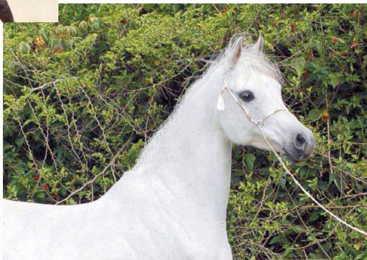
Jylida el Jamaal x Jullye, Haras Meia Lua