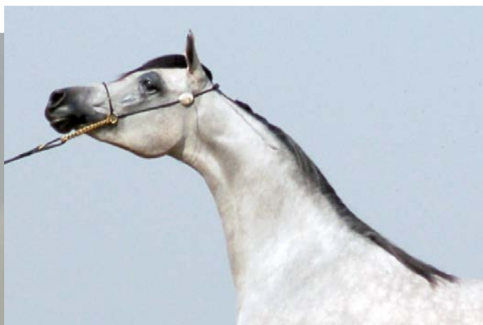
Berylle el Ludjin, Brazilian National Champion filly, x TW Bey Fantaishab (Bey Shab)