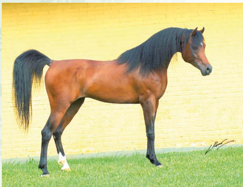
Yllan el Jamaal