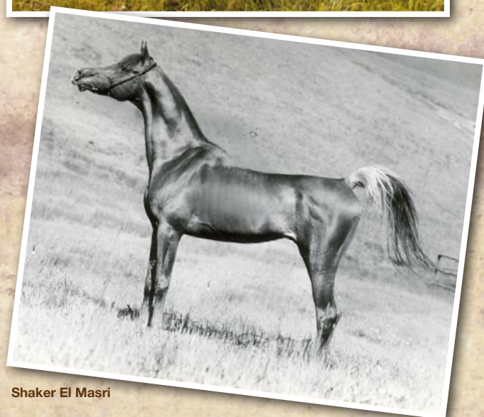
Shaker El Masri

as well as his genetic strength. El Shaklan was so exquisite – so nearly perfect in his form – he defied description. Egyptian bloodlines are world famous for contributing extreme beauty, type, and refinement. El Shaklan received an abundance of those qualities, as well as his genetic strength, through his sire, the straight Egyptian stallion Shaker El Masri, and his grand sire Nazeer. Complimenting El Shaklan's Egyptian bloodlines were the Spanish lines contributed through his dam and maternal ancestors. El Shaklan's dam was the aristocrat mare Estopa, matriarch of a dynasty of champions and champion producers. Few mares throughout the history of the Arabian breed can compete with Estopa's influence, which has expanded to all parts of the world through both her male and female offspring, but primarily through her son El Shaklan and his progeny. Although El Shaklan produced close to 1000 offspring registered in the US, Sanadik El Shaklan was his most prolific and successful son. In time,