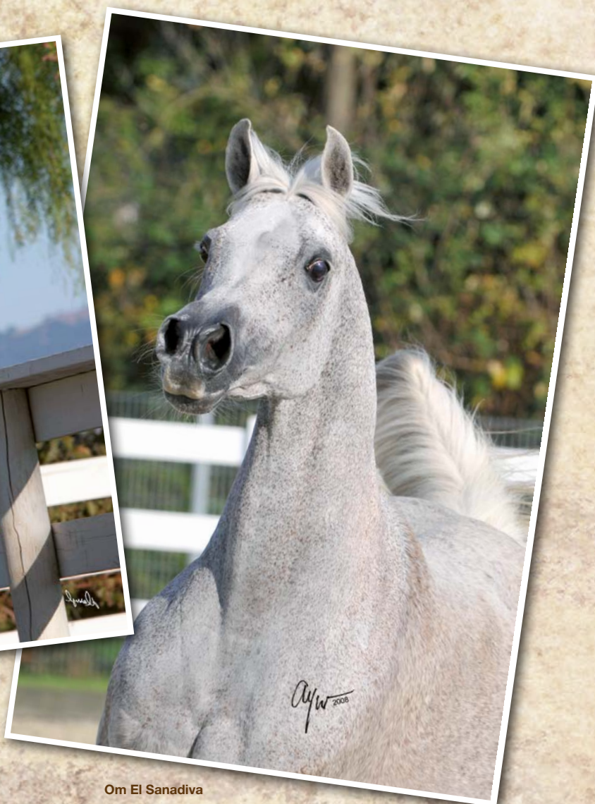
Om El Sanadiva