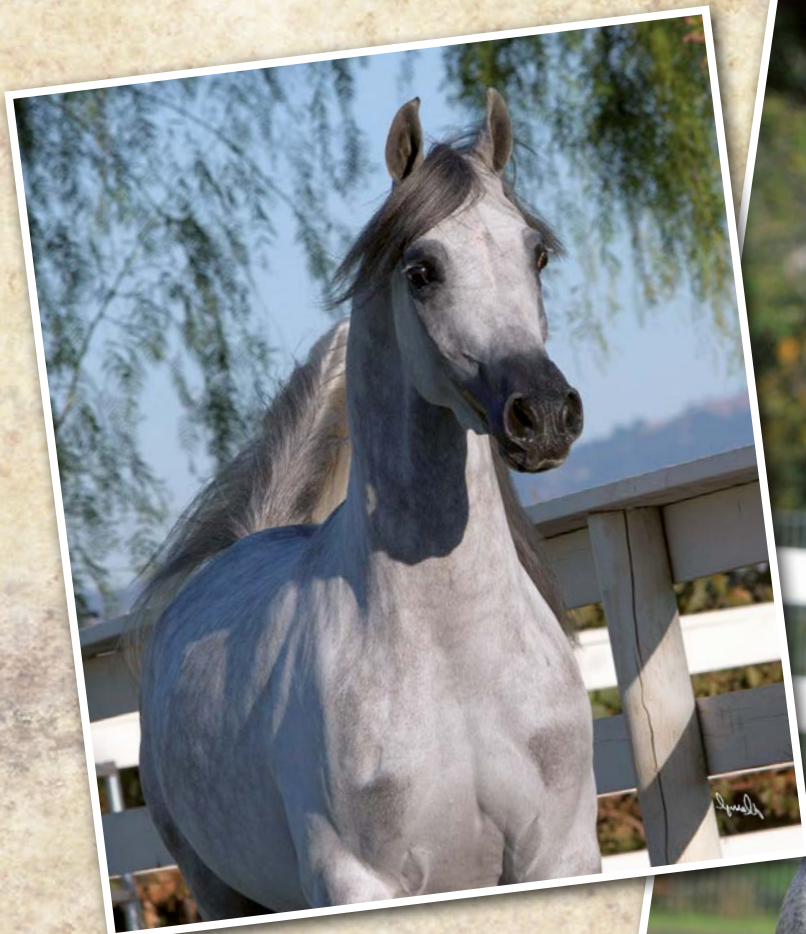
El Euphoria VO