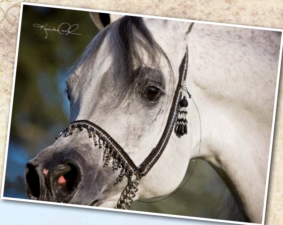
Om El Shahmaan