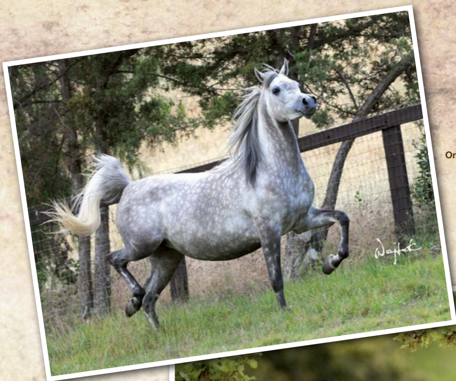
Om El Jinaah