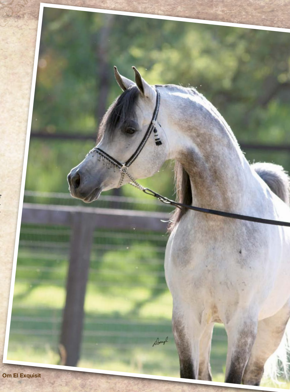
Om El Exquisit