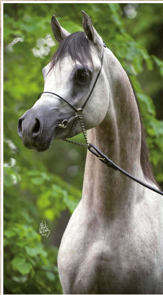
Om El Bellissimo

El Bellissimo is a full brother to the multi-champion filly Om El Bernadette. These are unique individuals because both their sire and dam are by Sanadik El Shaklan. These were unorthodox pairings, but the risks were rewarded with phenomenal results. Om El Arab was honored when the Polish State Stud of Janow Podlaski asked to lease Om El Bellissimo for the 2010 and 2011 breeding seasons. It was an amazing opportunity, and a big responsibility, for a young stallion such as Om El Bellissimo to be included in the historic breeding programs of Poland. However, with a family history of success and a line of ancestors so accomplished in breeding programs around the world, chances are very good that Bellissimo will continue that same tradition and create new generations of champions.