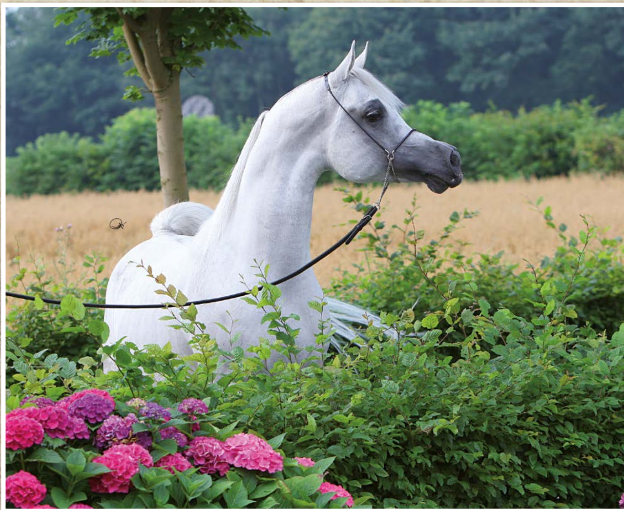
Om El Extrem