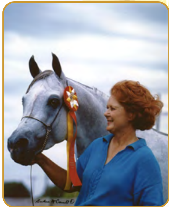
El Sher-Mann (*El Shaklan x Gazira by Gazi)

He is a highly successful sire of show winners.