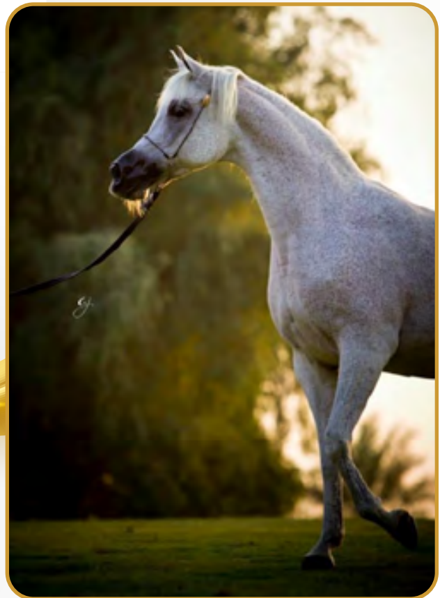
HW Egyptian Art (*El Shaklan x Hal Sheena by Hal Gibby)

Sire of Vona Sher-Renea, a mare who created many dreams!