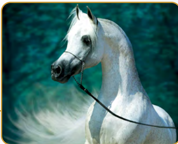
ZT Shakfantasy (*El Shaklan x RH Light Fantasy by Bey Shah)

Sire of El Dorada, Om El Shahmaan, Eagleridge Passionata.