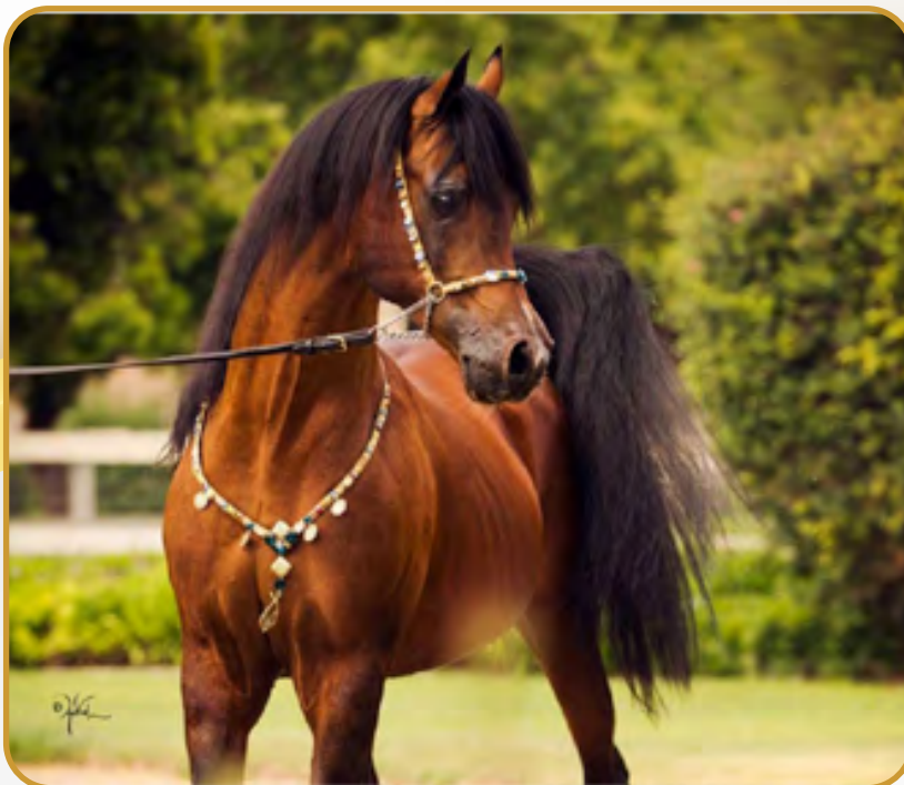
Jullyen El Jamaal (Ali Jamaal x Jullye El Ludjin by Ludjin El Jamaal)

Bred by Haras Mei Lua, Brazil and exported to Varian Arabians, USA.