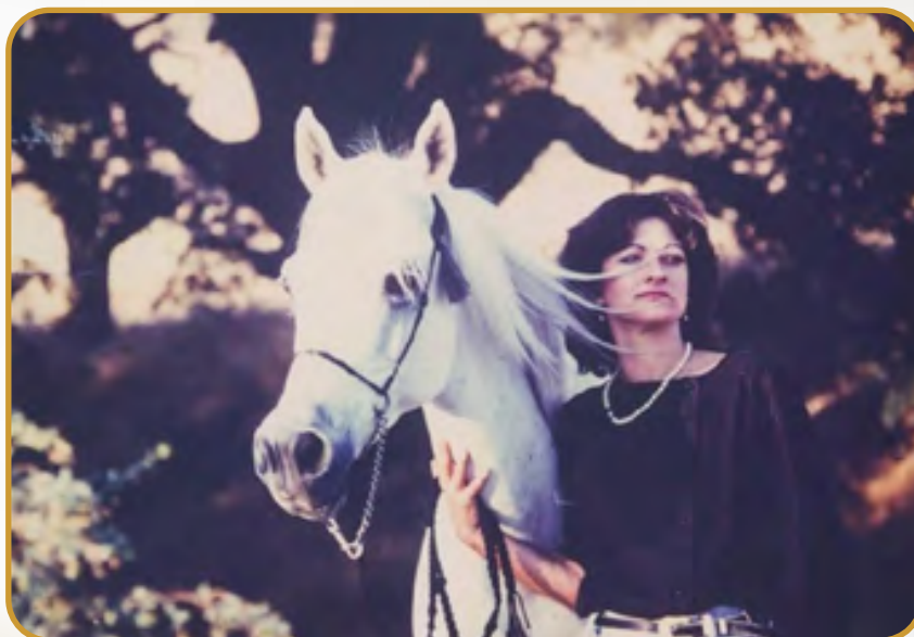
The incomparable Sigi Siller and *Estopa.