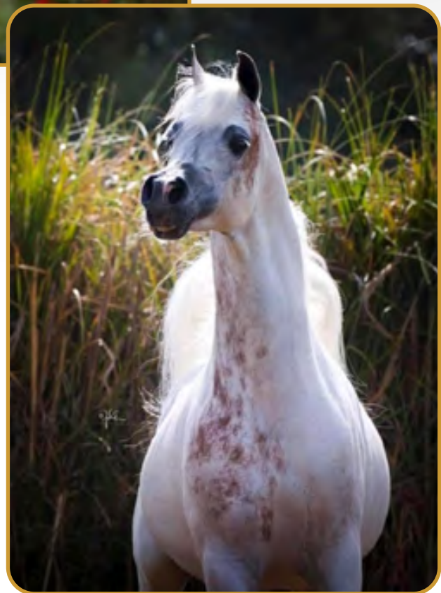
WH Justice (Magnum Psyche x Vona Sher-Renea by El Sher-Mann)

Bred and owned by Rojo Arabians for his lifetime, siring horses such as Vervaldee, DA Valentino, Da Vinci FM and Odyssey SC.