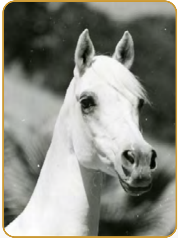
*Estopa's beautiful and refined head.