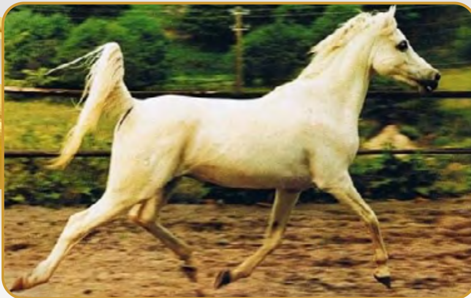
*Estopa, poetry in motion.