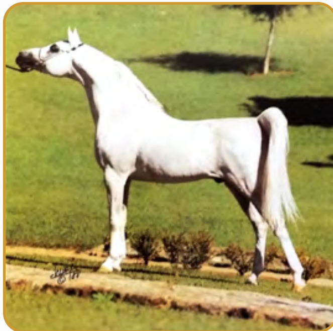
*El Shaklan in Brazil.