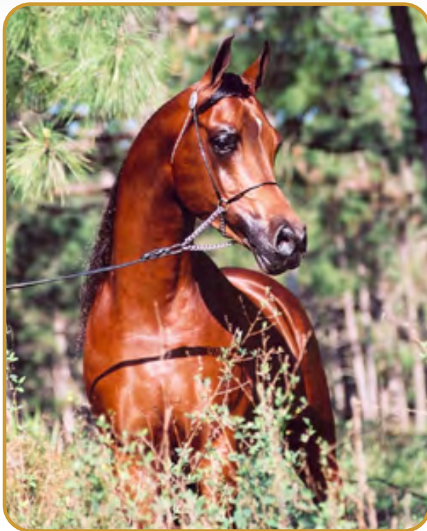
Versace (Fame VF x Precious As Gold by *El Shaklan)

Magnofantasy himself is a successful sire and grandsire of champion winners and top producers.