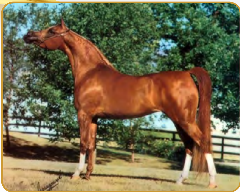
As Precious as Gold (*El Shaklan x Autumn in Gold by Classy McCoy)

This aristocrat mare excelled in multiple disciplines, including halter and pleasure driving.