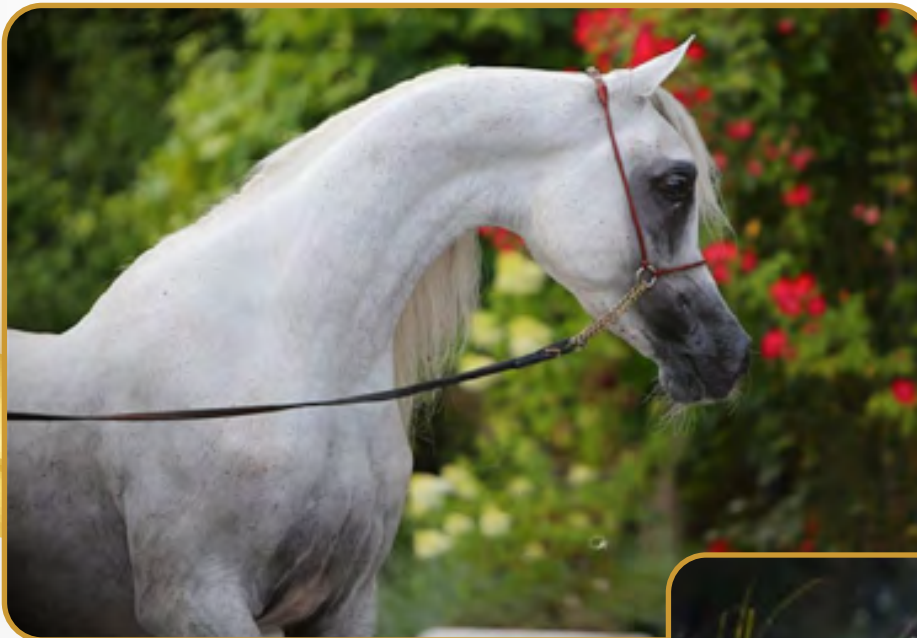
ZT Magnofantasy (ZT Magnanimus x ZT Fantmaisa)

But it was not just with direct progeny that *El Shaklan left his mark. He continues to be a precious gem to this day as his blood runs through many of our most modern and popular horses. Notable horses (and their offsprings) include: