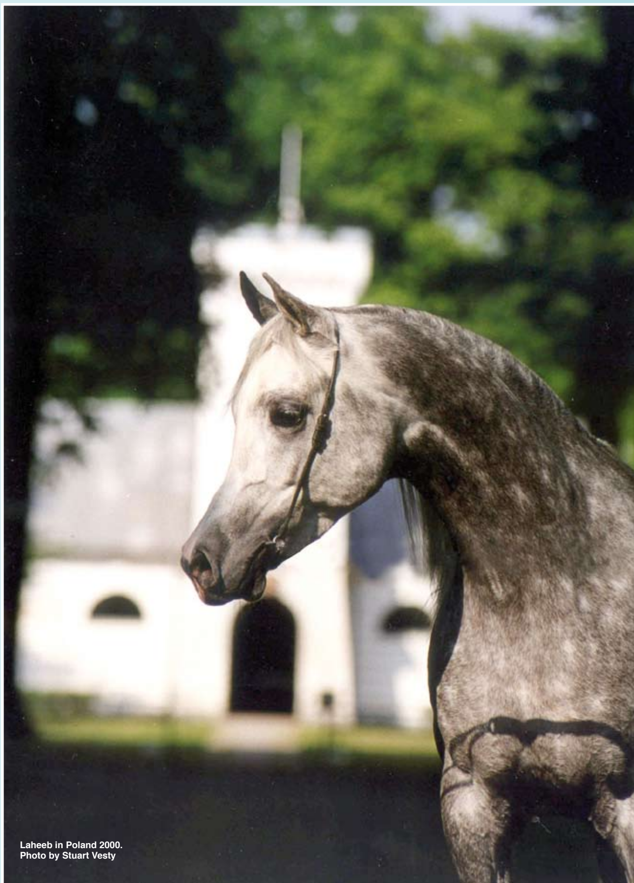
Laheeb in Poland 2000.