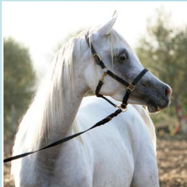
Atiq Ayla