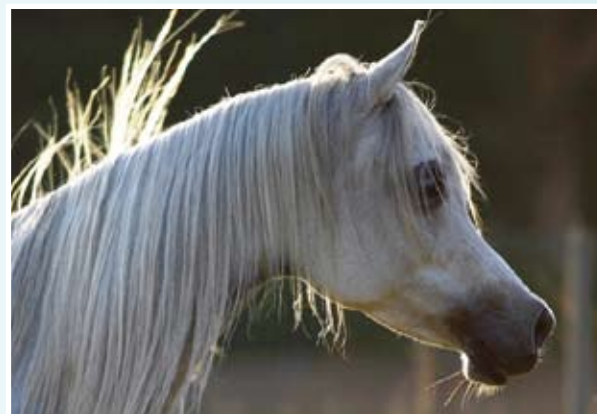
Al Halah AA