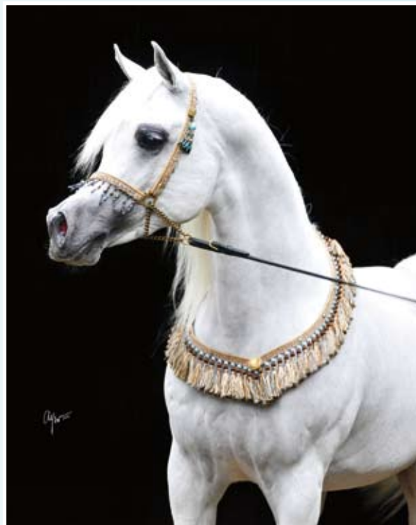
Al Lahab