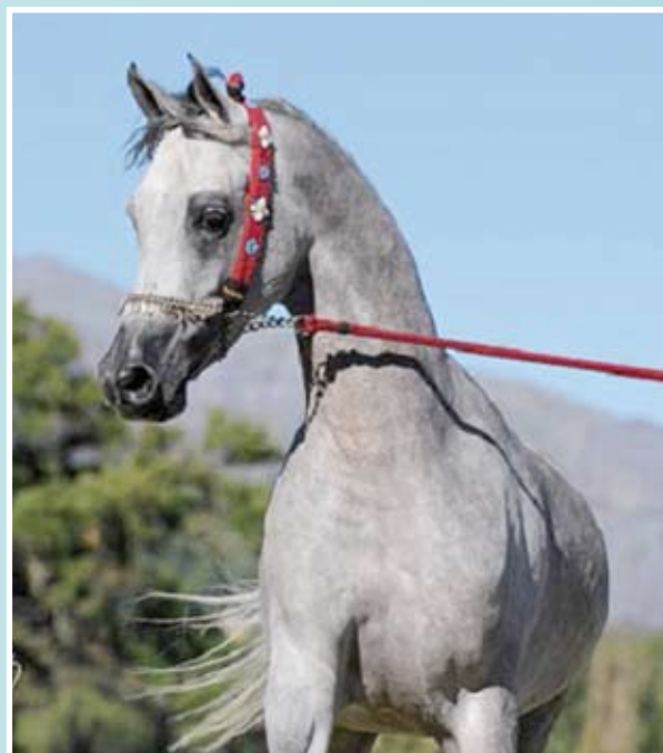
Atiq Haleeb

(Hila B) M/SE/Grey, bred by Idan Atiq Arabian Stud