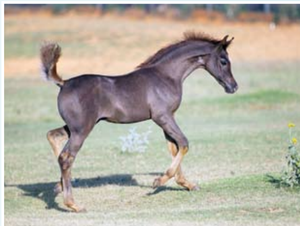
Basmah AA

(Baraqai AA) F/SE/Grey, bred by Ariela Arabians