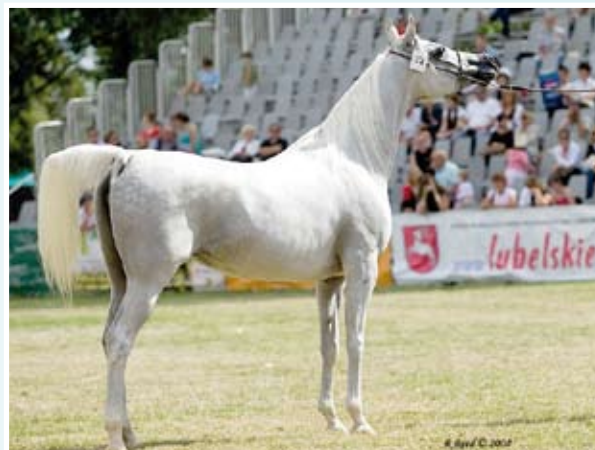
ELLISSARA (out of Ekscella), an ER grey mare bred by Michalow Stud Poland, sold at the 2008 "Pride of Poland" Sale for 240,000 Euro to Saudi Arabia.

to be extremely valuable broodmares, and at the annual Pride of Poland sales, Laheeb daughters have been in great demand and sold for very high prices. These include, among others, the Janow mare Siklawka [Siewka ex Eldon] who sold in 2007 to Qatar for 100,000 Euro,