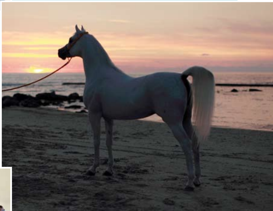
Laheeb.