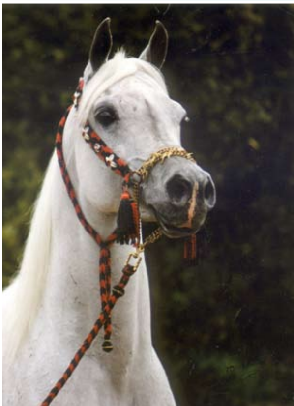
Imperial Imdal

he traces to the stallion Sirecho, an important broodmare sire carrying rare old Egyptian blood.