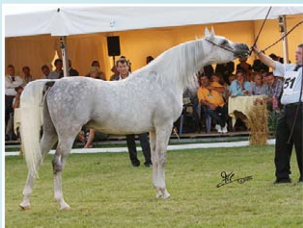
Zlocien - Photo by Irina Filsinger