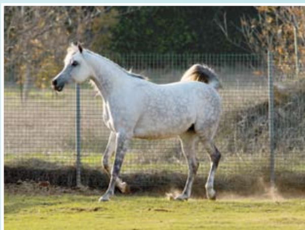
Baraaqa AA