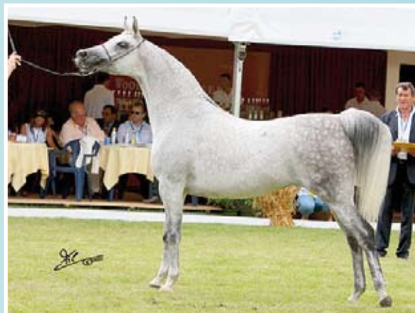
Wieza Babel