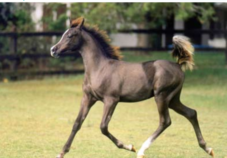
Laheeb in Israel.

Sometime later Laheeb spent a month at Sponle's farm to do the required blood tests and paperwork before shipment back to Israel. Just before Laheeb's departure, on May 2, 2002, Sponle once again told Chen that one day they should consider showing him again. Chen remained doubtful, certain that he was simply being overly optimistic.