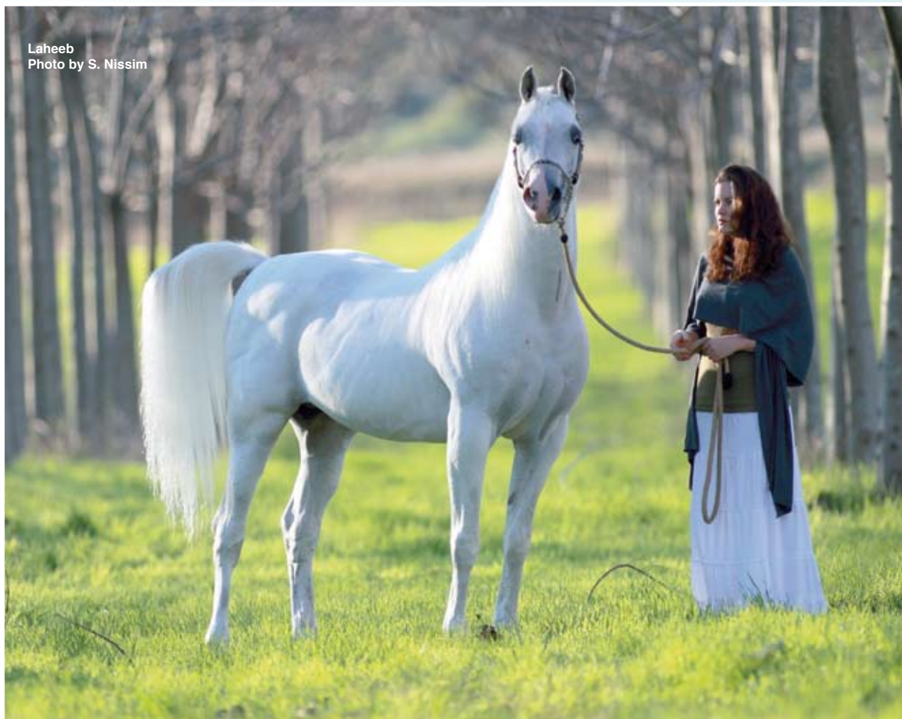
Laheeb