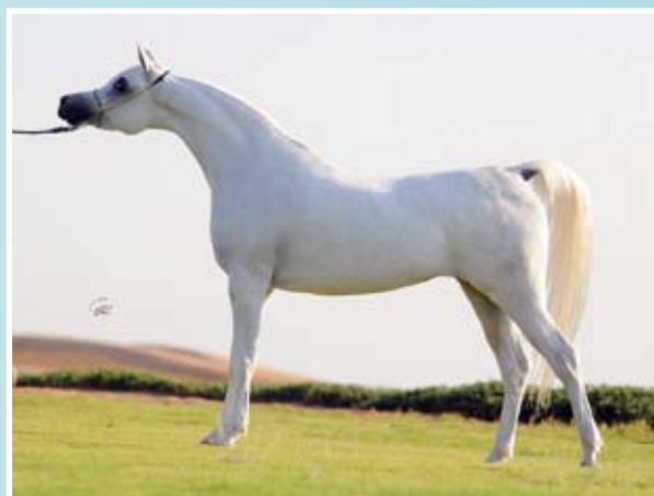
Badawiyeh AA