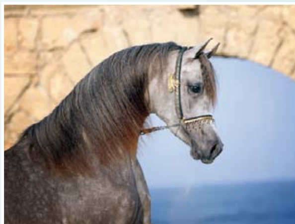
Al Hadiyah AA