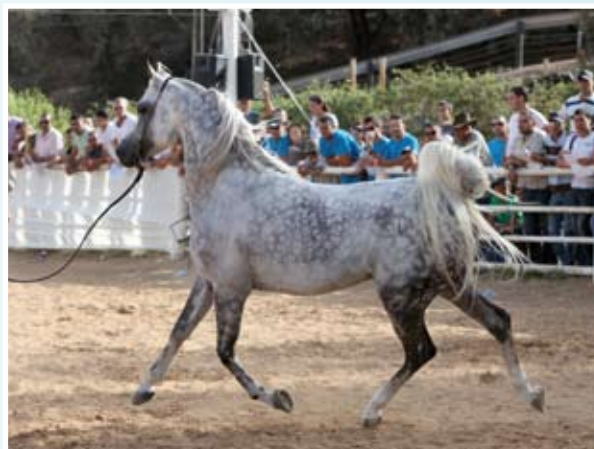
AA Assal.