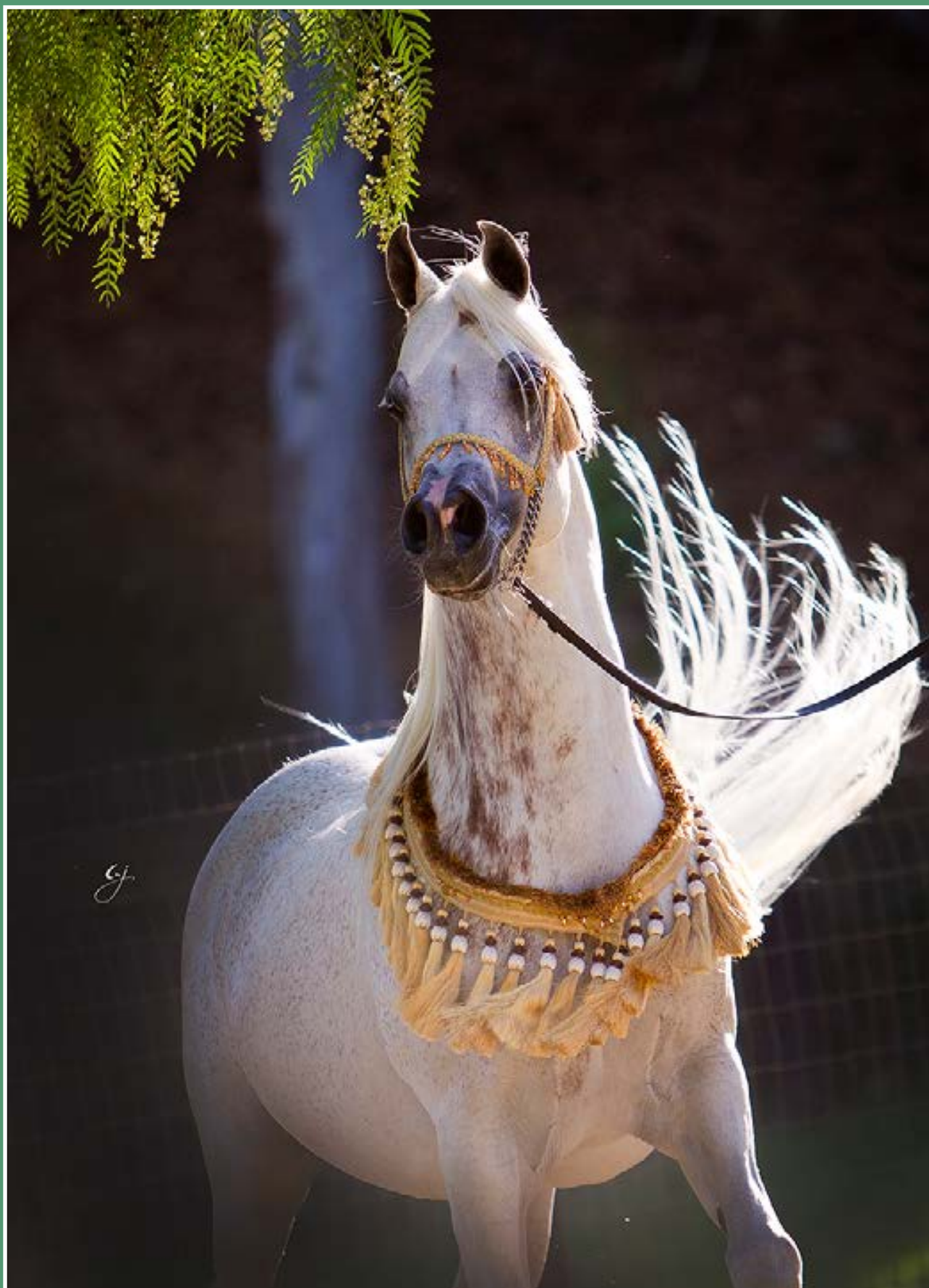
WH Justice, photo by Glenn Jacobs