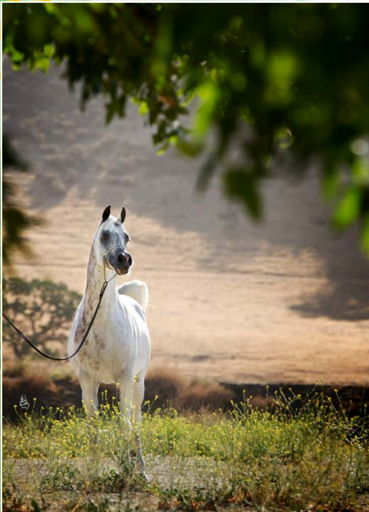
WH Justice, photo by Stuart Vesty