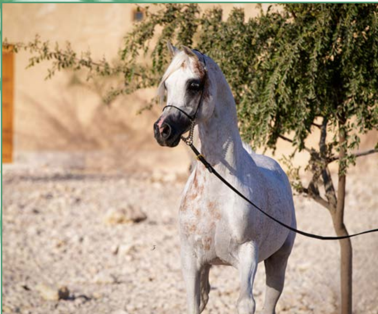
WH Justice

much to watch over, surrounded by people who care for him and respect his needs, and lots of cuddles and carrots every day!?"