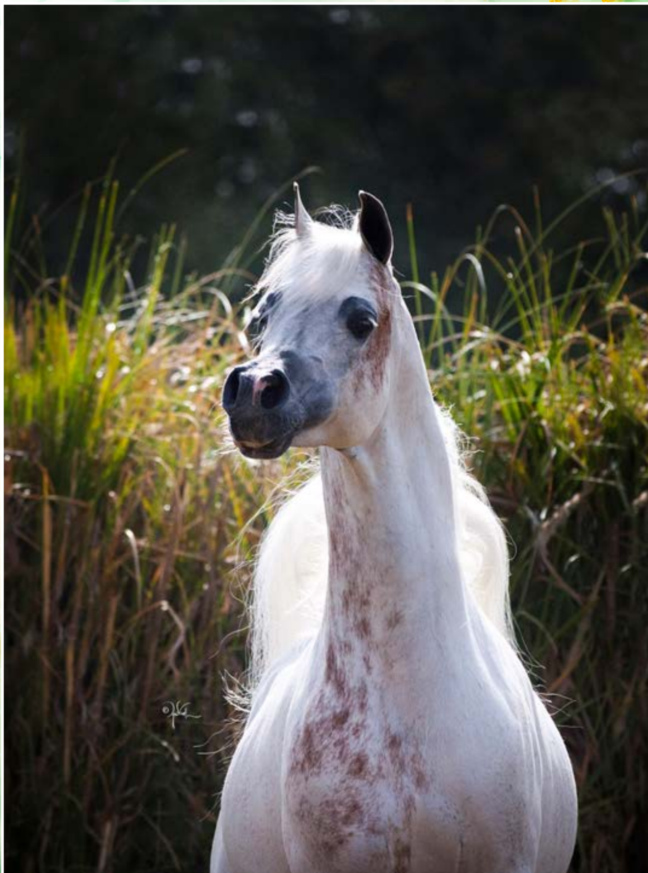
WH Justice