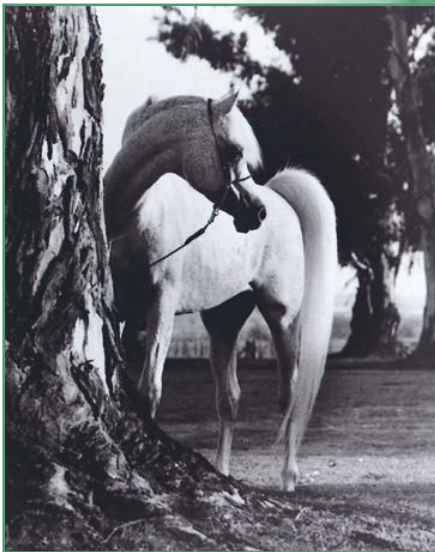
El Shaklan (Shaker El Masri x Estopa), WH Justice's great grand sire.