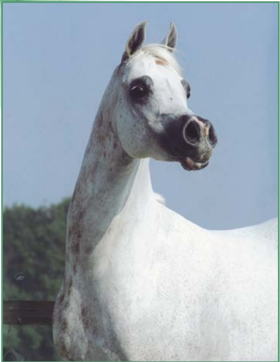
WH Justice