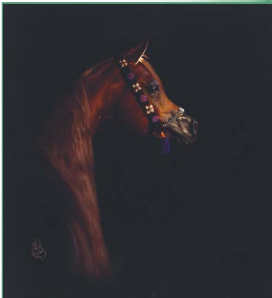
Magnum Psyche