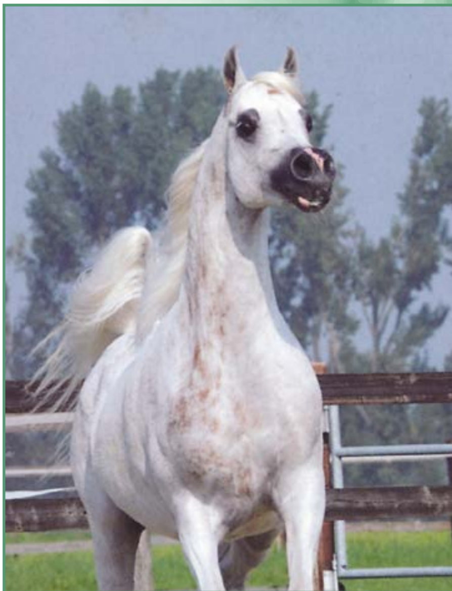
WH Justice