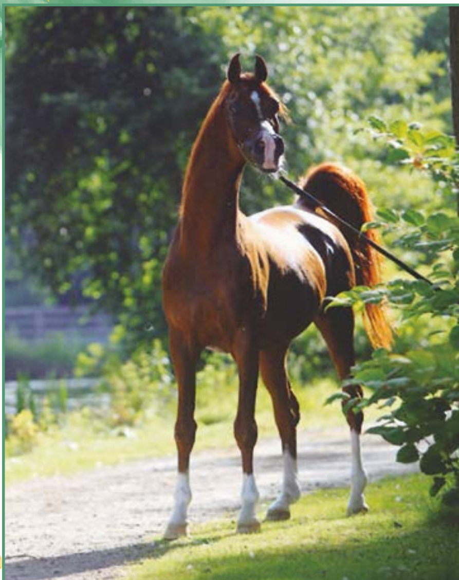
Padrons Psyche (Padron x Kilika), WH Justice's grandsire.