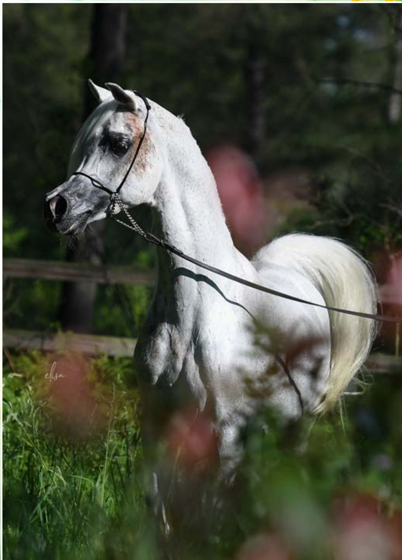
WH Justice (Magnum Psyche x Vona Sher-Renea), photo by Elisa Grassi