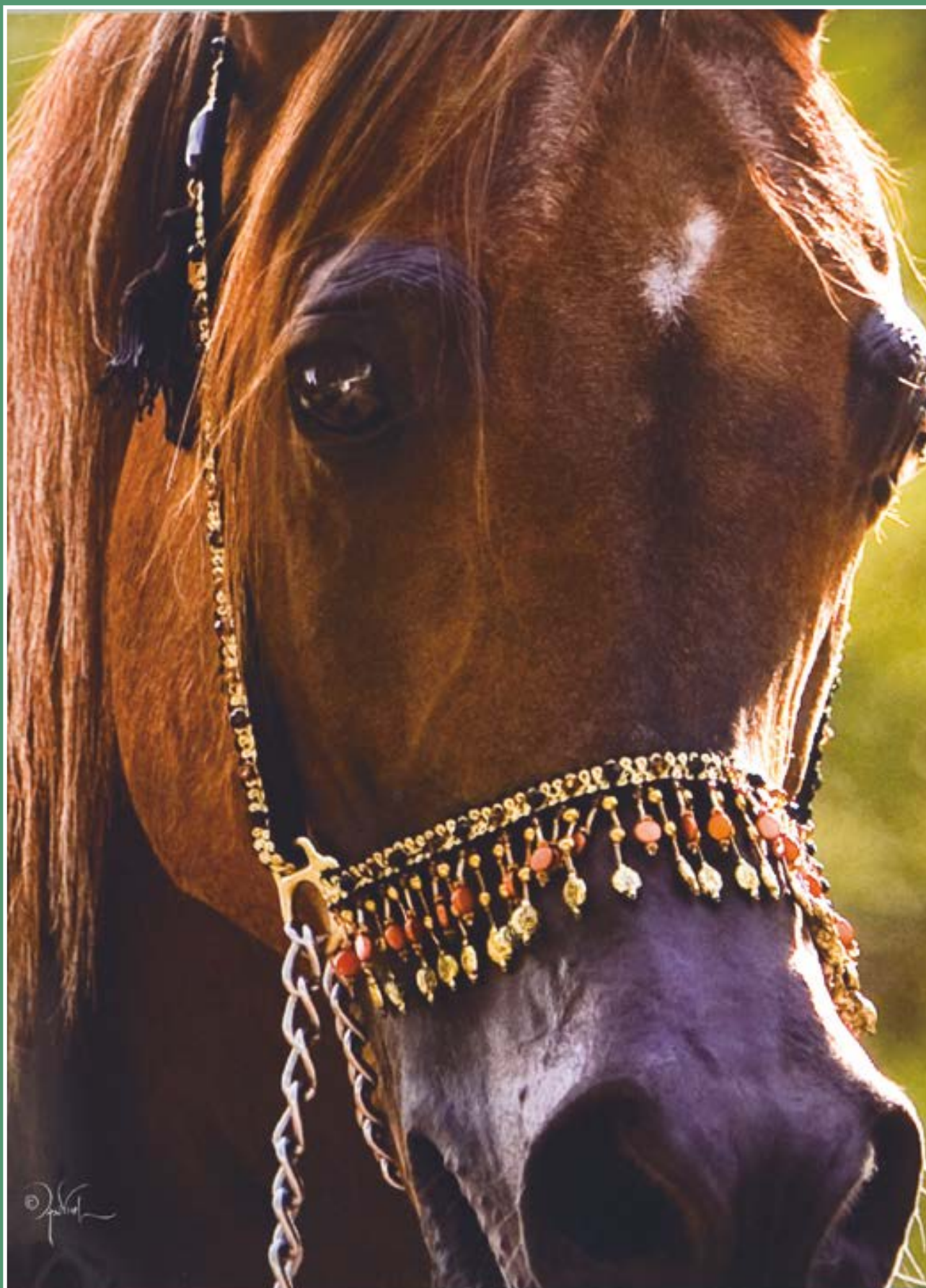
Magnum Psyche