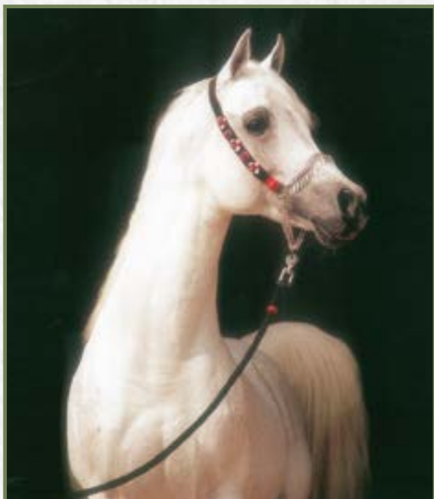
Safir (Salaa El Dine x Aisha)

delicate, a little foal as if made out of porcelain. It took a lot of effort to make him grow up to become a healthy horse. When one examined him for a correct body conformation, it could not be overlooked that it was his hindquarters which worried. This somewhat unfortunate structure was not a complete surprise, it is known. It appeared before in other stallions of El Zahraa, even in members of the Hadban family.