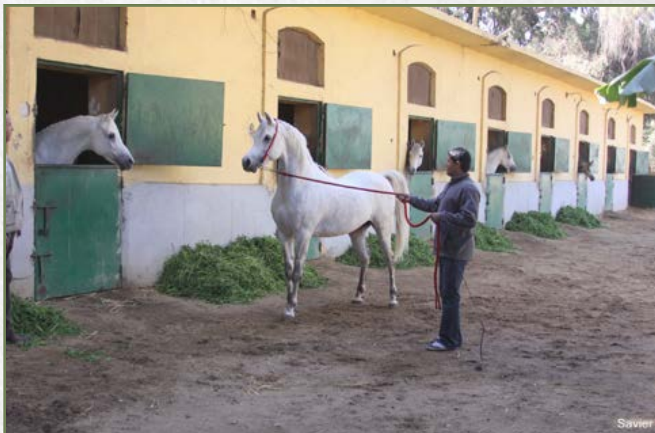
The stallions stables in El Zahraa, Cairo

In Arabian horse breeding one comes across such