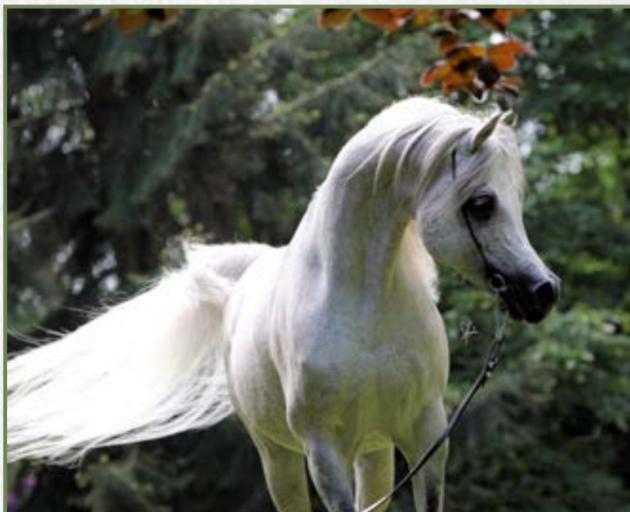
NK Nadeer (NK Hafid Jamil x NK Nadirah)