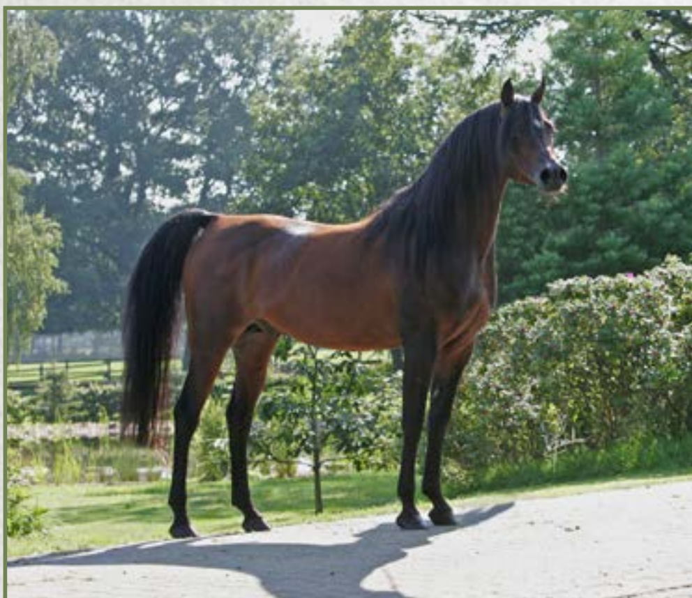
NK Kamar El Dine (NK Hafid Jamil x Ansata Ken Ranya)