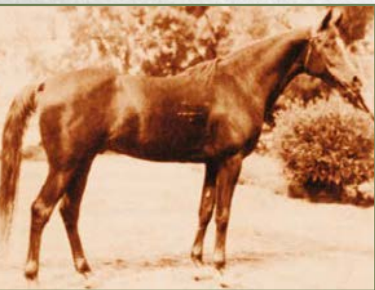
Alaa El Dine