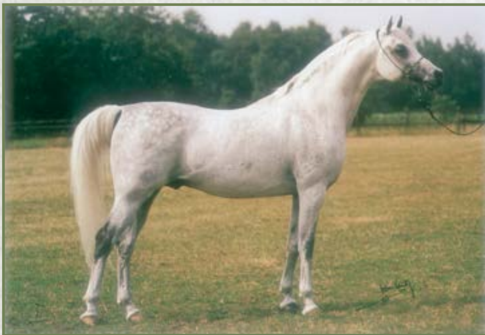
Salaa El Dine (Ansata Halim Shah x Hanan)