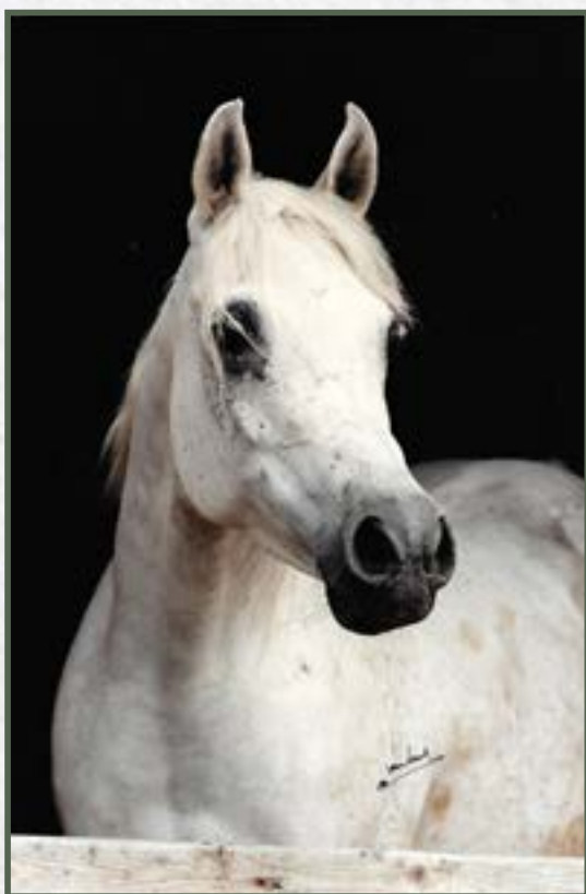
Ghazala (Ghazal x Hanan)

Ibn Nejdy could be described as a typical member of the Hadban family, though he was, due to his dam Ghazalla, an Obayan. Members of this family would normally look as follows: rectangular horses with a high-set neck, a perfect tail carriage and a small head. This was also the look of Ibn Nejdy, totally dominated by his sire Nejdy. However, Ibn Nejdy excels with two more very important features: his big round eyes and very interesting small ears, a typical feature of Katharinenhof's Arabians. Ibn Nejdy was a sire of several sons and daughters, but one of them was a surprise for everyone who has seen him. It was NK Hafid Jamil. From his first days on as a