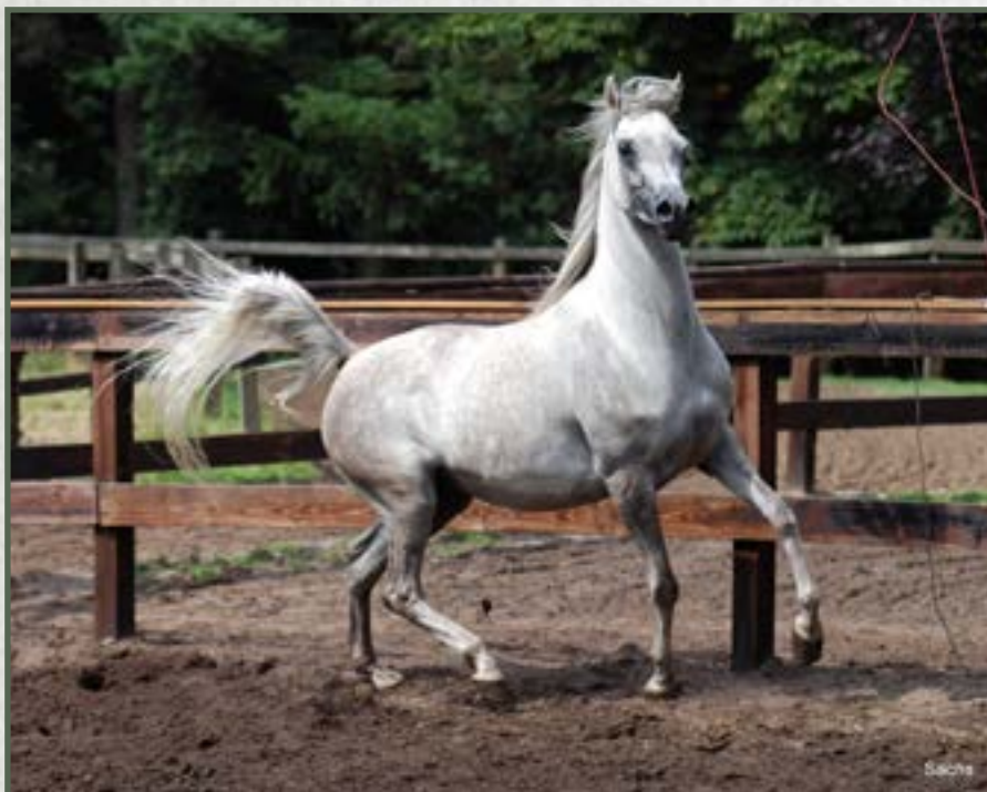
NK Nadirah (Adnan x Nashua)