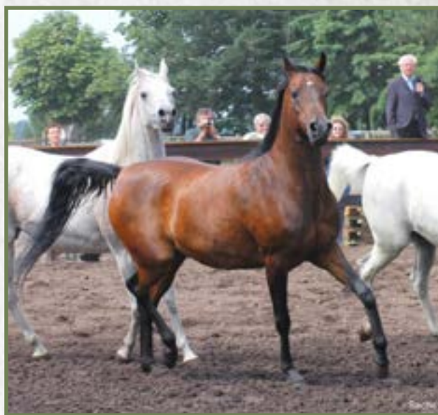
Helala (Salaa El Dine x Ansata Gloriana)

is perfectly fulfilled in the case of this horse. The choice of his parentage could not be better; all horses, male and female, appear as a very nice uniform group. This friendly horse took an important position in the Nazeer sire line. He is responsible for the situation that this line could continue to grow very successfully further into the future.