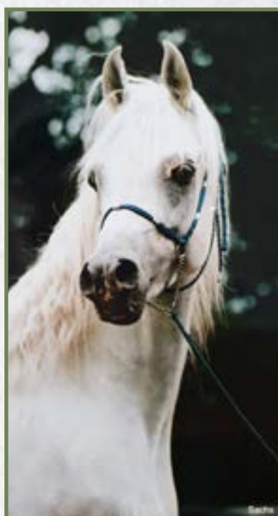
Ibn Nejdy (Nejdy x Ghazala)

delicate, a little foal as if made out of porcelain. It took a lot of effort to make him grow up to become a healthy horse. When one examined him for a correct body conformation, it could not be overlooked that it was his hindquarters which worried. This somewhat unfortunate structure was not a complete surprise, it is known. It appeared before in other stallions of El Zahraa, even in members of the Hadban family.