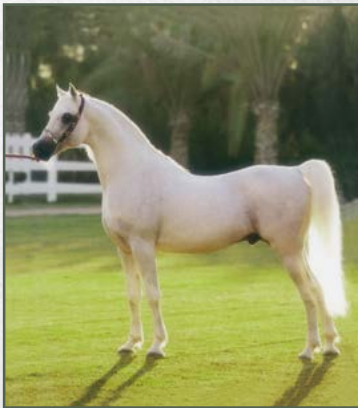
Adnan (Salaa El Dine x Ghazala)