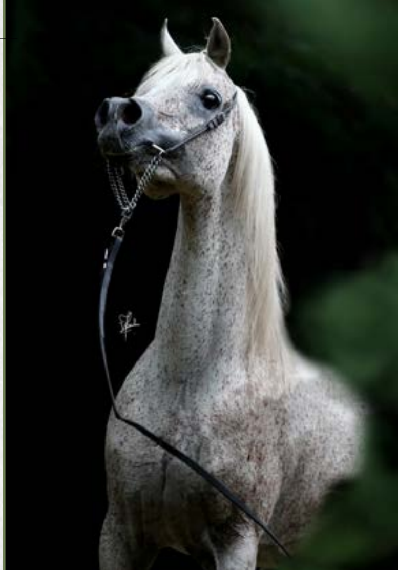
NK Hafid Jamil (Ibn Nejdy x Helala)

NK Hafid Jamil’s tail carriage was absolutely striking, a heritage of the Hadban family in Egypt, which is famous in this respect. Even when his hind part was not the best, NK Hafid Jamil was a powerfully moving horse with a light knee-action in front.