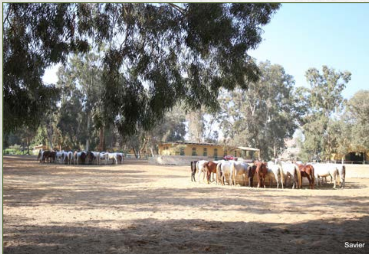
the paddocks of the mares at El Zahraa, Cairo

It took some time, but after several generations of breeding in these studs in Egypt certain stallions emerged who proved to be valuable sires: an older group, such as Mansour, Shahloul, Sheikh El Arab, El Sareei, Nazeer, and a later younger group, such as Anter, Ghassir, Touhotmos, Sid Abouhom, Alaa el Din, Morafic, Sameh, Ibn Hafifa, Amrullah, and Nasrallah. In addition, according to the El Zahraa