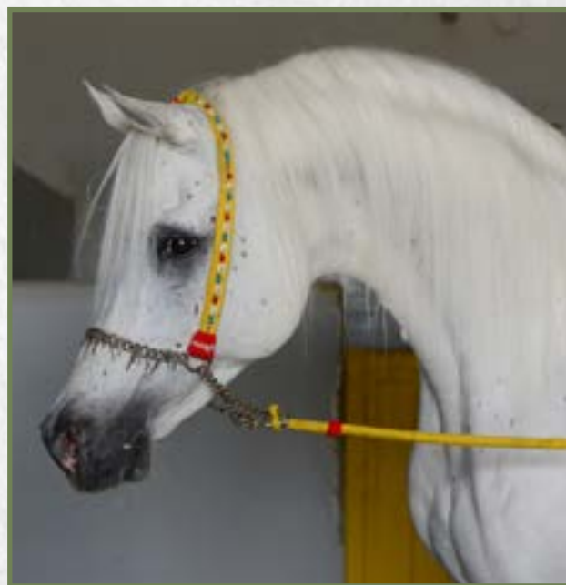
NK Jamal El Dine (NK Hafid Jamil x Ansata Ken Ranya)

...yes, but NK Hafid Jamil daughters did not fit into the breeding concept of Katharinenhof, consisting of a closed population with a limited number of brood mares and one sire-line. Since NK Hafid Jamil had some very appreciated qualities which should be distributed over the whole herd, it is advisable to use consequently his sons for such a purpose. To keep his daughters as well would lead into the direction of too close breeding, such as brothers to sisters or half-brothers to half-sisters. Therefore, it was decided to jump one generation on the female side and to breed