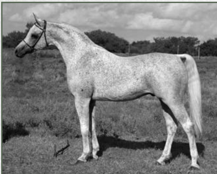
Ansata Ibn Halima (Nazeer x Halima)