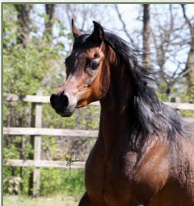
NK Nahla (NK Hafid Jamil x NK Nasrin)

NK Nadeer is a grey and NK Nizam is a bay, both are out of the mare NK Nadirah, the most striking mare of good size in the stud in expression and movement, and a member of the Hadban family again. Only the word “elegance” can describe this mare properly. She is an Adnan daughter and is for sure the best