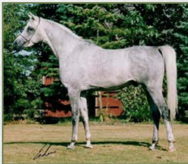
Nejdy (Salaa El Dine x Lutfia)