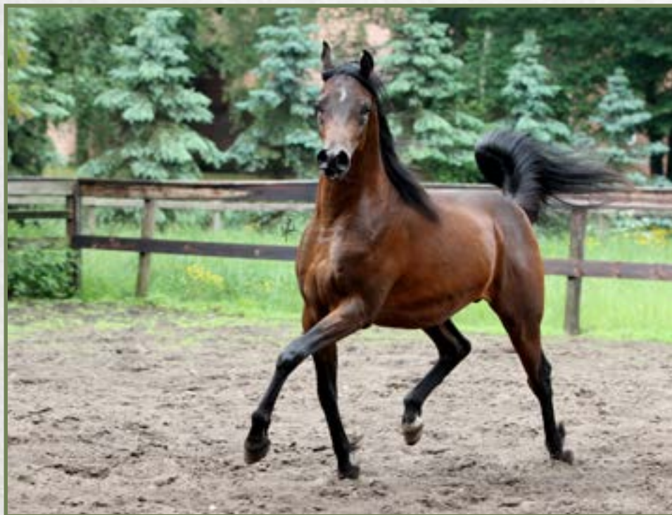
NK Nizam (NK Hafid Jamil x NK Nadirah)

daughters, followed by four Jamal el Dine daughters and further four NK Kamar el Dine daughters. NK Nizam is on his way to arrive possibly at a similar position as a sire of fine daughters who will be added later on into the breeding herd.