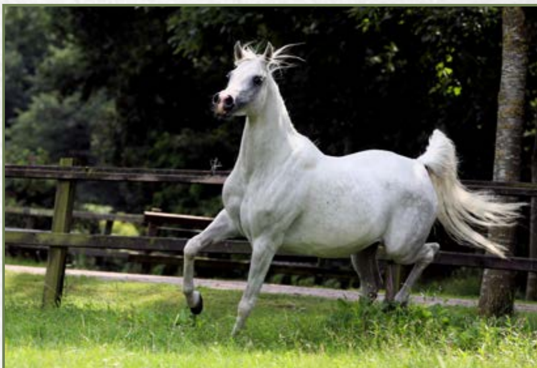
NK Abia (NK Jamal El Dine x NK Aziza)

Kuwait, or NK Jury and NK Neehelia, the last one a highly estimated broodmare in the Al Rayan Stud.