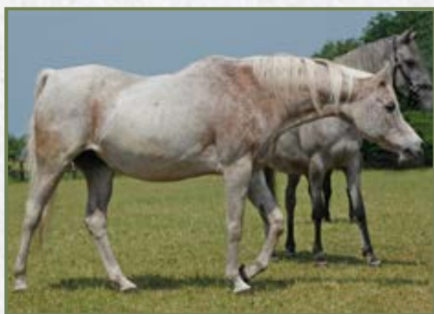
Ansata Ken Ranya (Salaa El Dine x Ansata Prima Rose)

Now this weakness showed up in this horse again. However, his front, his head, his neck, his withers, his chest, were perfect and made up for his deficiencies in the hindquarters. Particularly when looking at his head and neck one was impressed by this unique appearance: the shortest and broadest head, never seen before in all previous generations, and very small ears in addition; short head and short ears – this fits