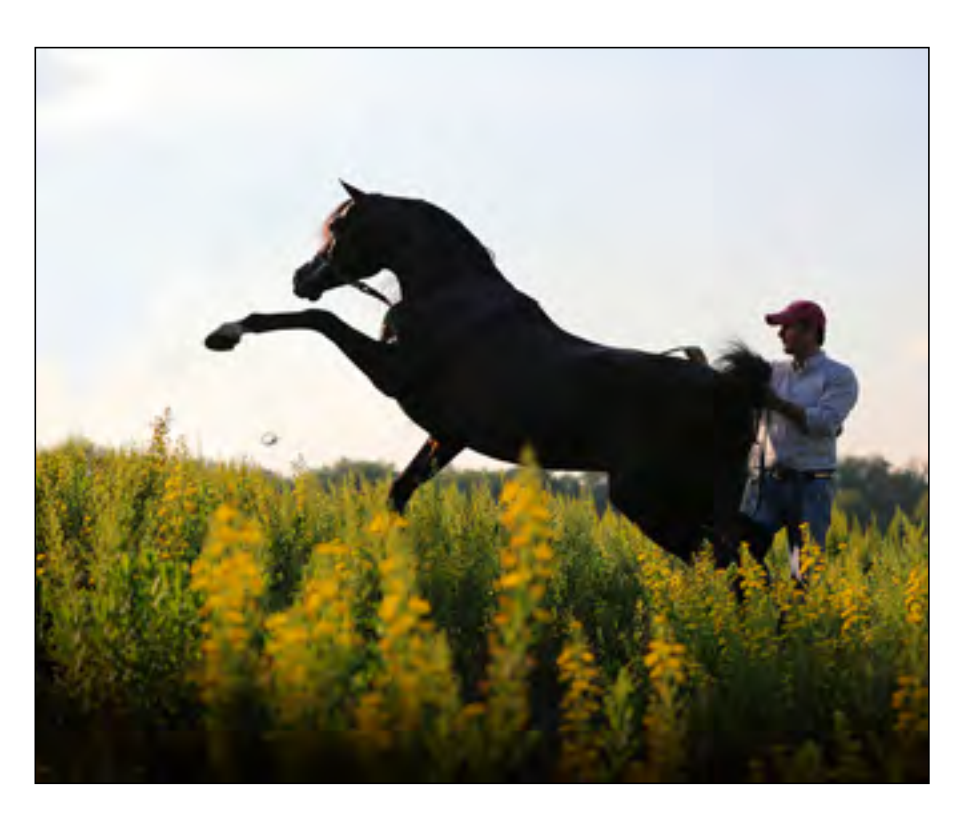
Wadee Al Shaqab (Marwan Al Shaqab x OFW Mishaabl)