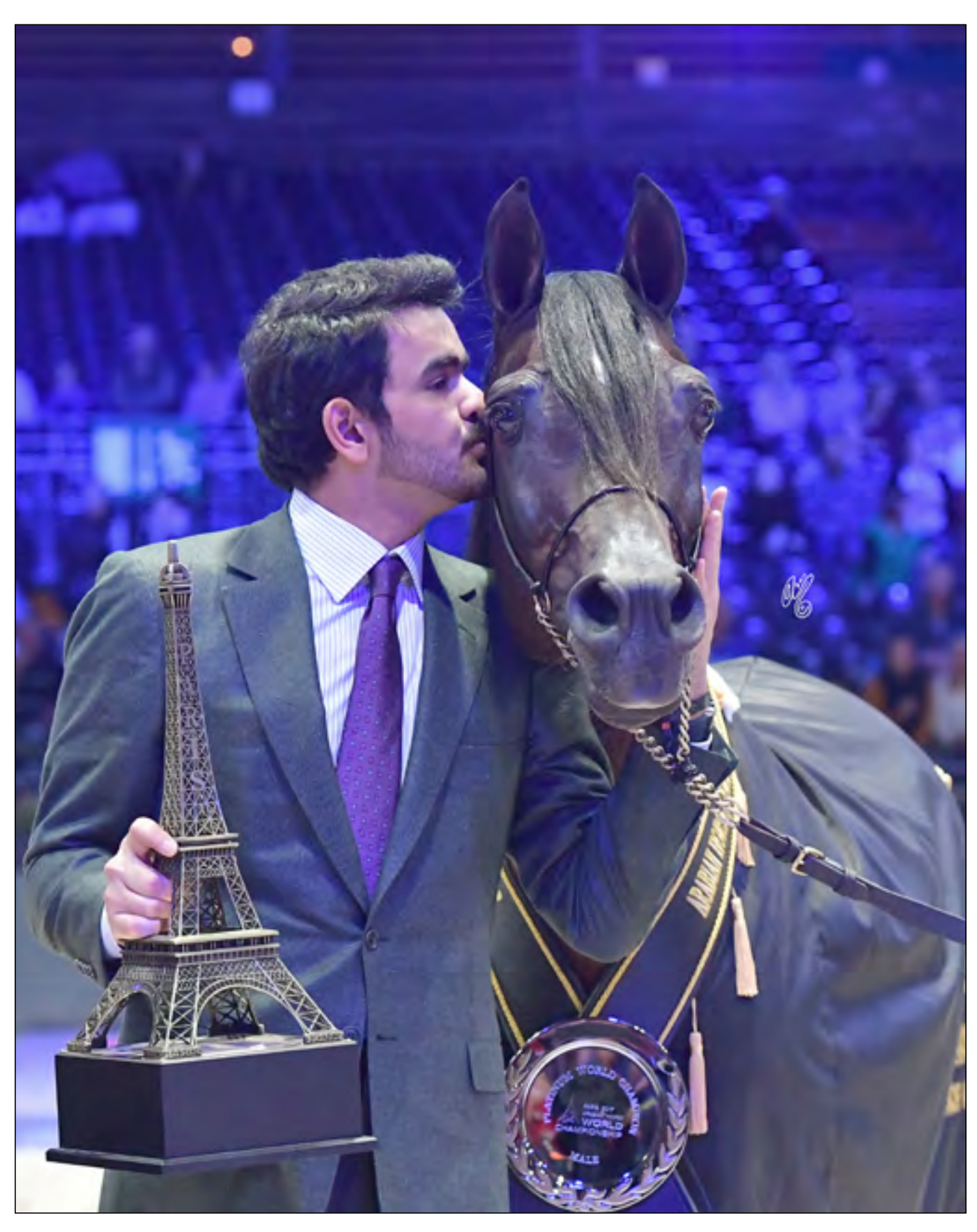
Platinum Medal Senior Stallion Arabian Horse World Championship 2017