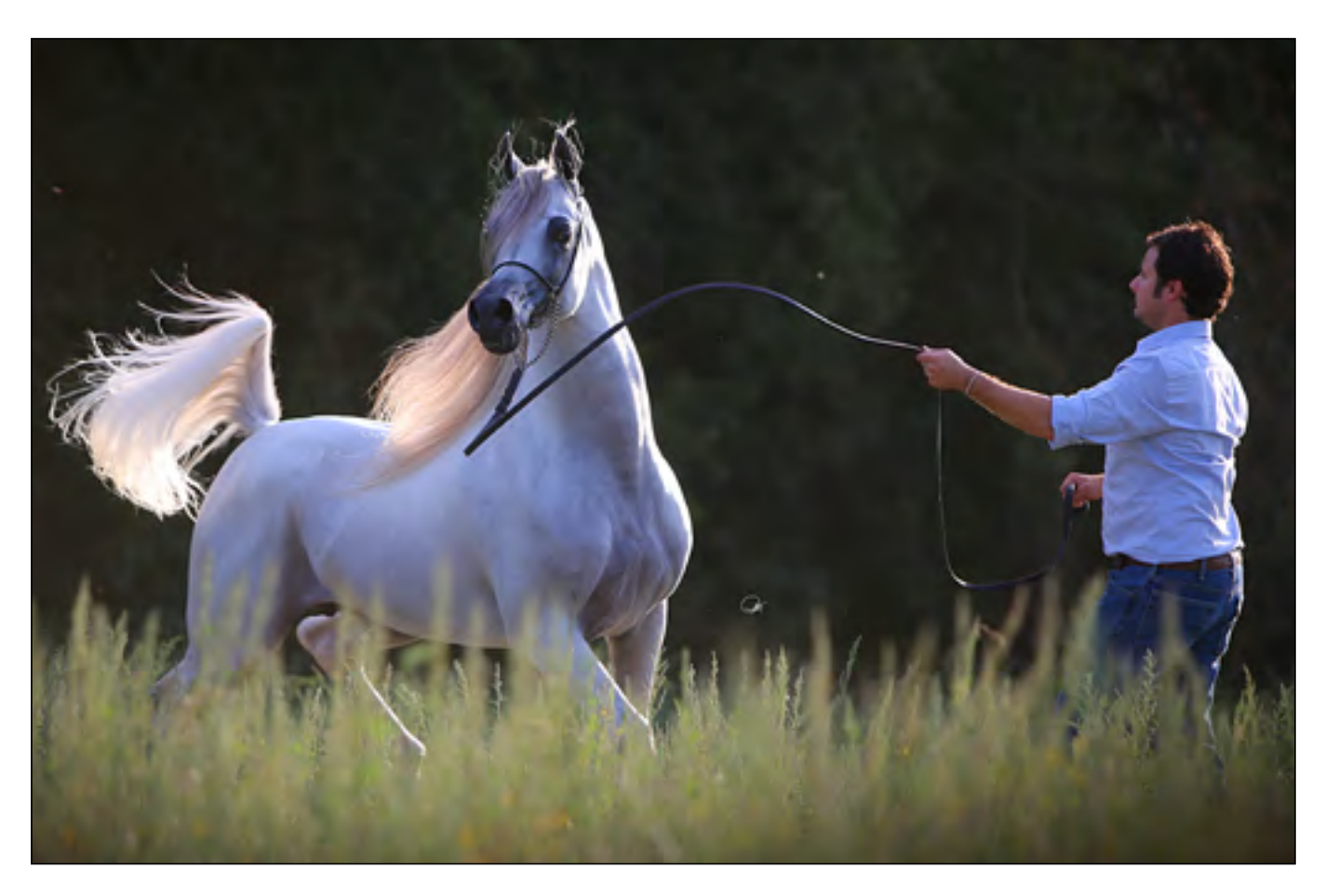
Hariry Al Shaqab (Marwan Al Shaqab x White Silkk)