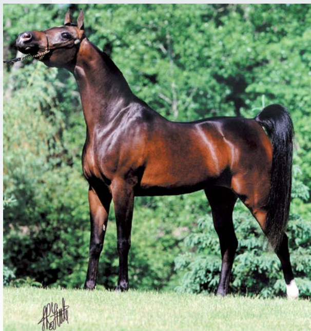
PR Desert Rose+ 1998 bay mare (x AK Nadara )