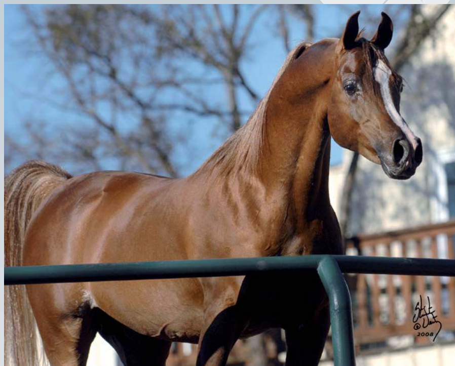
Thee Asil 1997 chestnut stallion (x Alia Barakaa)

producing intelligent, athletic horses with long graceful necks and powerful shoulders and also a source of the dark bay and black color. Asmarr carries ten crosses to Ibn Rabdan noted for excellent bodies and long shapely necks. Thus the recipe for Thee Desperado is an amalgam of classic nobility and proud carriage with clean flat bone, fine skin, great beauty, beautifully balanced body, athletic talent from the Rabdan blood, all in a rich deep Mahogany bay color. However the soul is in the eyes and Thee Desperado has this in great measure from his magnificent great grandmother, Nagliah, a splendid mare who you can see much of in his face. I saw her years ago and was charmed by her lovely eyes and beautiful facial proportions.