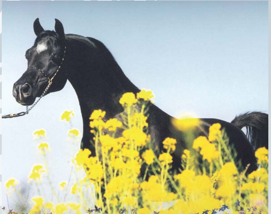
Windsprees Mirage 1996 black stallion (x GL Lady Mirage)