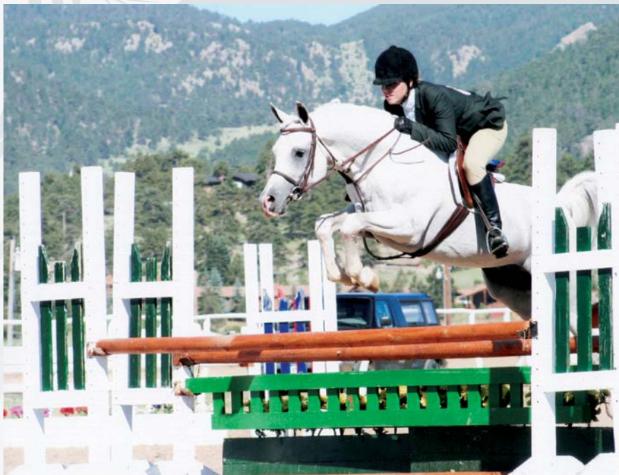
SA Thee Moon Dancer 1997 grey stallion (x AK Shalina)

recipe for Thee Desperado? From the beautifully proportioned Ibn Galal, who traces to Yosreia on both sides of his pedigree, and from the mare Bakria who is a Hadban Enzahi on both sides of her pedigree. The careful weaving of Morafic in the pedigree also introduces each time his immortal grand dam Moniet El Nefous, the undisputed queen of Egypt and a very strong source of classic beauty in the recipe. Her blood is intensified when Morafic was bred to his full sister in blood Bint Mona producing the legendary sire The Egyptian Prince, sire of Thee Desperado's dam. Yet for all the careful blending by line breeding these strong elements in the recipe, the female lines of both the sire and dam of Thee Desperado are relatively outcross having no lines to Nazeer in their pedigree. This is represented by the non-Nazeer mares Bakria, grand dam of The Minstril, and Asmarr grand dam of Thee Desperado. In each of these mares are multiple lines to the Rabdan El Azrak blood, noted for