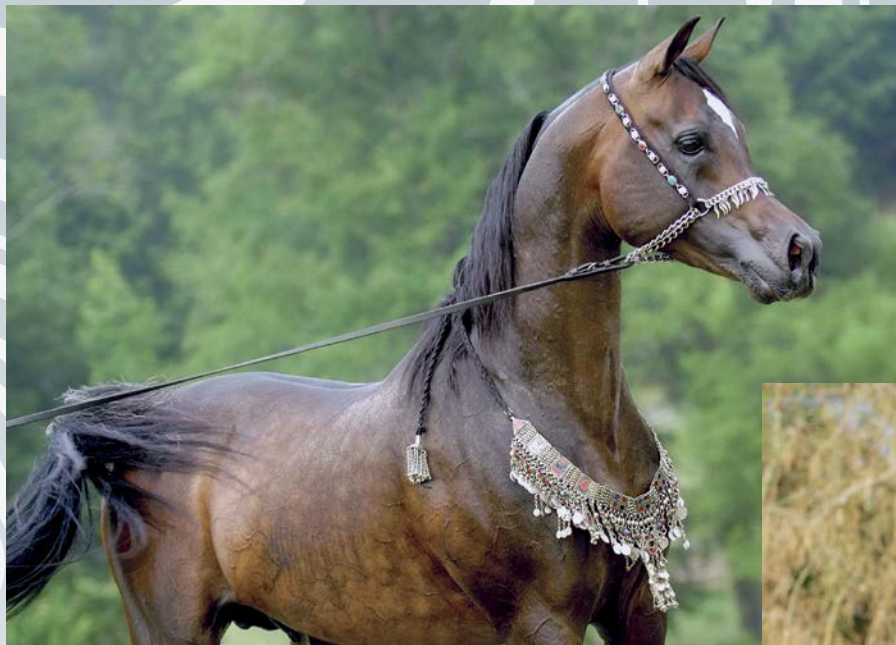
Botswana 1998 bay stallion (x The Minuet )