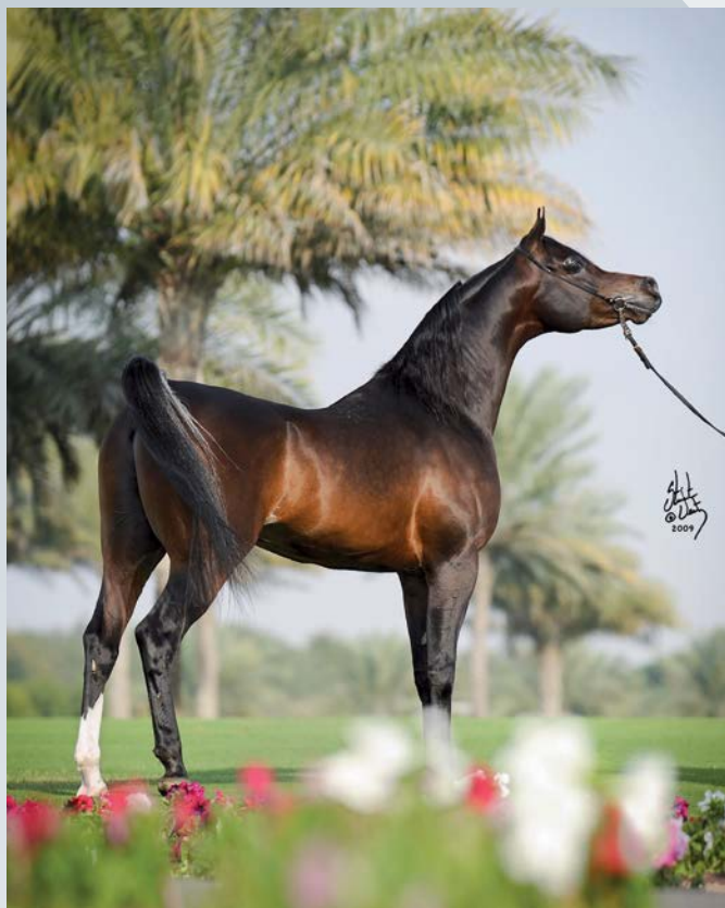
The celebrated stallion Royal Colours. He is double Thee Desperado being sired by True Colours, a son of Thee Desperado and out of Xtreme Wonder, a grand daughter of Thee Desperado.