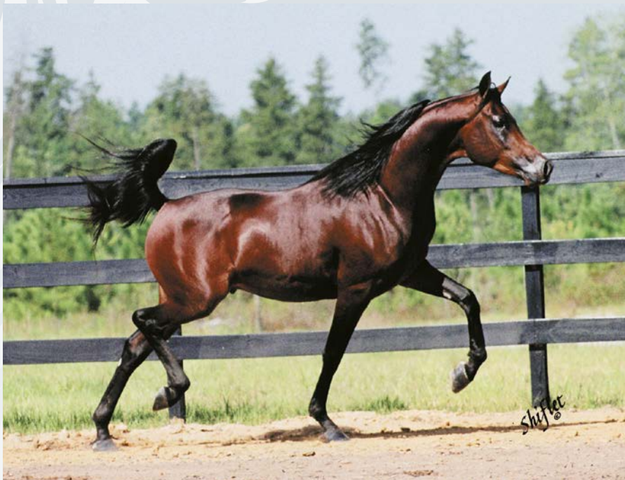
BG Maasai 1994 bay stallion (x DM Mimosa)

is famed for one particular dish of the most sought after bouquet of flavors that you remember forever, and the secret is found in their recipe. A good recipe finds a unique way to blend strong flavors that would stand on their own into a new and memorable flavor.