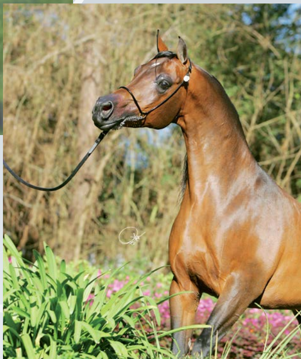
Insignia DeSha 2000 bay stallion (x Jubillee )