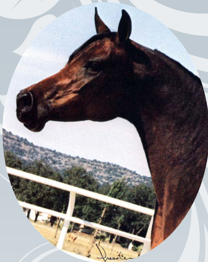
Nagliah 1972 bay mare (Ibn Hafiza x Nabilabbh). She was a lovely mare with large dark eyes. She is another outcross element in the pedigree of Thee Desperado also having no Nazeer or Moniet El Nefous breeding. She is the tail female line of Thee Desperado and he shows much of her facial character and rich mahogany bay color.