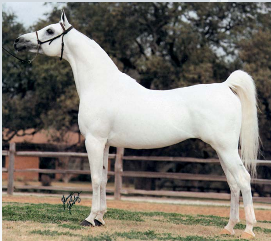
The Egyptian Prince 1967 grey stallion (Morafic x Bint Mona) another legend in Egyptian breeding, he is the maternal grandsire of Thee Desperado.