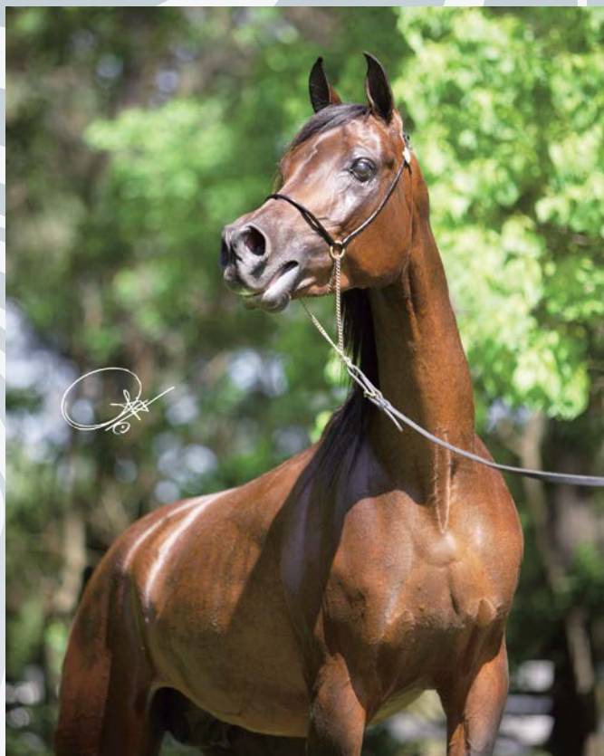
Thee Cappuccino 1994 bay mare (x Jubilllee)