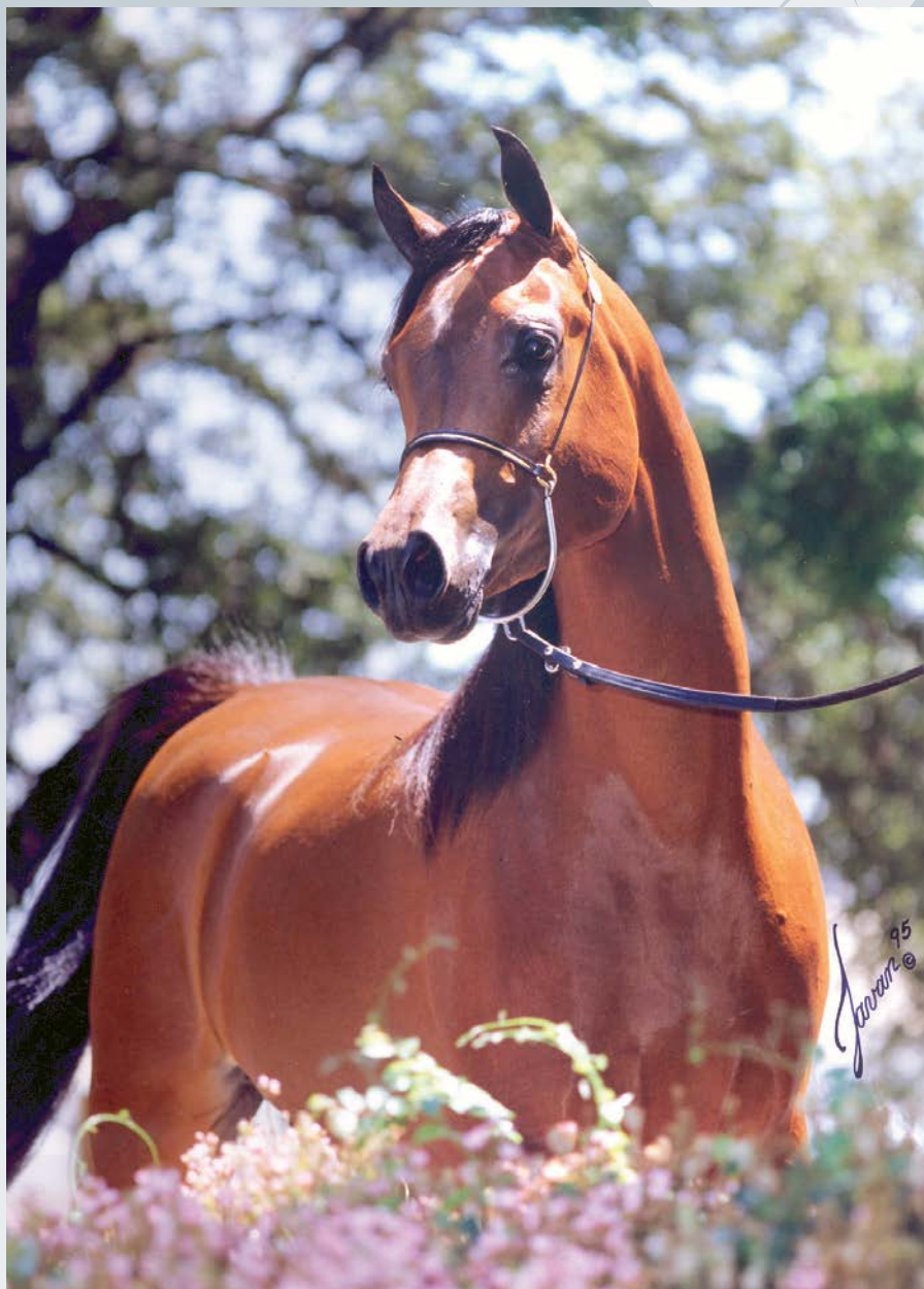
BJ Thee Mustafa 1993 bay stallion (x Khalili El Bahar)