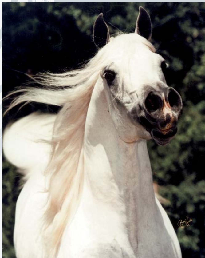
Ruminaja Ali 1976 grey stallion (Shaikh Al Badi x Bint Magidaa by Khofo) Multi U.S. National championship winner and an international patriarch in Arabian breeding. He is the paternal grandsire of Thee Desperado.