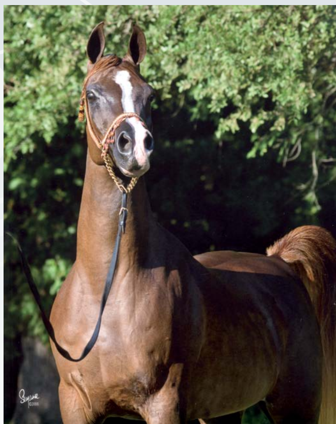
Sweet Eloise 1998 chestnut mare (x Kuhaylah Nitaya)