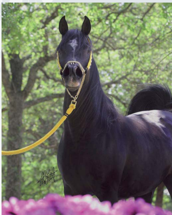
Queen Sheeba 1996 black mare (x MinstrilsGabriella)