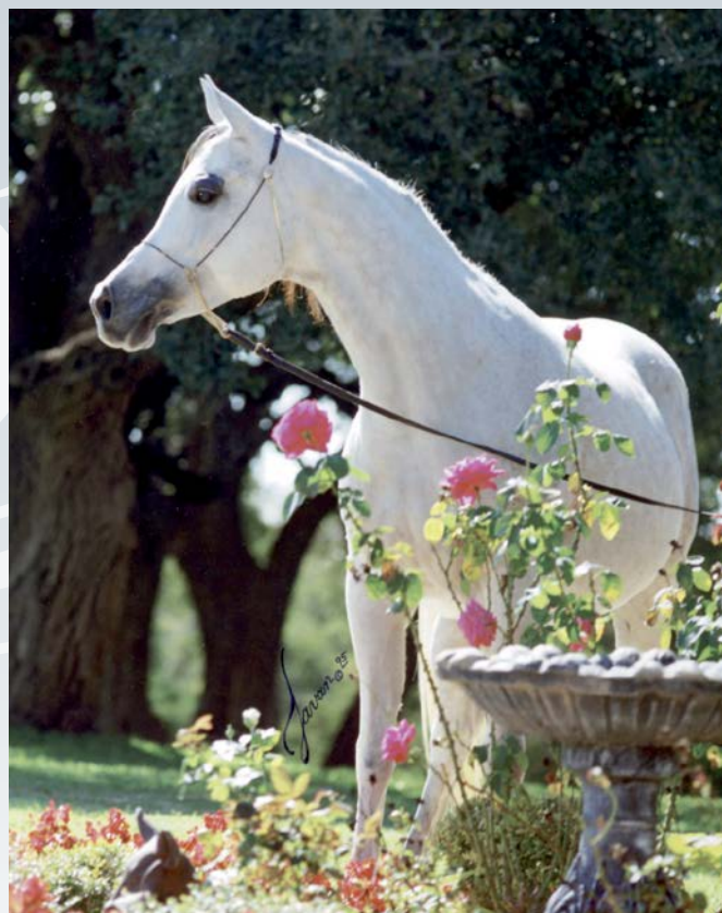
AK Amiri Asmarr 1985 grey mare (TheEgyptianPrince x Asmarr), dam of Thee Desperado. She is a class A Show winner and dam of champions Thee Desperado and La Marsala [full sister to Thee Desperado].