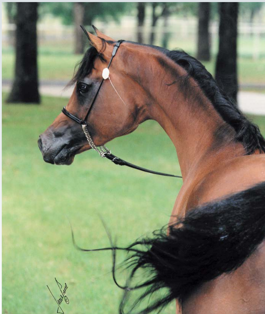
The Infidel 1995 bay stallion (x Bint Magidaa)