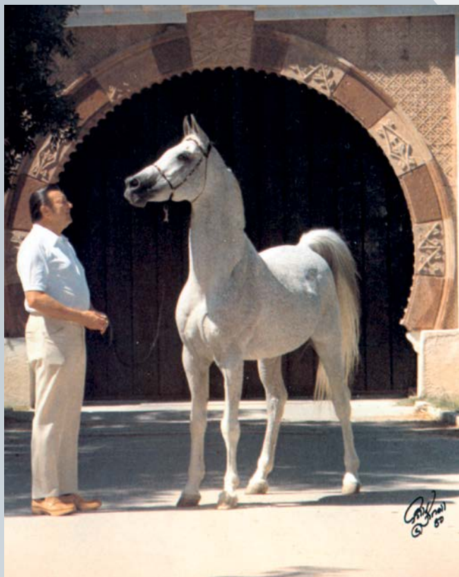
Zaghloul 1963 grey stallion (Gassir x Gharbawia) imported to the U.S. in 1970, he one of the outcross elements in Thee Desperado's pedigree being without Nazeer or Moniet El Nefous breeding. Shown here in old age at Gleannloch.