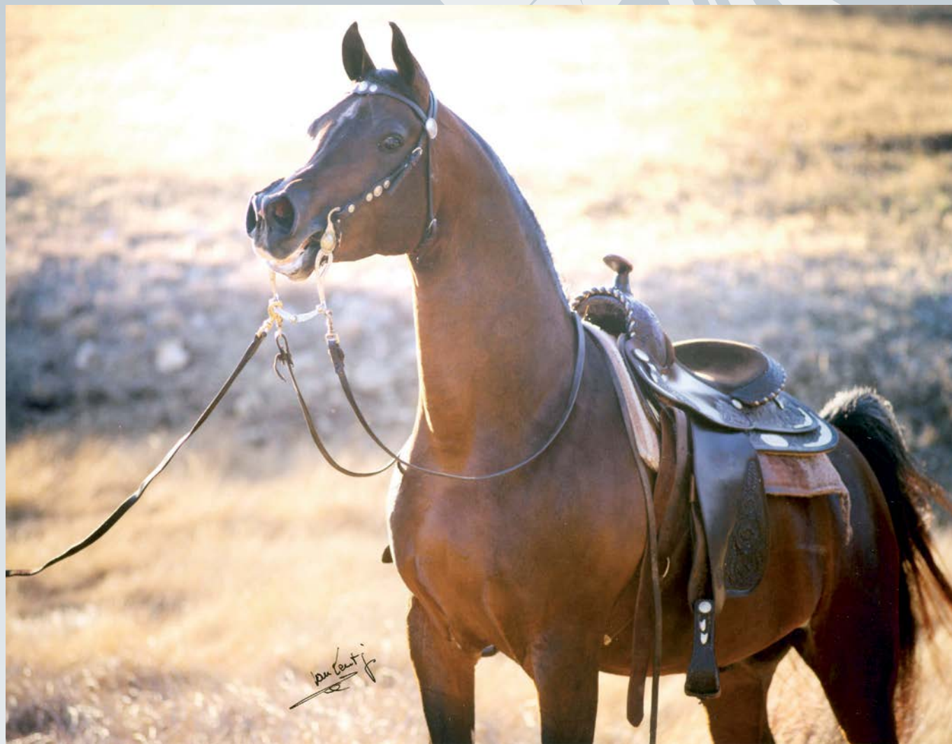
Thee Desperado 1989 bay stallion (The Minstril x AK Amiri Asmarr) with western saddle. Despite all the fanfare about him and his long halter-winning career, he enjoys being ridden around the farm.

very first foal being a maiden mare. On April 5, 1989 she produced a beautiful bay colt with the most uniformly perfect markings, balanced proportions and overall excellent quality. But that did not impress AK Amiri Asmarr one bit because she wanted nothing to do with motherhood and did not want this little bay colt anywhere near her. However the boldness of this youngster was to foretell of a “Desperado” who would make a name for himself no matter what his mother thought.