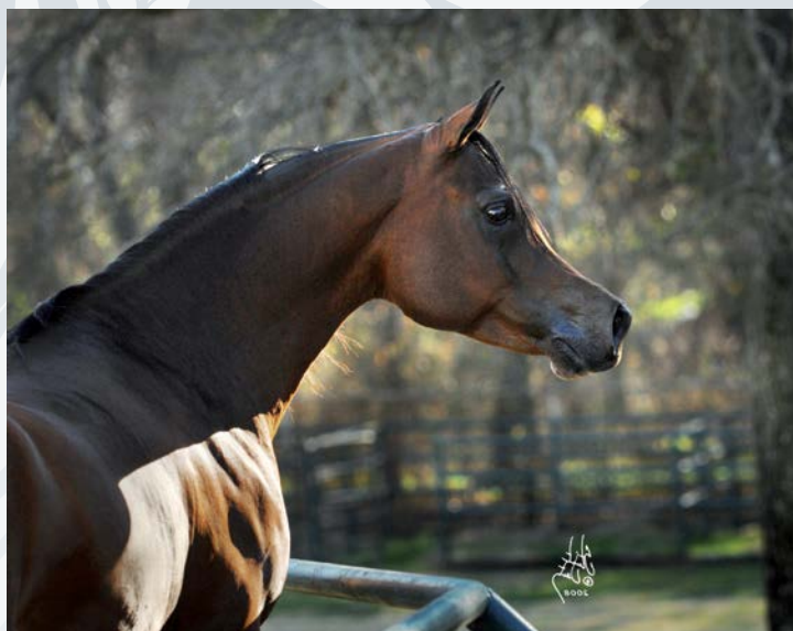
The Sequel RCA 2001 bay stallion (x La Marsala )