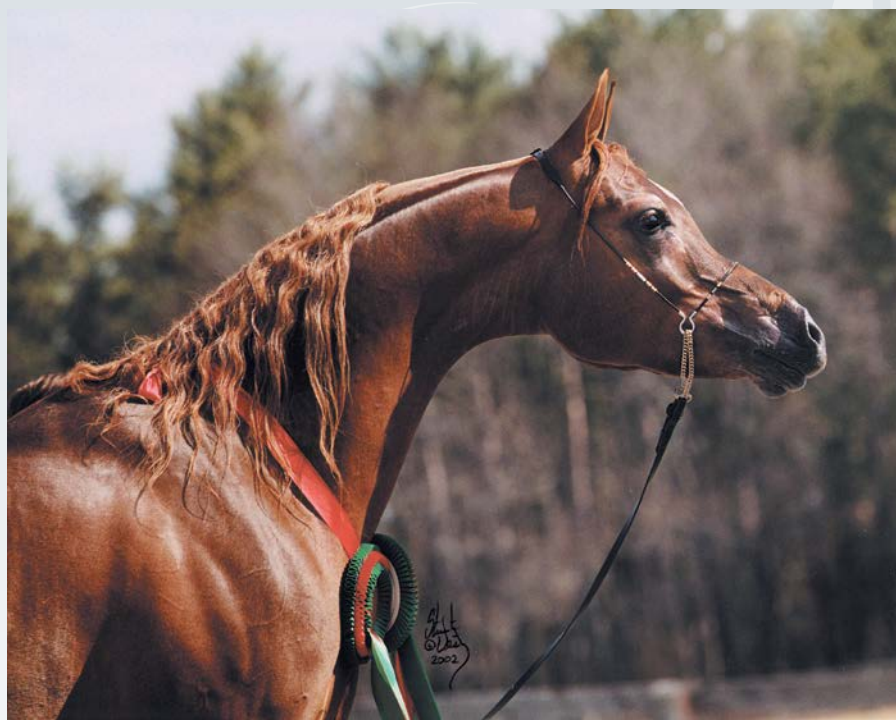
True Colours 1997 chestnut stallion (x Dabeda)

This amalgam produced a very handsome kind of horse that is the total package for many admirers of the Arabian horse and obviously he has attracted a lot of attention. To see him in person, even now at age 20 there is a