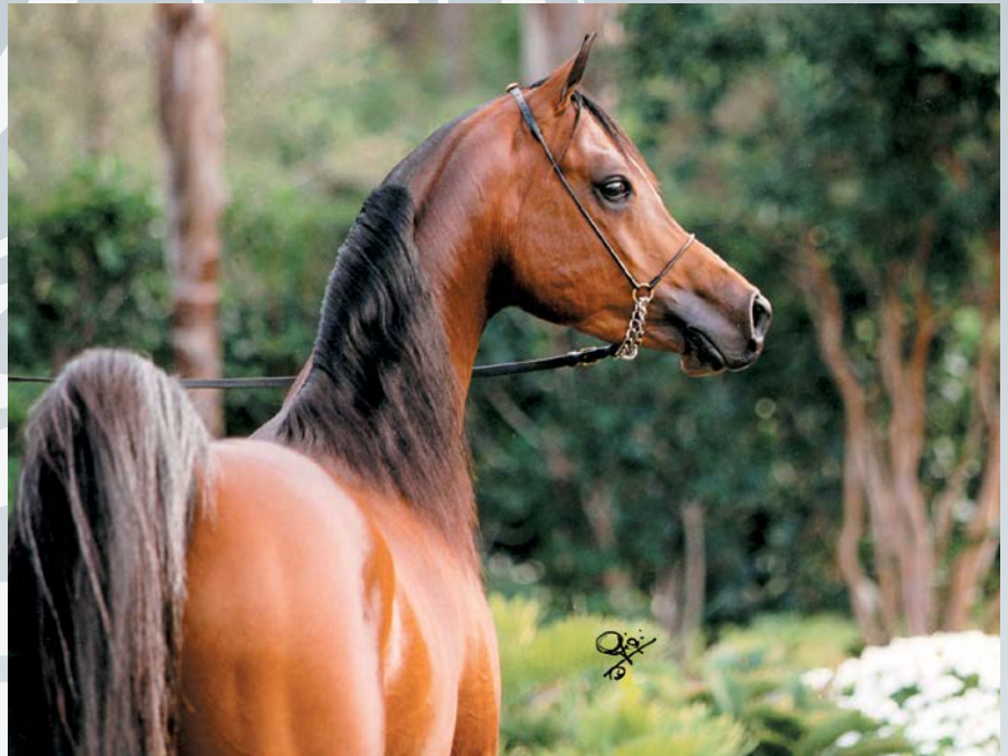
BB Thee Renegade 1994 bay stallion (x PH Safina)