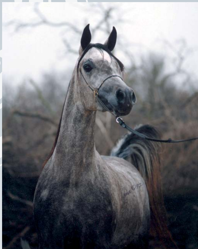
Deserree 1994 grey mare (x PH Maroufina)