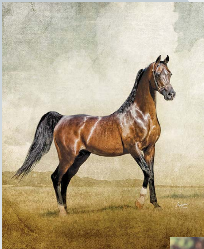
A beautiful paint of the Thee Desperado

the leading sire of winners at the U.S. Egyptian Event. Even though he has been promoted heavily within the straight Egyptian community, he also attracted Arabian mares of other bloodlines. Aside from his many get in the U.S. and Canada, his get are now found worldwide with exports to the following countries: England, Belgium, Netherlands, Switzerland, France, Germany, Israel, Egypt, Saudi Arabia, Qatar, The Emirates, Venezuela and Ecuador.