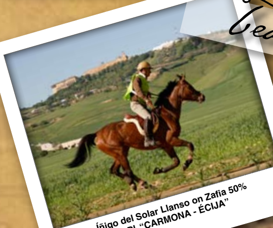
Íñigo del Solar Llanso on Zafía 50% 2. Pl. "CARMONA - ÉCIJA"