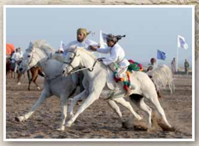
WAHO-Race in the desert of Oman.

Part of this promotion is a particular emphasis on fields in