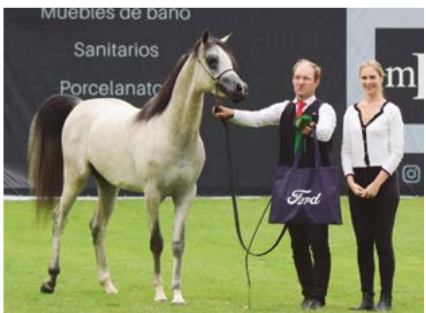
Bronze Colt Puquelahue Adele (HSA Maktub x Annaa) from Haras Puquelahue