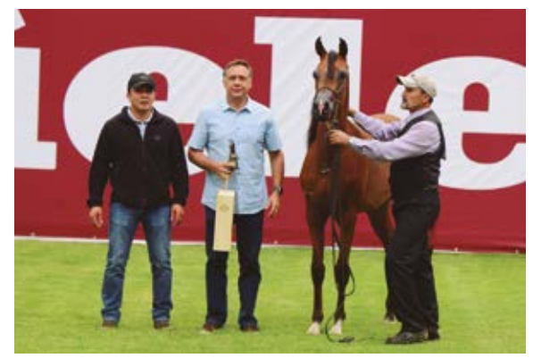
Silver Mare HHC Ali-Ma (El Maroc x HHC Lady K) from Haras Hacienda Chada