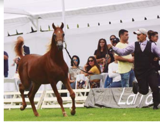
Gold Colt HHC Lazaro (HP Shahmaan x HSA Maja) from Haras Hacienda Chada