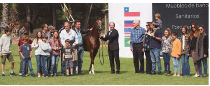
Silver National Yearling Colt, HP Habib from Haras Panguehue of Bulnes Family