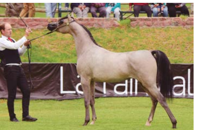
Gold Mare, MG Artemisa (HP Shakyr x MG Shatilda) from Haras Montegrande