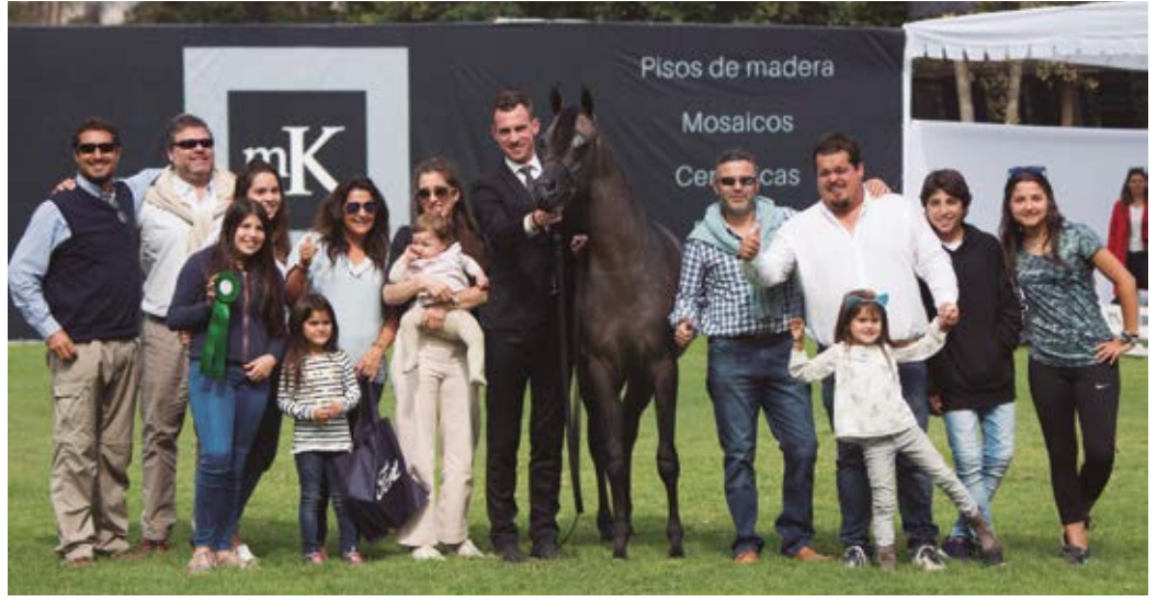
Silver National Yearling Filly, HP Shariba from Haras Panquehue of Bulnes Family