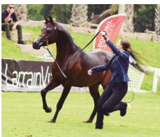
Gold Stalion, HS Oliver (HP Shaazan x HP Ethania) from Haras Shangrila