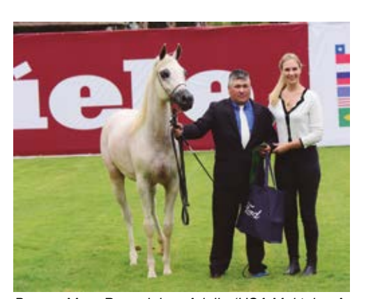
Bronze Mare Puquelahue Adelle (HSA Maktub x Anna) from Haras Puquelahue