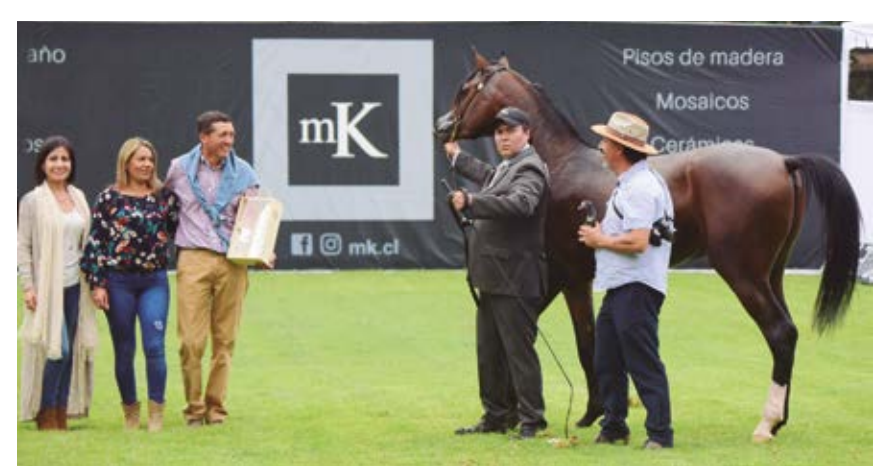
Silver Colt Jerusalem (HP Barham x HP Mouna) from Haras Jama and Haras San Antonio