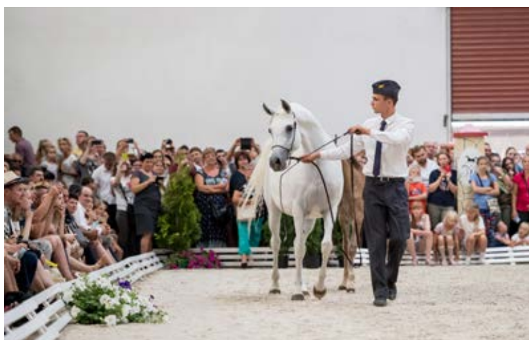
GANDAHARA WITH 2017 FILLY GRANDEZZA