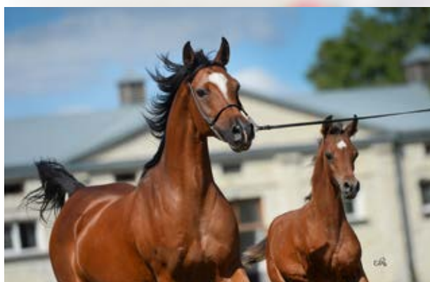
PARILLA WITH 2017 COLT PARILLUS