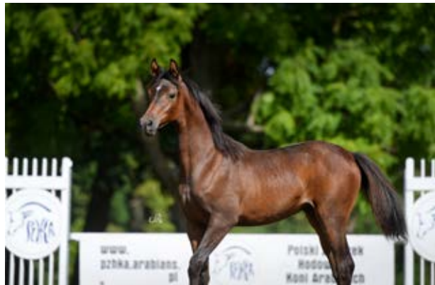
2017 FILLY PERMARINA