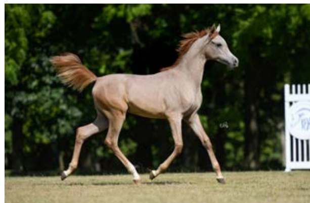
2017 FILLY EMANITIA