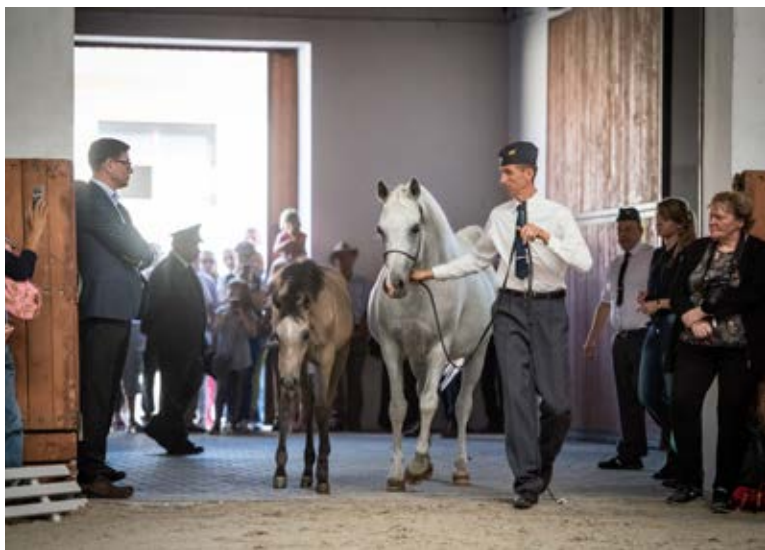
GOLTERIA WITH 2017 FILLY GOLTERIANA