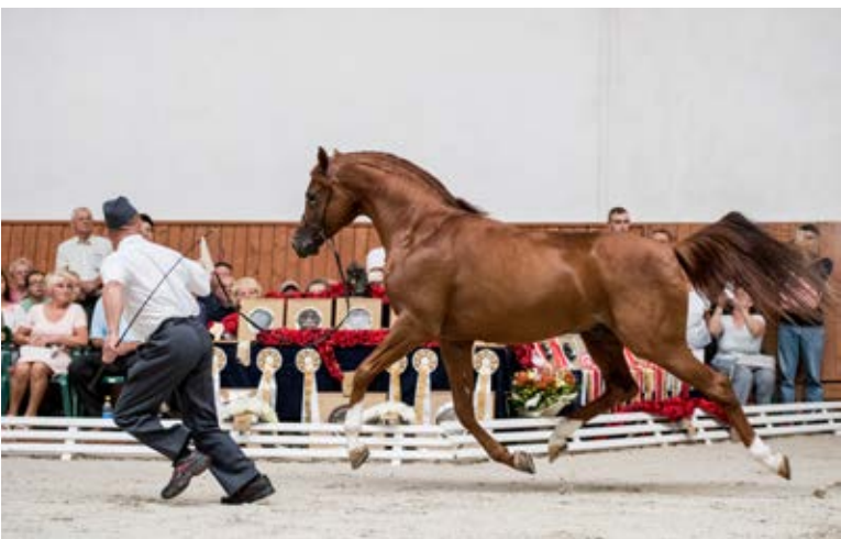
EL OMARI