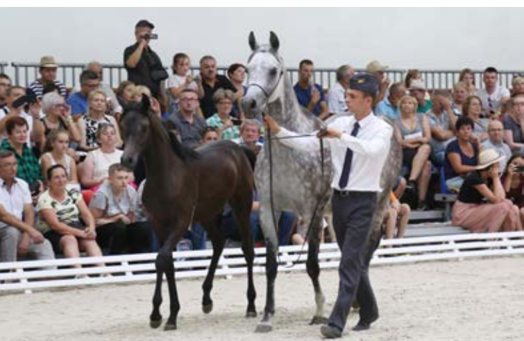
KAROLA WITH 2017 FILLY KALDERA