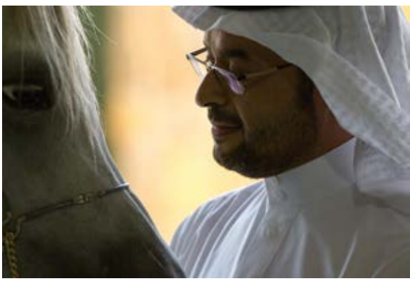
Sh. Khalid bin Hassan Al Gahtani

governing body for Arabian horse competitions in the Kingdom as well as its registration authority. Our shows are sanctioned by the European Conference of Arab Horse Organizations (ECAHO) and will feature international judges. With the large number of horses in the Kingdom, we expect entries to be high and competition will be keen.