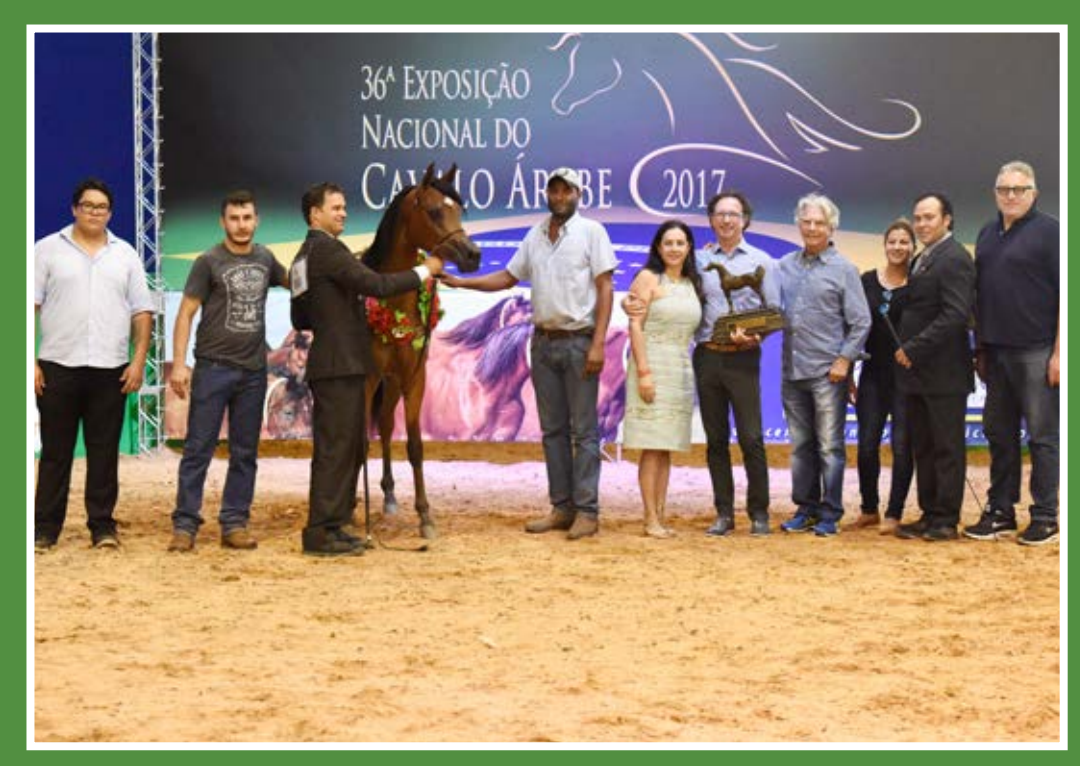
Gold National Champion Young Filly Sophie ELS