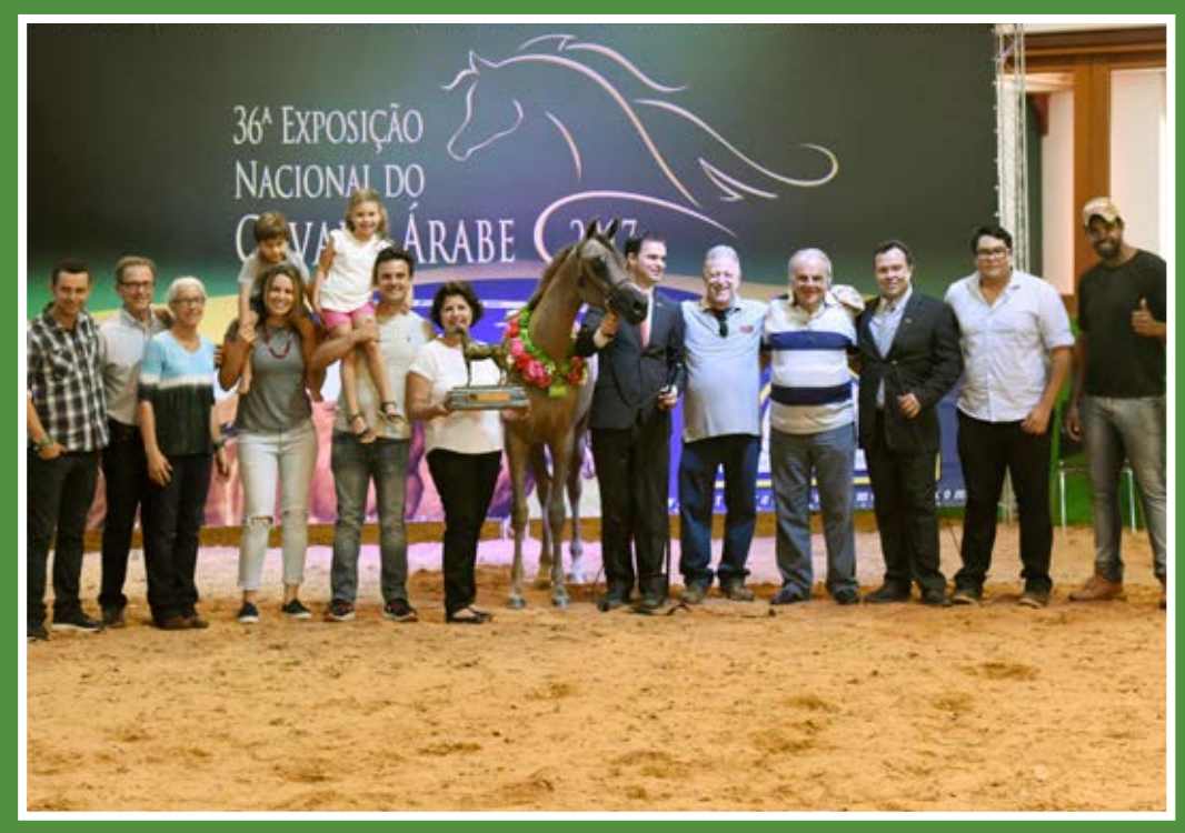
Gold National Champion Jr. Filly RFI Sawari