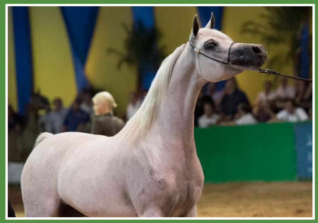
Gold National Champion Mare Baviera HVP