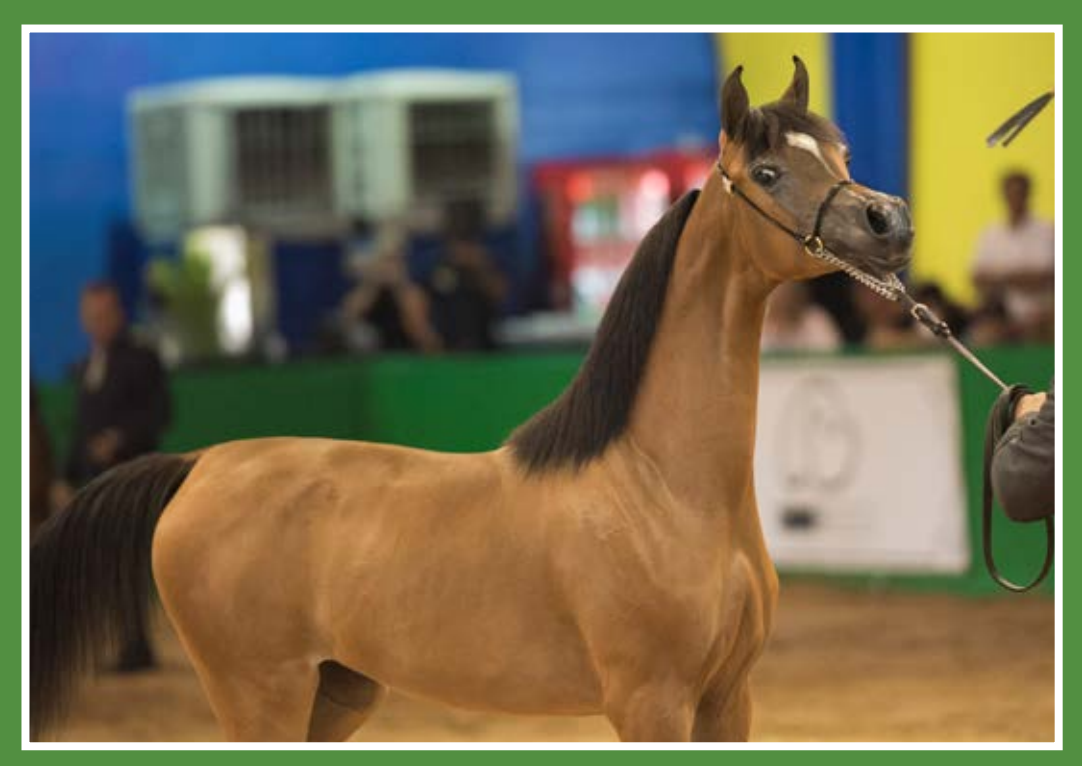
Gold National Champion Jr. Jr. Filly Rhadashah Arabco