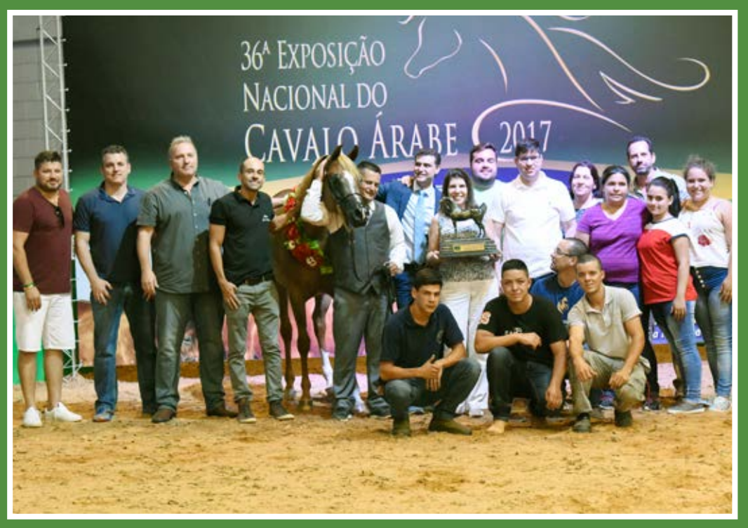
Gold National Champion Filly HDF Munique