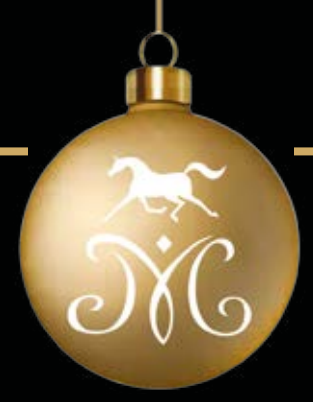
Stadnina Koni Michałów