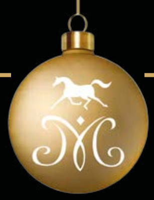
Stadnina Koni Michałów

– Equator, who closed the show. Even on such a small arena that the horses and handlers had at their disposal Equator proved that he does not lack charisma and that the title of World Senior Silver Champion Stallion that he brought from Paris was well deserved. The two year lease did not take a toll on his form – on the contrary, the lessee (Aljassimya Farm) took excellent care of the stallion, who was full of energy as a young stallion should be.