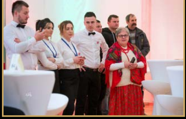
right to let her go. As we remember during the 2017 Pride of Poland Sale there was an offer for 50 thousand Euro and the mare returned to the stable.

ride of energetic stablemates, spend their time surrounded by great nd the care. Zagrobla paid thanks this year with a Polish National Senior Reserve Champion Mare title.