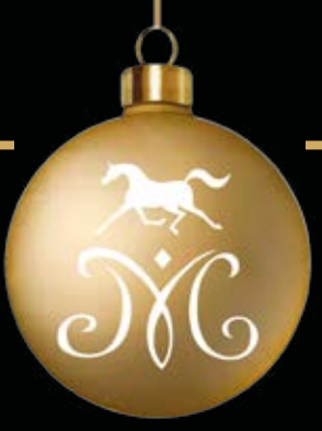
Stadnina Koni Michałów