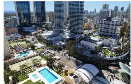
'Beautiful City of 'Gold Coast Queensland'