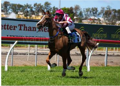
'Reid River R-Mani'