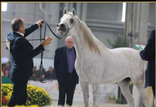
ASMA BY GHALIYA TOP FIVE YEARLING COLTS SHANGHAI EA | GHALIYA B/O: IERVOLINO GIANLUCA