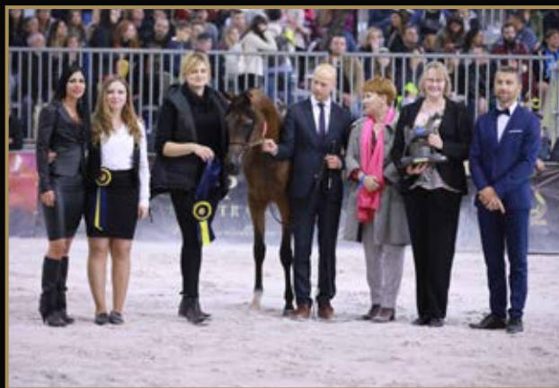
WADELIA TOP FIVE YEARLING FILLIES POGROM | WROZKA B/O: LUTETIA ARABIANS