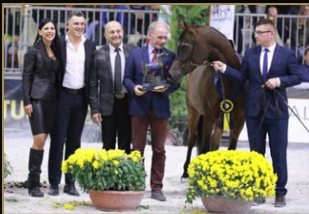
BAMBINA TOP FIVE JUNIOR FILLIES KAHIL AL SHAQAB | BELLISA B/O: STADNINA KONI JANOW PODLASKI