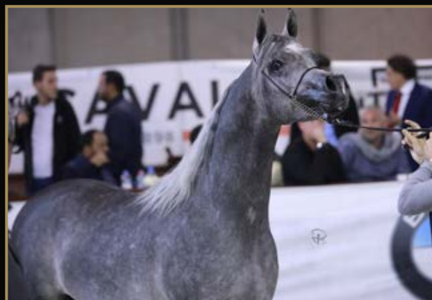
IZAN AL CAPE TOP FIVE JUNIOR COLTS SHANGHAI EA | WIOLETTA EA B/O: AL CAPE ARABIANS