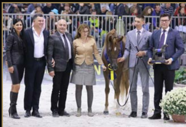
EMANOLLA TOP FIVE JUNIOR FILLIES VITORIO TO | EMANDORIA B/O: STADNINA KONI MICHALOW