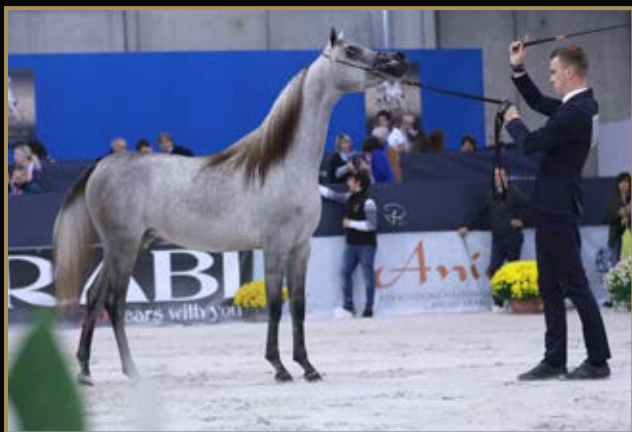
SHEIKHA AL JUMAN TOP FIVE YEARLING FILLIES RFI FARID | PF PANAMA B: BM ARABIANS STUD - O: AL JUMAN STUD