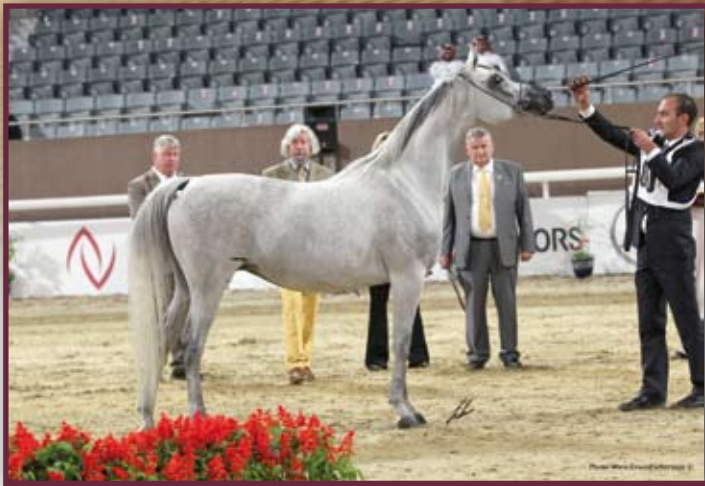
REMAL AL NASSER OWNER: AL NASSER STUD, QATAR TOP FIVE MARES