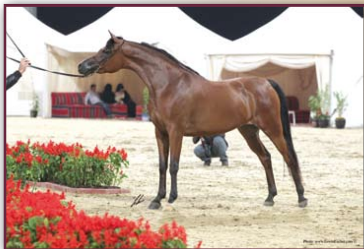
MARYAH OS OWNER: ROYAL CAVALRY, OMAN