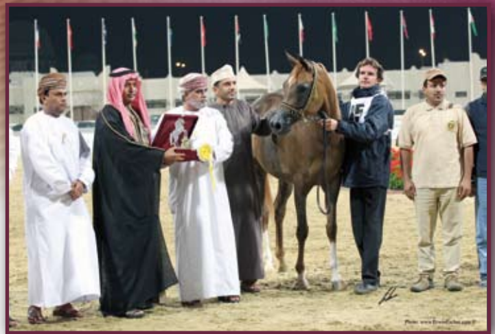
ABA PSYNNAMON OWNER: ROYAL CAVALRY, OMAN TOP FIVE MARES