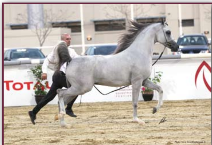
DIRAR AL SHAQAB OWNER: AL SHAQAB, QATAR