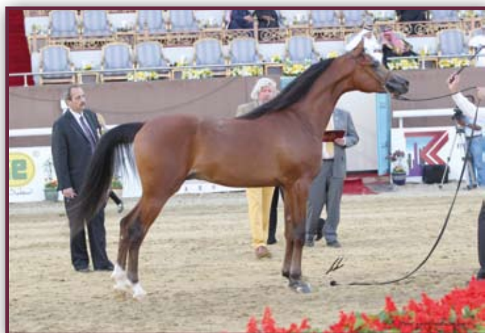
SAIAF AL SHAQAB OWNER: AL SHAQAB, QATAR