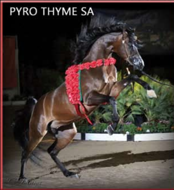
PYRO THYME SA