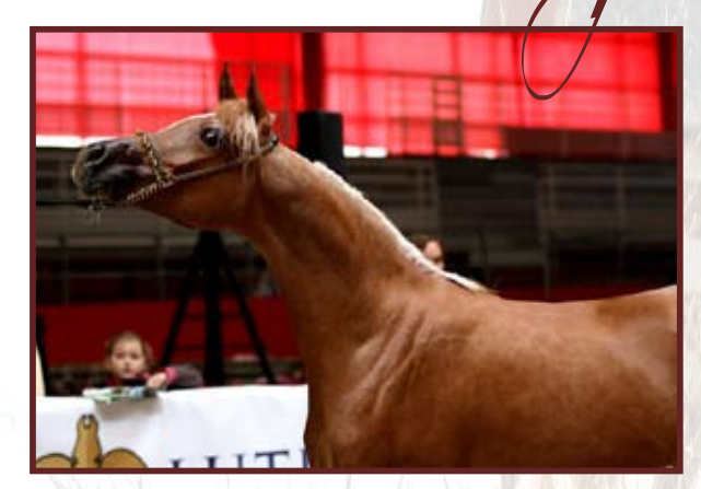
Junior Fillies & Best in Show