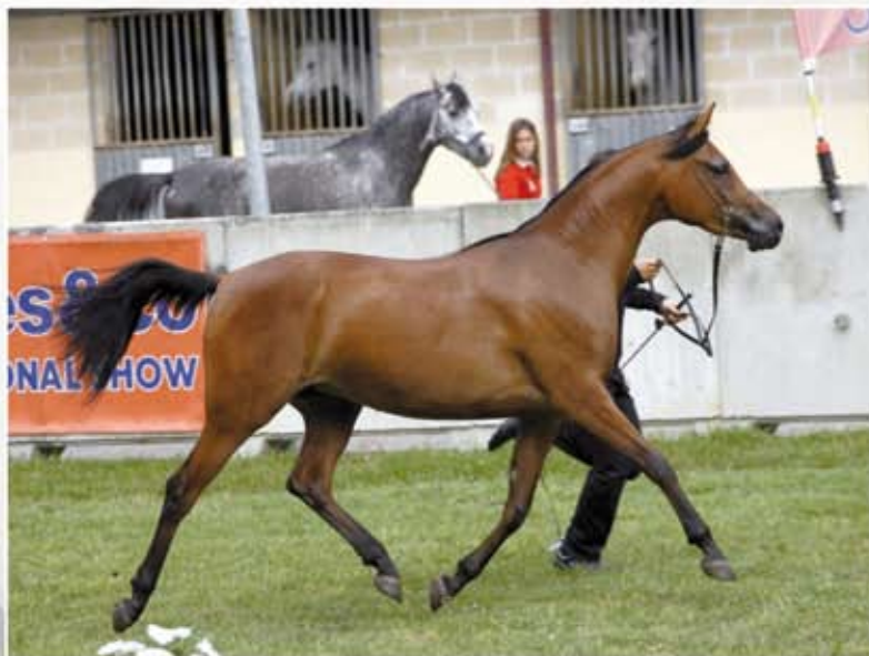
Reserve Champion Filly ADOS-BAHIRA, owned by Ganaderia Laba.