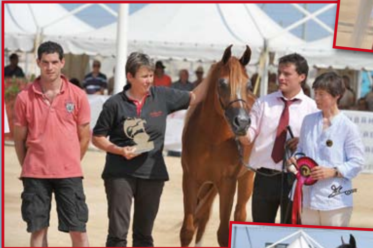
KINSHASA JA Prix ACA Association Française de Cheval Arabe