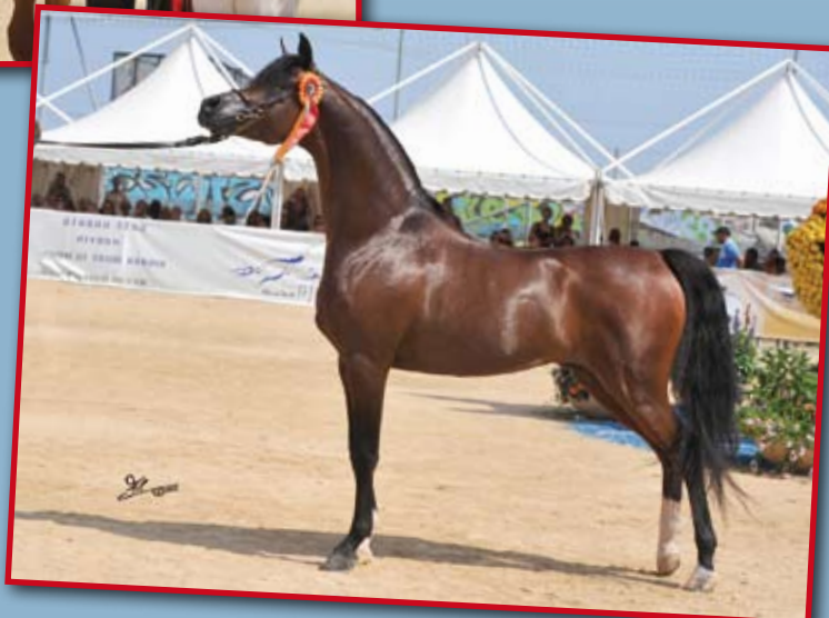
QR MARC Coup de Coeur VIP