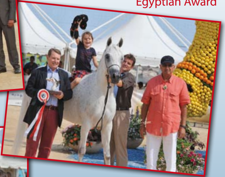
DORAR Egyptian Award