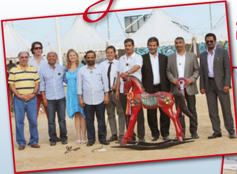
AL SHAQAB STUD Best Breeder&Owner