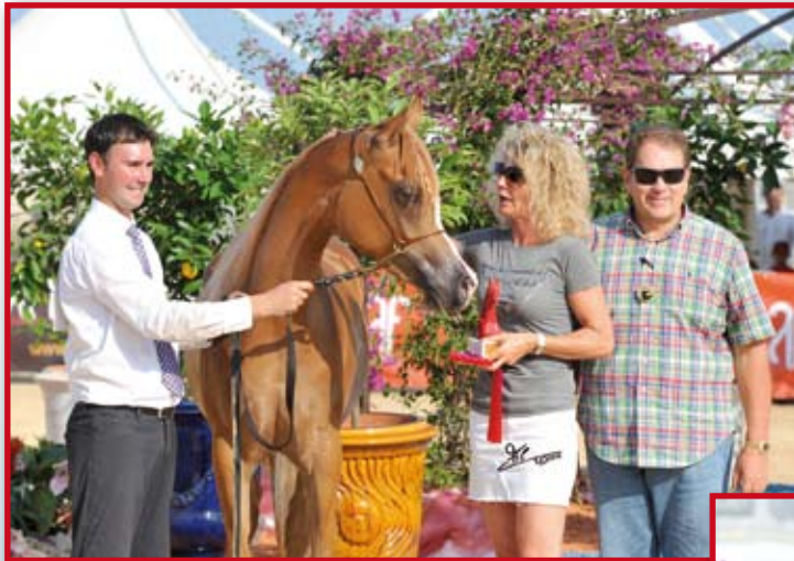
LB GUCCI Most Beautiful Head Class 2B - Fillies 2 years old