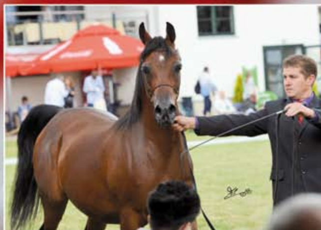
Lot 18 - ESPINEZJA (Psytadel x Entaga/Ganges) Falborek Stud

Sold for 50.000 EUR - to Dr.Tarig Enaya Kingdom of Saudi Arabia