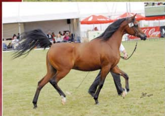
Lot 3 - EJRENE (Gazal Al Shaqab x Emocja/Monogramm) Michałow Stud

Sold for 440.000 EUR - to Ajman Stud, HH Sheikh Ammar Bin Humaid Al Nuaimi (UAE)