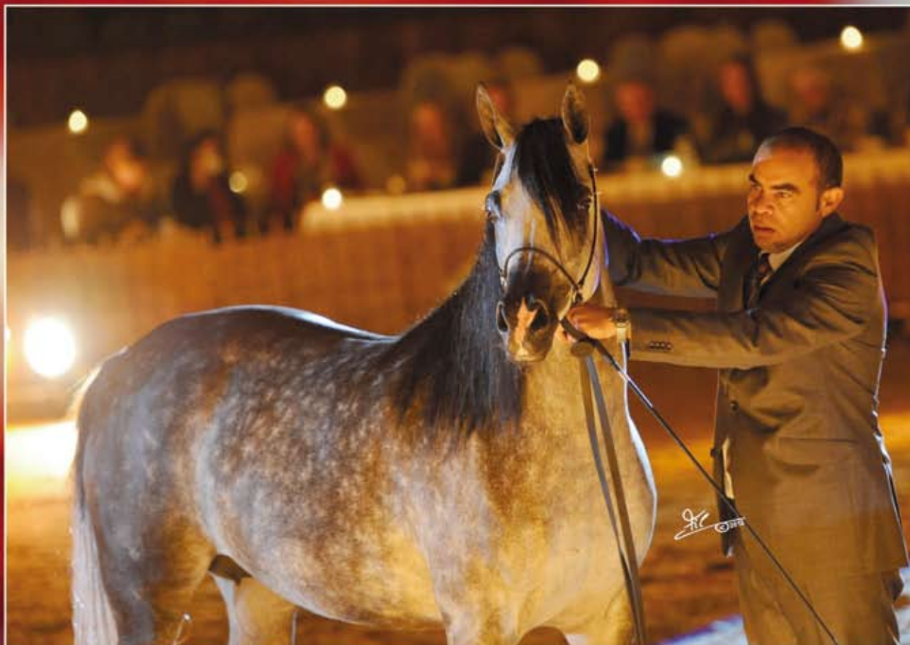
Lot 12 - BIRUTA (Ekstern x Bajada/Pamir) Janów Podlaski Stud

Sold for 100.000 EUR to Halsdon Arabians (UK)