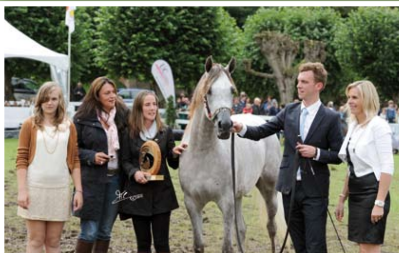
1 place Liberty Class: Khimara