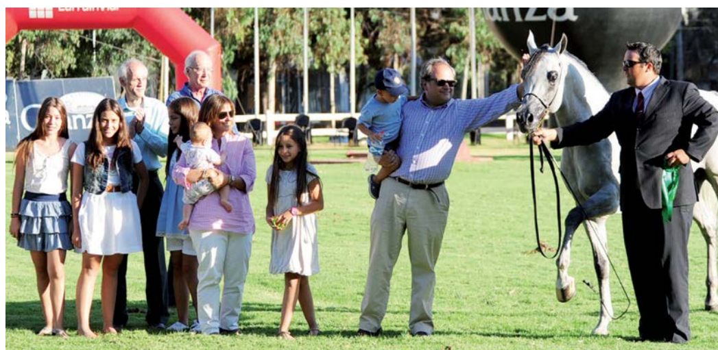
3 rd place Stallion HP Majeed - Haras Aguas Claras and Panquehue