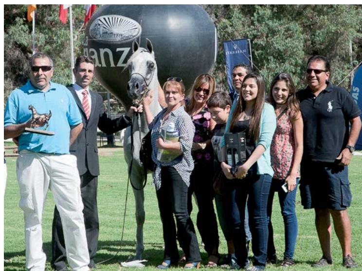
Grand Champion Filly Mayor and Best Classical Head, Alborada Fuad - Haras Shangrila