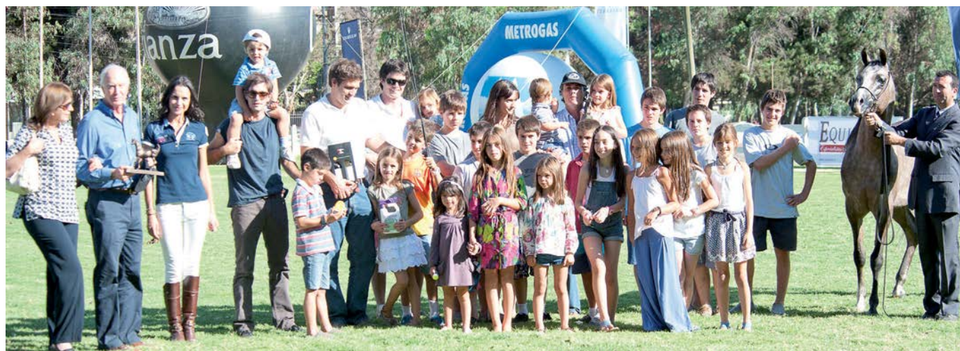
Grand Champion Jr. Colt, HP Shakir, from Haras Panquehue

In these two classes, the Grand Champion Minor Filly was Alborada Anabel daughter of the new sire Alborada Eros by ST Synbad in a daughter of Sandik El Shaklan called Alborada Katanga and the Reserve Champion Minor Colt was HP Sharav by Johann El Jamaal and Alborada Princesa by Jasper El Jamaal and the 3 rd place went to HP Kassab by Hafati Express and LC Granúa by Palissade, both belonging to the Bulnes family.