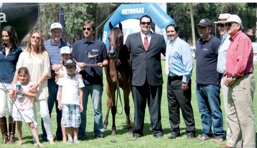
Grand Champion Female, HP Valeria - Haras Llançay