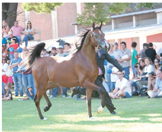
3 rd place Filly Mayor HP Anita - Haras El Taihuén de Pirque and Panquehue