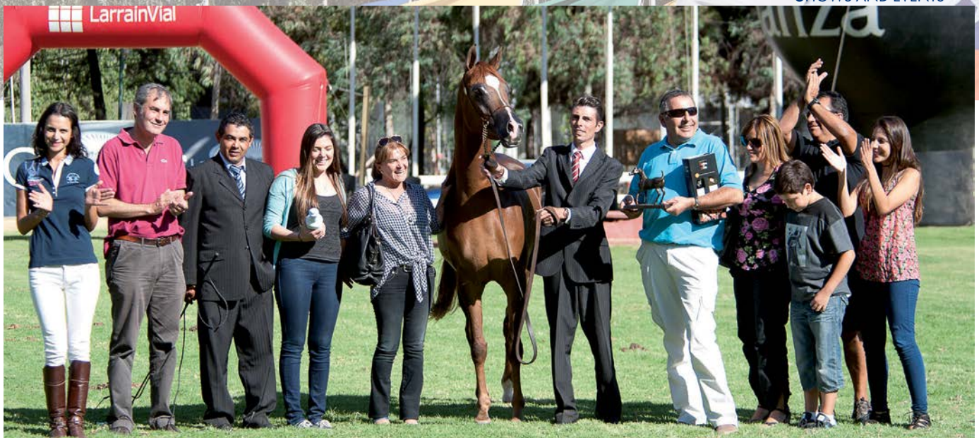
Grand Champion Jr. Filly, HP Ambrosia II, from Haras Shangrila