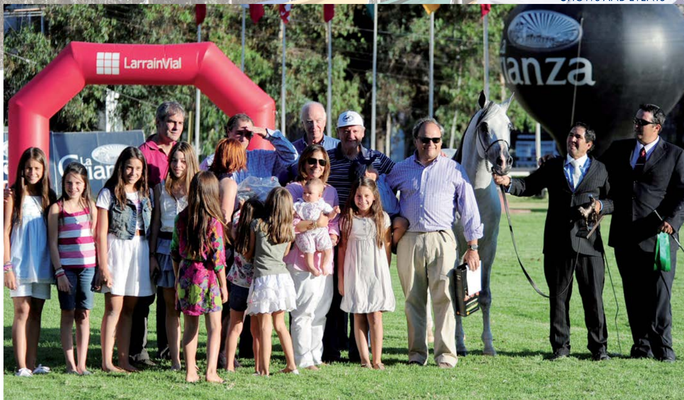
Grand Champion Stallion ZT Kishak - Haras Panquehue