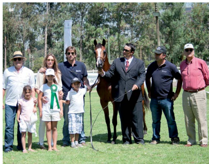
3 rd place Filly HP Fadua - Haras Llancay