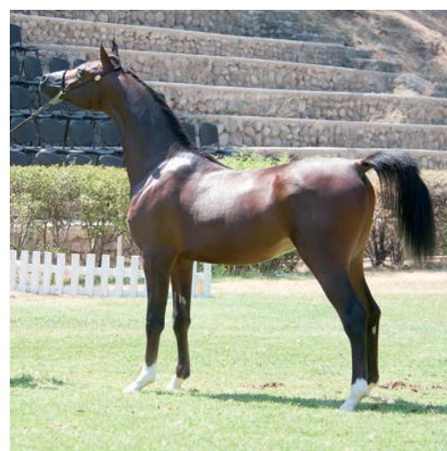
3 rd place Minor Colt HP Kassab - Haras Panquehue