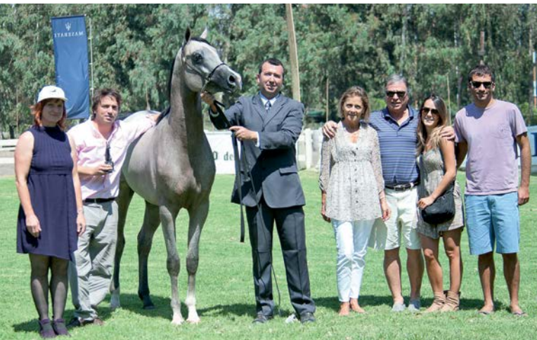
Reserve Grand Champion Male, El Palenque Mufasa - Haras El Palenque

At Chile Cup only Chilean horses participate. It is a way that the Chilean Association found to promote the country's product. The results are: