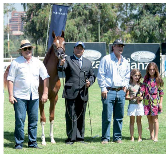
Reserve Champion Filly HP La Joya - Haras El Taihuén de Pirque and Panquehue