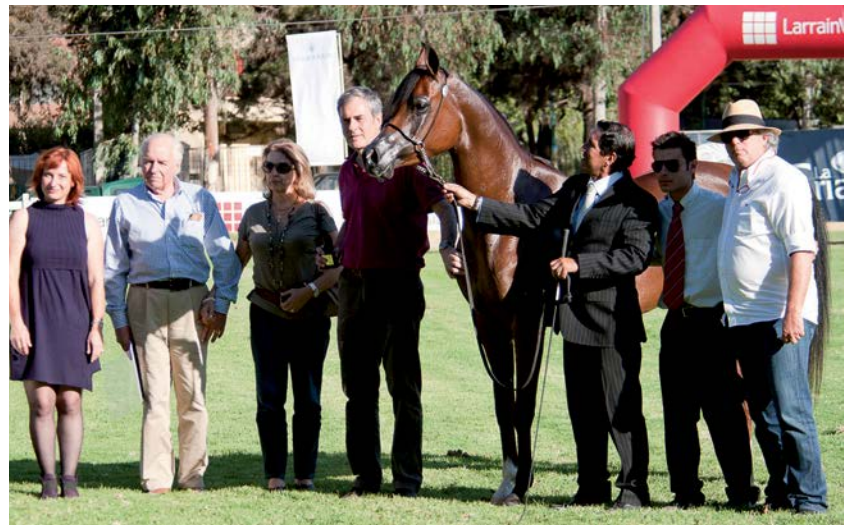
Reserve Champion Mare, SGV South Gipsy - Haras SanGreVal