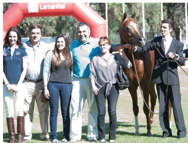
3 rd place Colt Mayor HP Shahmaan - Haras Shangrila