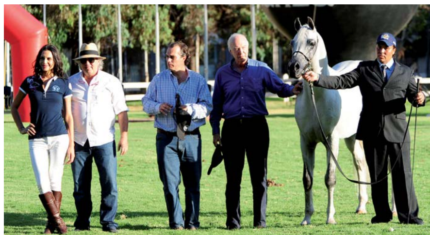
Reserve Champion Stallion HP Emir - Haras Panquehue