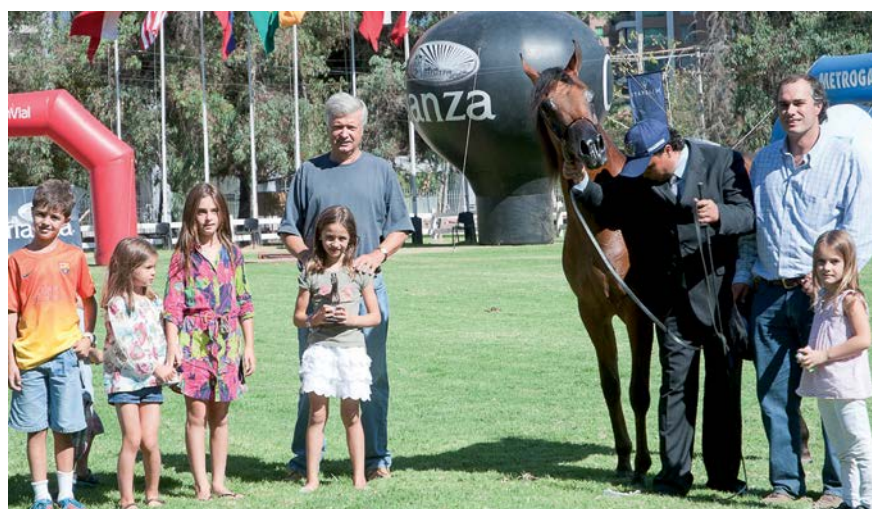
Reserve Champion Filly Mayor HP Shaella - Haras Panquehue