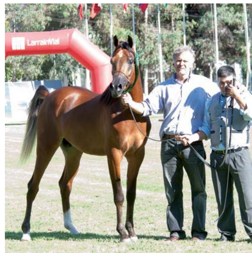
3 rd place Jr Colt, Panquelahue Don Omar, from Haras Panquelahue