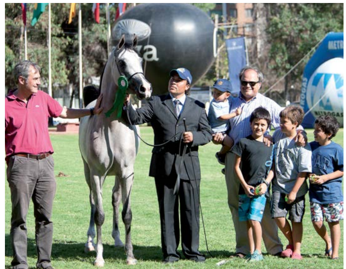
3 rd place Jr Filly, HP Angélica - Haras Aguas Claras and Panquehue