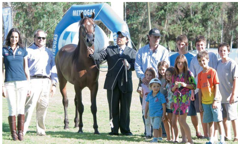
Reserve Champion Jr. Colt, HP Shael, from Haras Panquehue