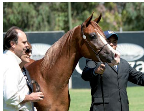
3 rd Place Female, HP Condessa - Haras El Monte