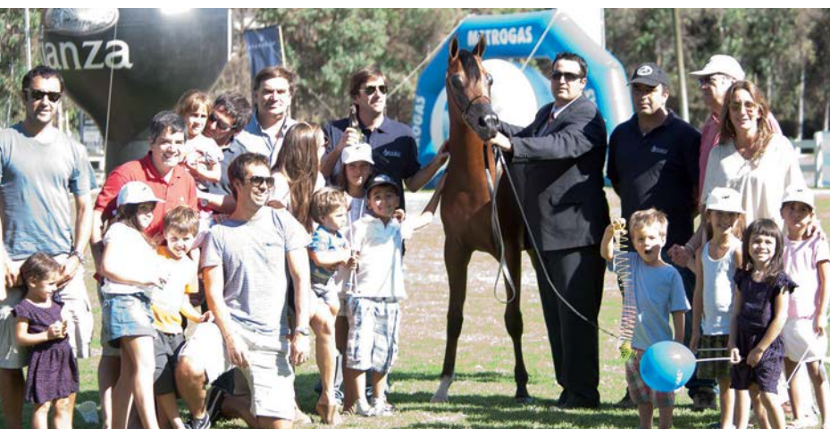
Reserve Champion Colt Mayor Llanca Sultán - Haras Llanca