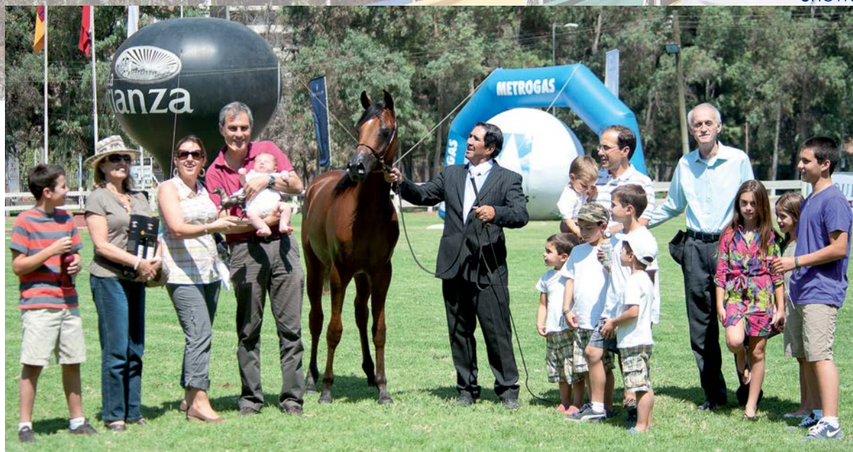
Grand Champion Colt SGV Kaweskar - Haras SanGreVal