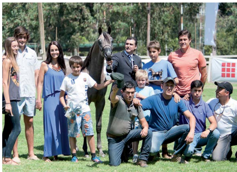
Grand Champion Minor Filly Alborada Anabel - Haras Alborada