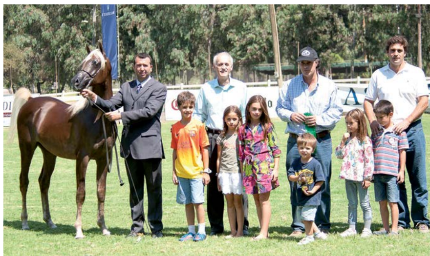
Reserve Champion Minor Colt HP Sharav - Haras Panquehue