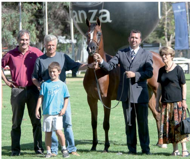
Reserve Champion Jr. Filly, Icalma, from Haras Quitralmán