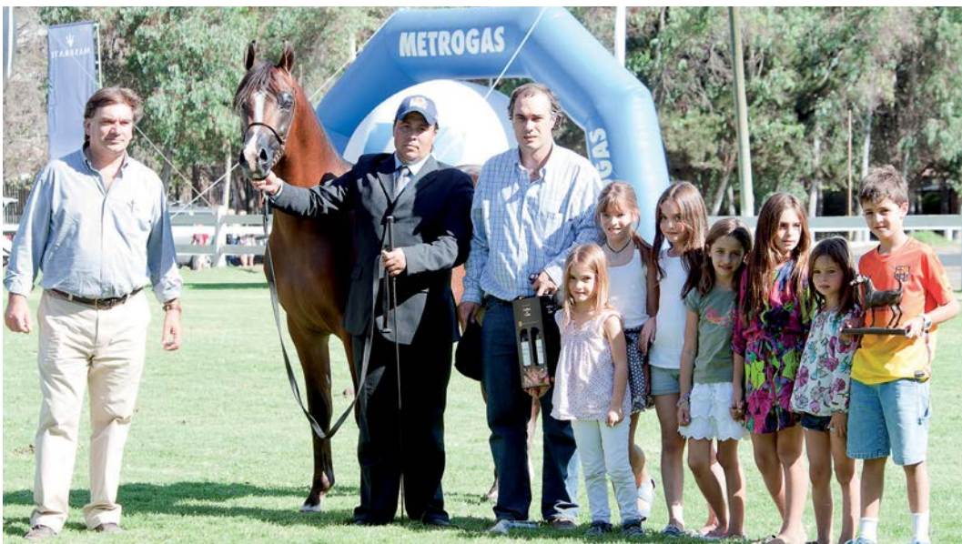
Grand Champion Colt Mayor HP Al Fayed - Haras Panquehue