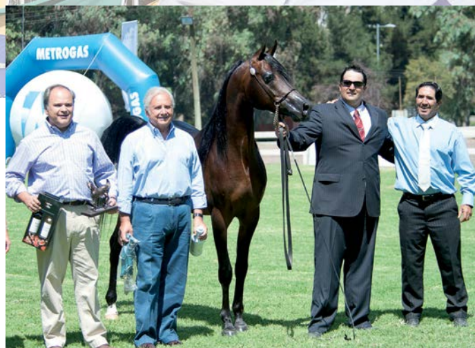
Grand Champion Male, HP Monarca - Haras Águas Claras