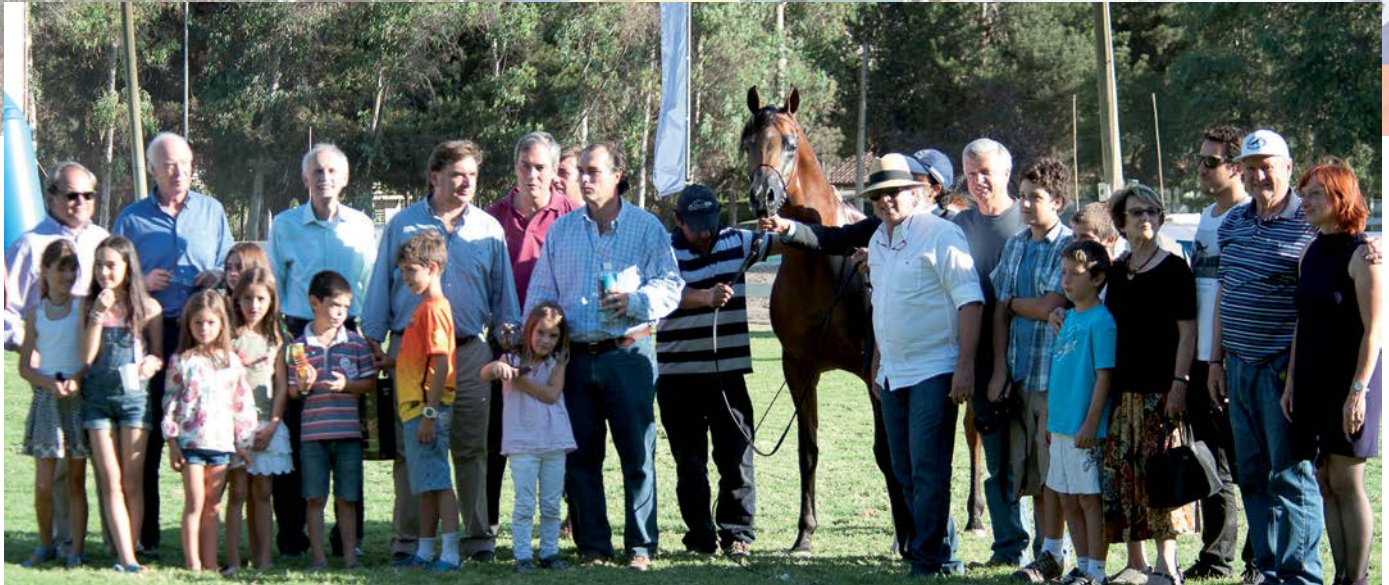
Grand Champion Mare, Brahma - Haras Quitralmán and Panquehue