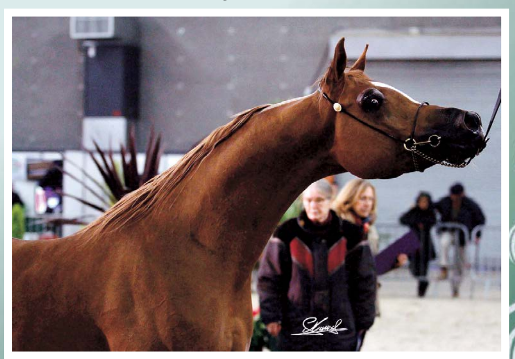
Bronze Medal Stallions