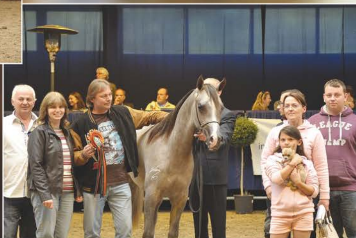
Bronze MS Alis Pasha (Ali Moniscione x HS Kiova)