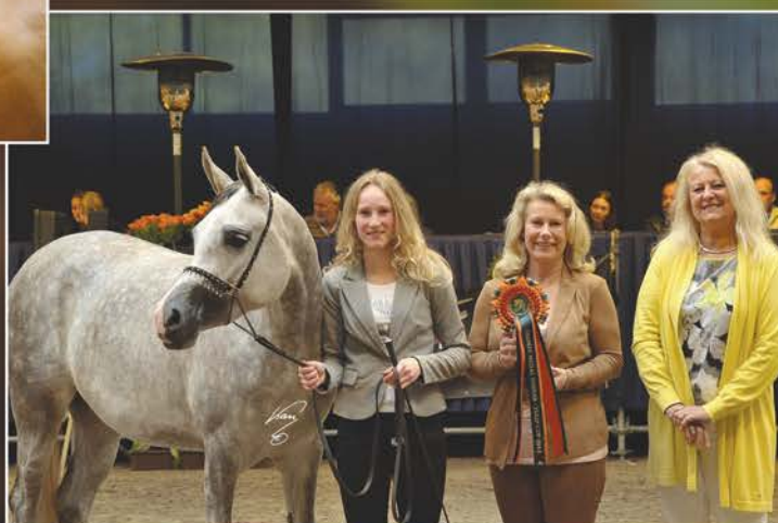
A Lady of Kossack (WH Justice x Abakana Kossack (Ster Elite))