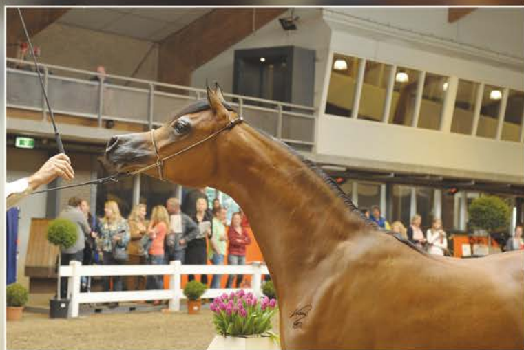
My Fair Rose-D (Marajj x WH Marissa Rose)