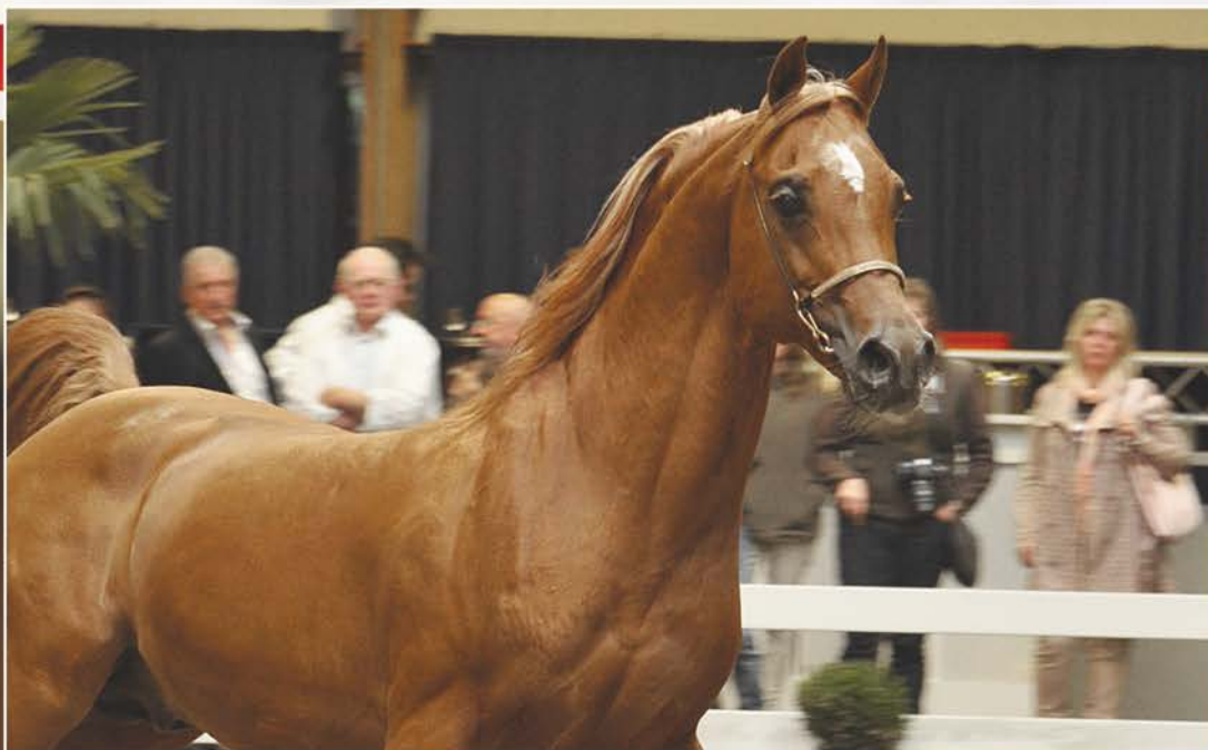
Gasir (Motamid x Braken (ES))