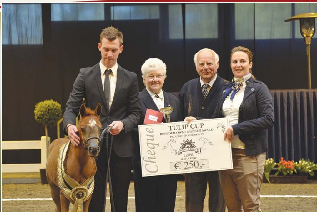
Forelock's Veronique (Psytadel x Vekaisa 'F')