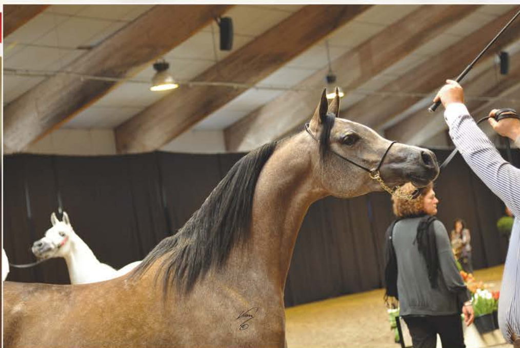
Perfinka (Esparto x Perfirka)