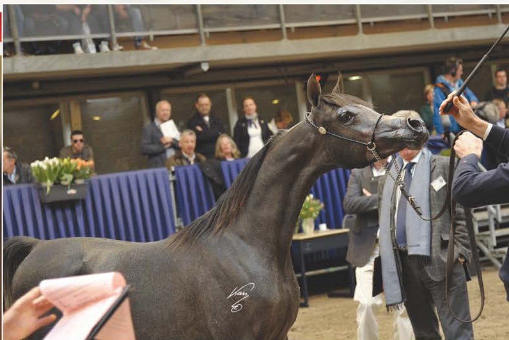
KAS Katara (WH Justice x Atheena)