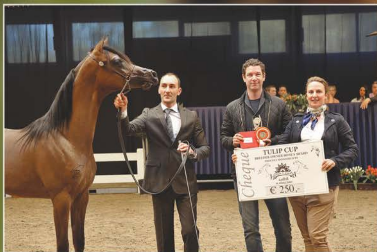
Silver Lammah Athbah (Aja Justified x Parmana)