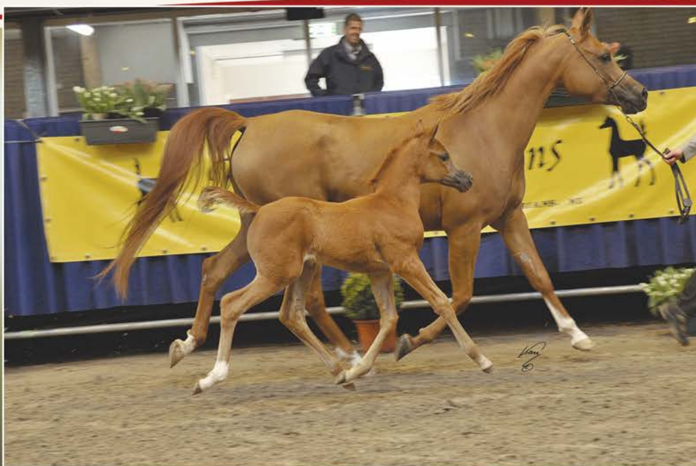
Forelock's Veronique (Psyttadel x Vekaisa 'F')