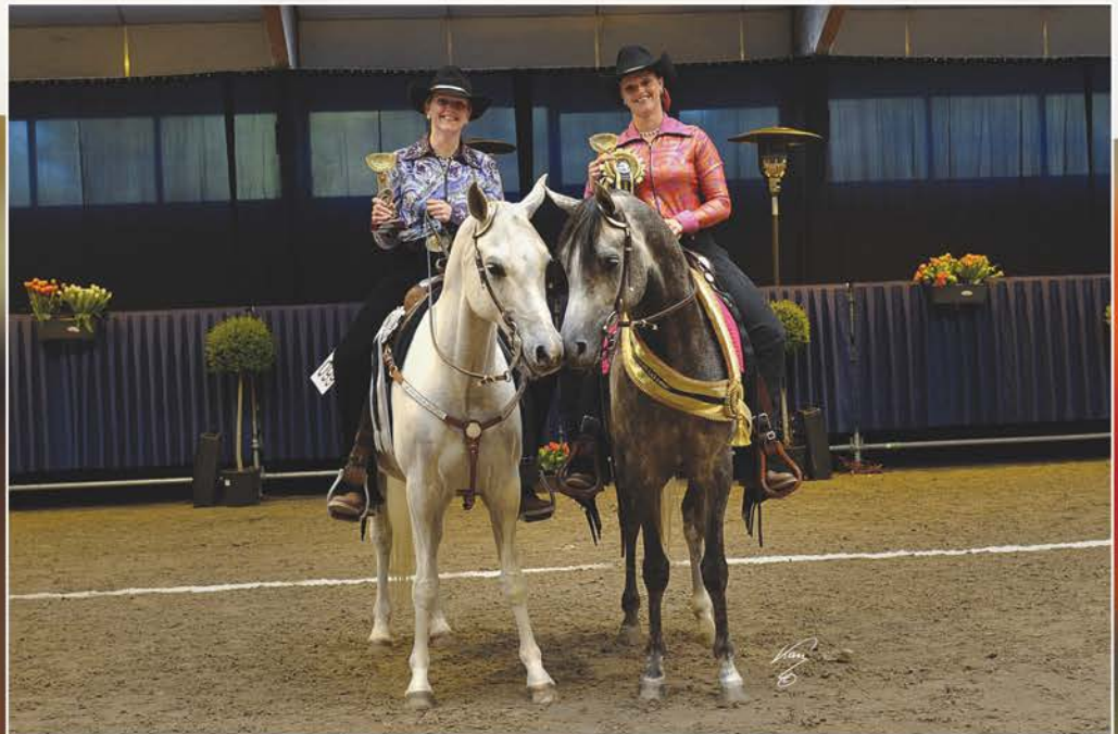
Erogant (WH Justice x Raville 'P' (Ster Keur))