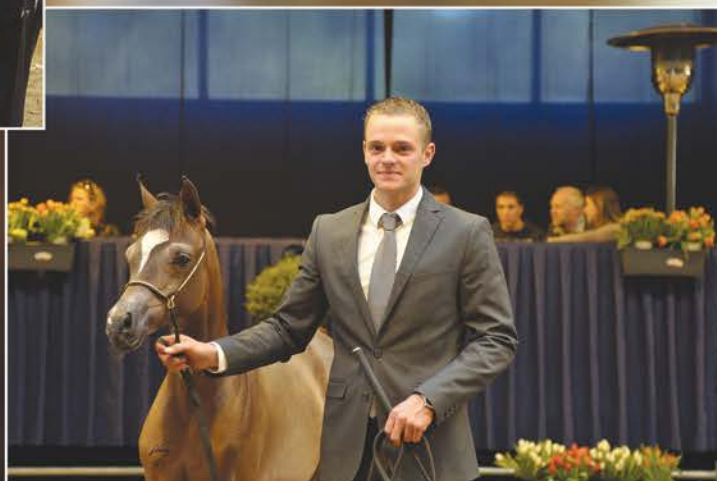
Enolah S (Masdar Moniscione x Aja Fantasia)