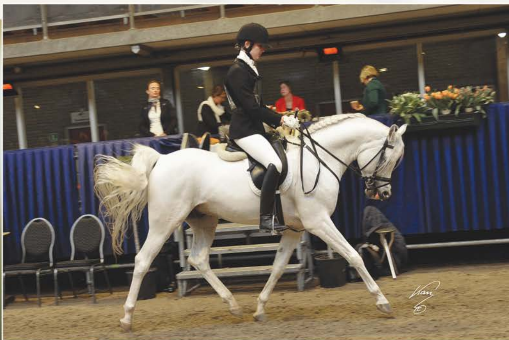
AR Fyyim (Valerio Ibn Eternity VI x Aicha SVA)