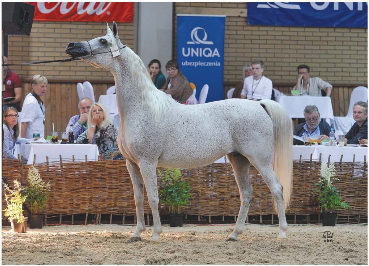
Ekspulsja (Gazal Al Shaqab (QA) x Elandra)