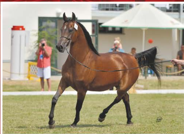
Dama Kier (Gazal Al Shaqab (QA) x Demona)