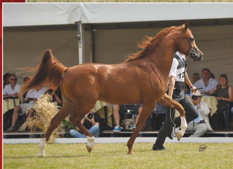
El Omari (Enzo (US) x Embra) Michałów Stud