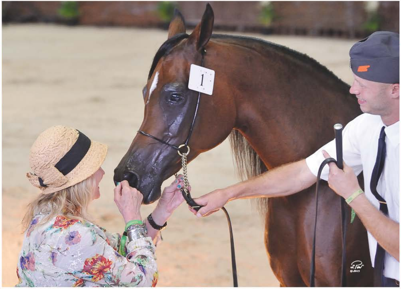
Belgica (Gazal Al Shaqab (QA) x Belladona)