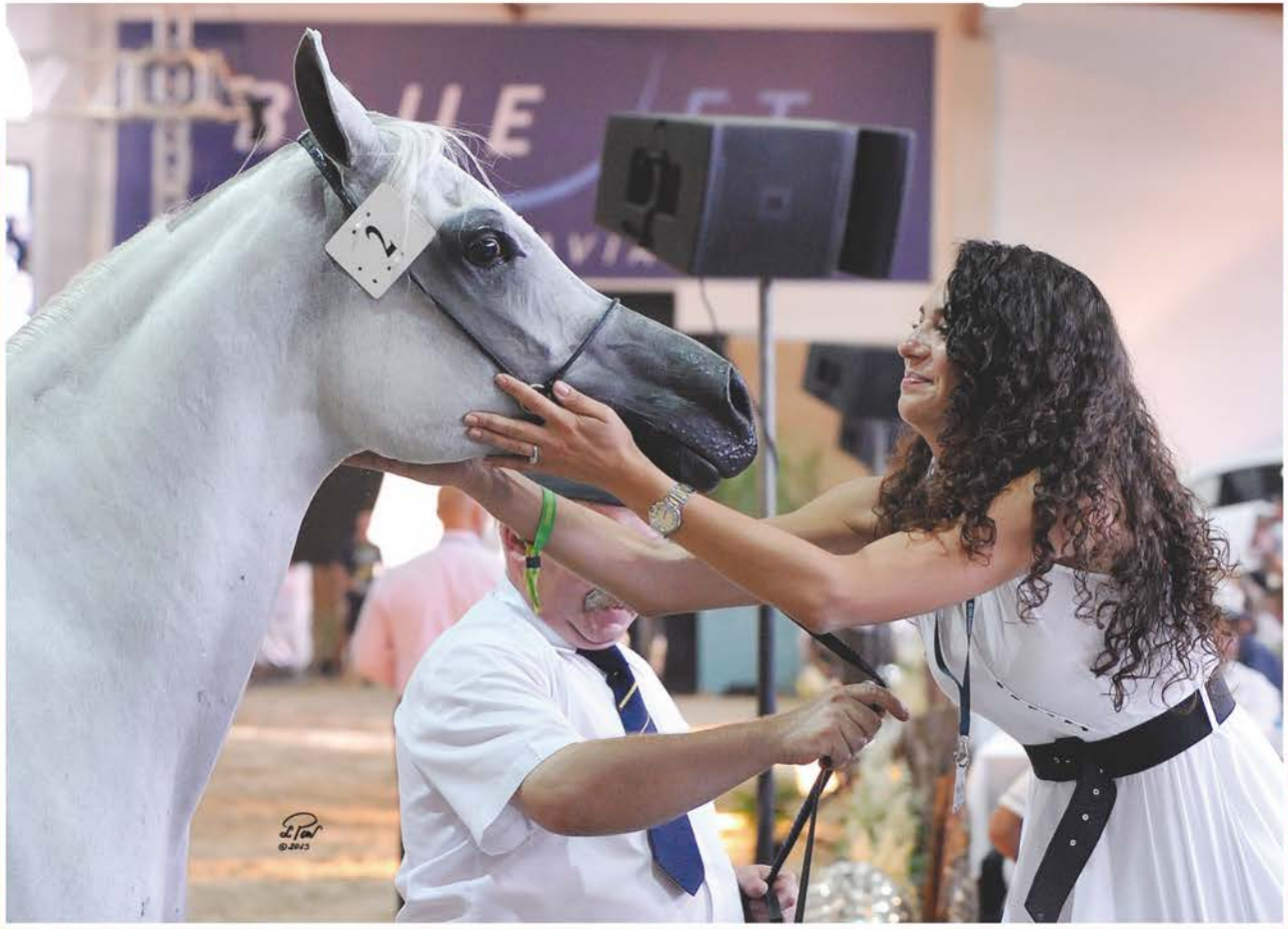
El Saghira (Galba (DE) x Emira)