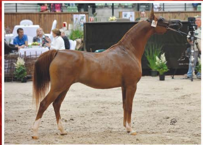
Krašnica (QR Marc (US) x Kasjopea)