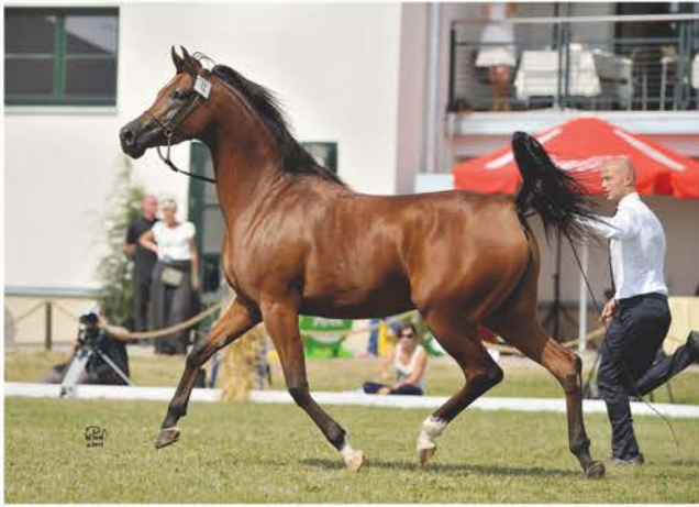
Pietra (Eden C (US) x Pepina)