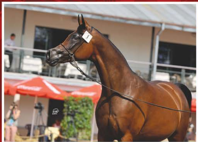
Eferada (QR Marc (US) x Efuzja)