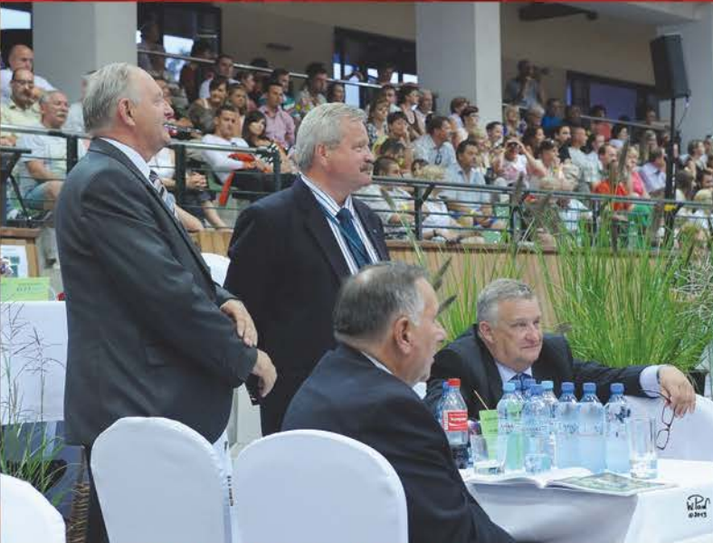
Polish state studs directors