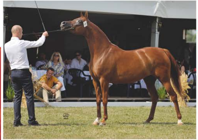
Palatina (QR Marc (US) x Palmeta)