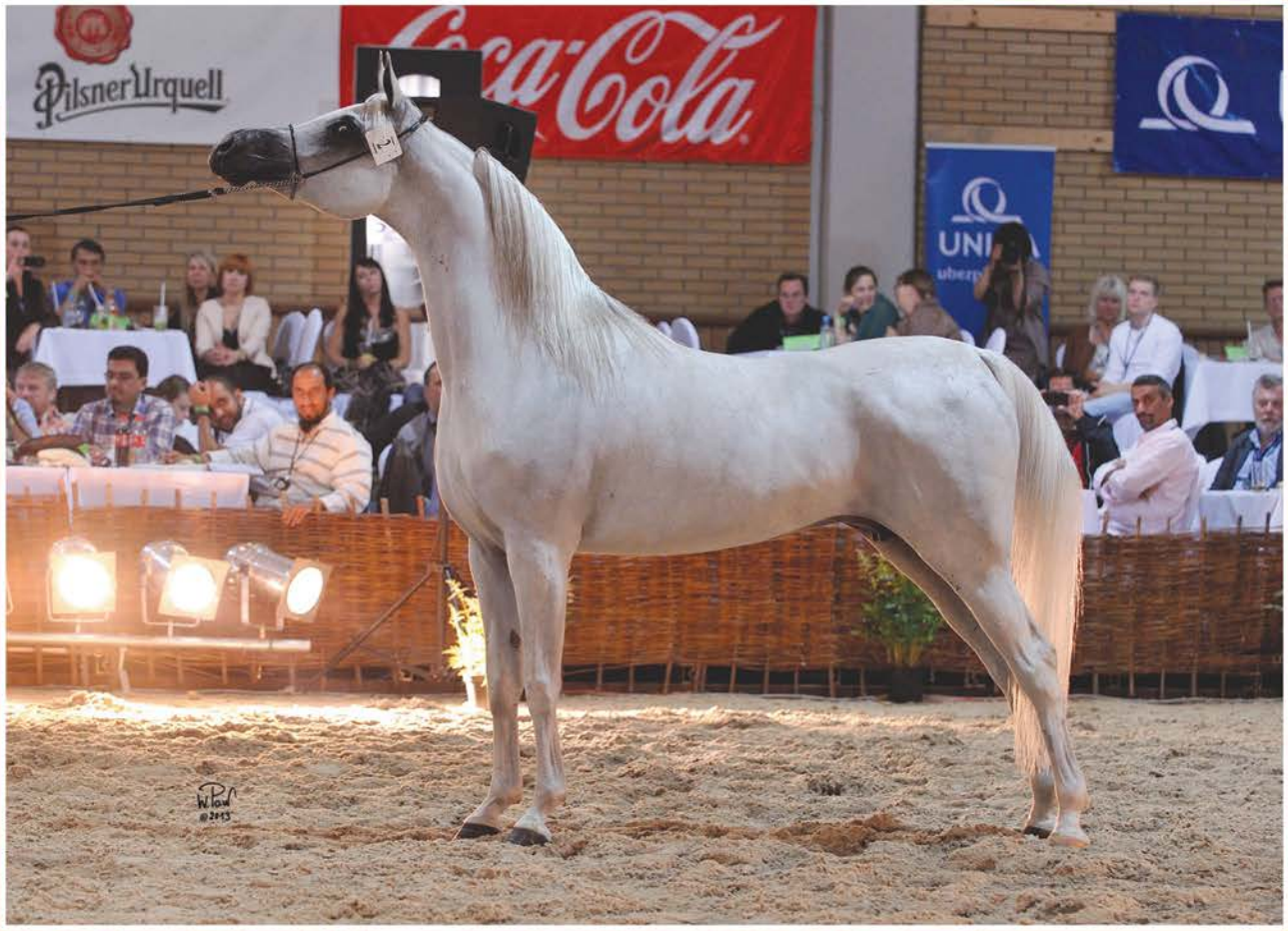
El Saghira (Galba (DE) x Emira)