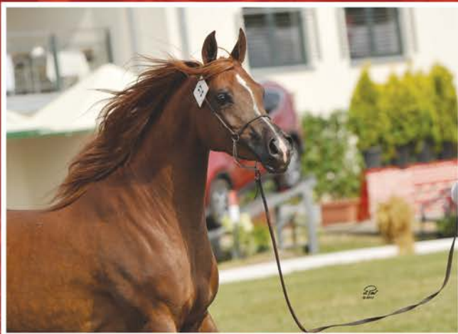
Espinilla (Al Maraam (IL) x Espadrilla)