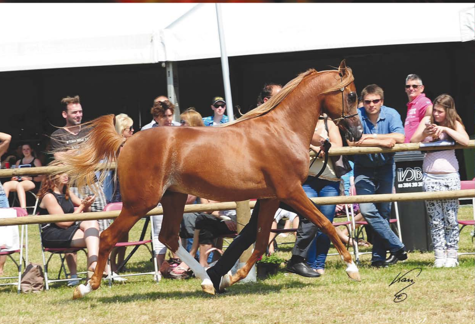
MAGILIAN APAL (GLORIUS APAL x MAGNOLIA APAL) KOENRAAD DETAILLEUR (BE)