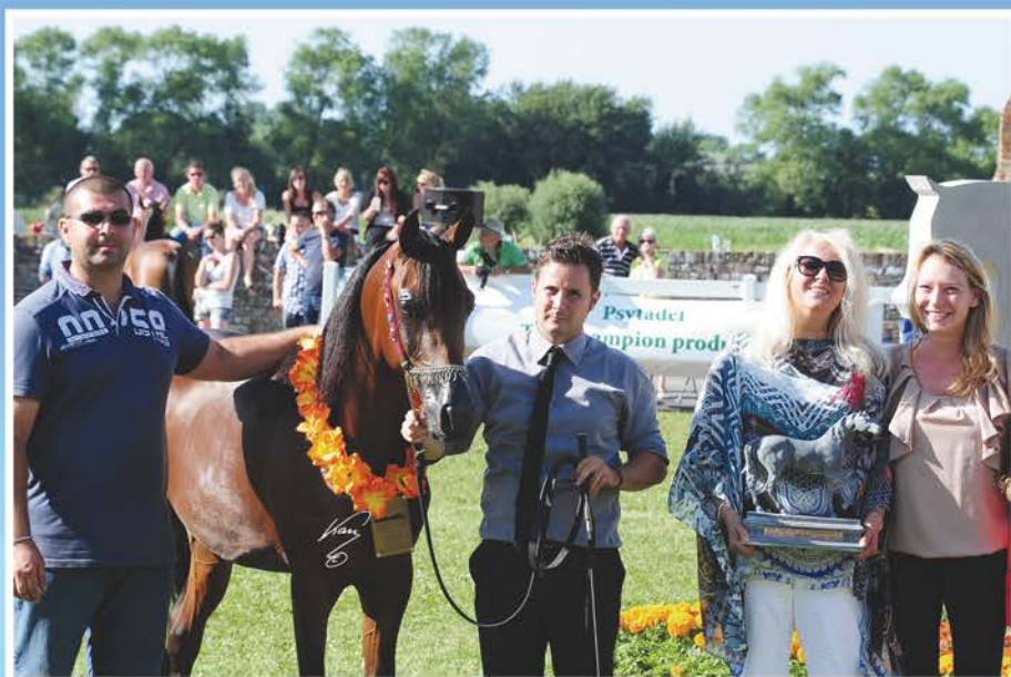
BRONZE YEARLING COLT RYYAN AL NAYFAT (KAHIL AL SHAQAB X RIYA) AL NAYFAT STUD (KSA)

Next to go were the stallions aged seven to nine years old. Only two participants and both sons of Al Lahab. Winner of