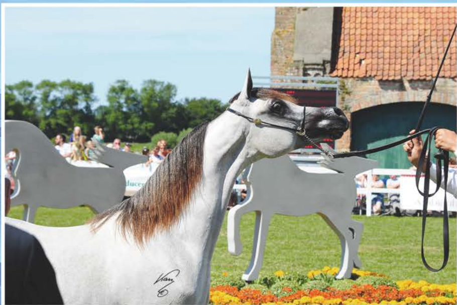
SILVER YEARLING COLT BEST BELGIAN HORSE EQUIBORN KA (QR MARC X ESPADRILLA) KNOCKE ARABIANS (BE)