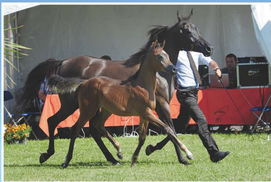
GOLD FILLY FOAL KATELYN JOY (PSYTADEL X SIEGERIN NY) JOY HORSES (BE)