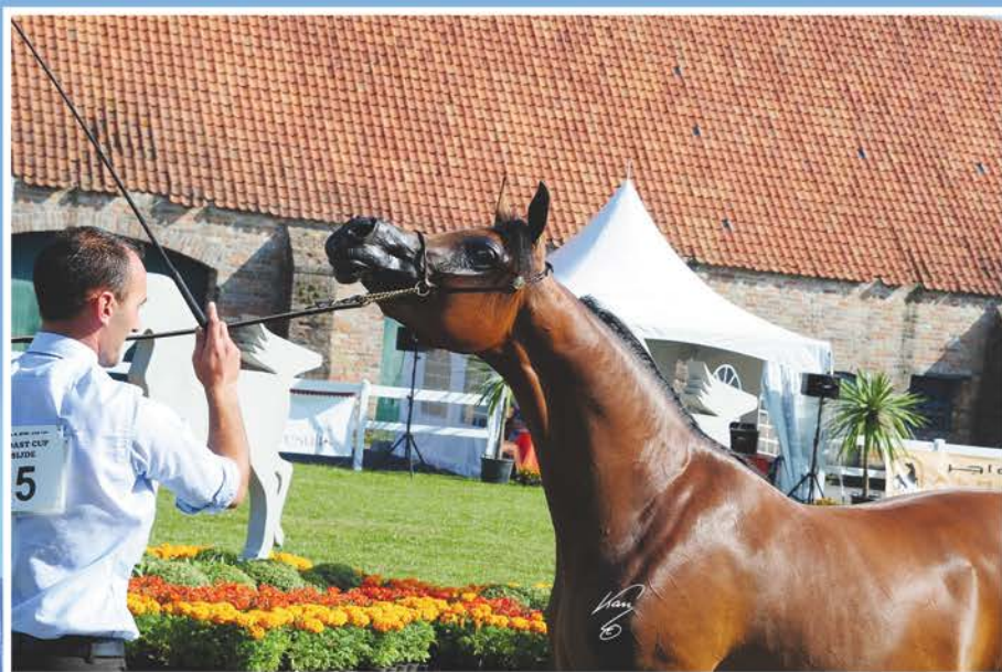
SILVER JUNIOR FEMALE FARAAH AC (MARHAABAH X HEART OF GOLD AC) AL KHALED FARM (KSA)

With this this 4th edition of the west coast cup came to an end. Again an excellent show with a great scenery and high quality horses! Definitely one on our list again for next year!