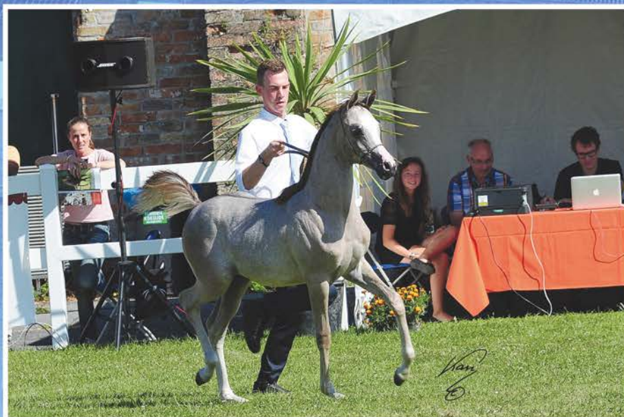
GOLD COLT FOAL AZERBEIDJAN (WH JUSTICE X EUPHORIA) SWAENEPOEL - SYS (BE)