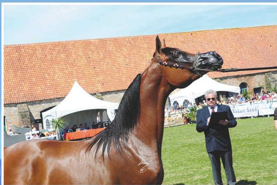
GOLD YEARLING COLT NASHMI AL HAWAJER (MARAJJ X HANIBA BINT IBN NARAV) AL HAWAJER STUD (AE)

The B-section of the yearling colts had some extra excitement as two horses scored the exact same score. Winner of the class with 91.83 points and later gold medal winner was Nashmi al Hawajer (Marajj x Haniba Bint ibn Narav) – bred and owned by Al Hawajer Stud from the UAE. Second in class with 91.17 points, winning on type and later silver medal winner was Equiborn KA (QR Marc x